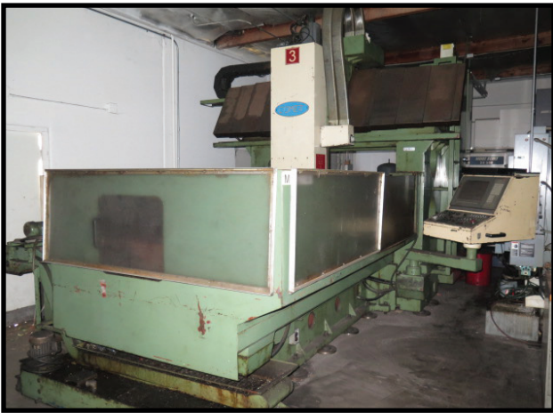
Comet VMC-2000G Bridge Style CNC VMC w/ Mitsubishi Controls, 30-ATC, CAT-50