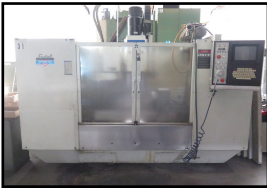
1993 Fadal VMC4020 4-Axis CNC VMC w/ CNC88HS Controls, 21-ATC, CAT-40