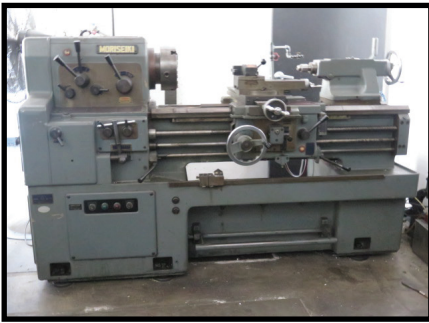
Mori Seiki MS-850 17" x 36" Geared Head Gap Bed Lathe w/ 1800 RPM, Inch Threading, Tailstock