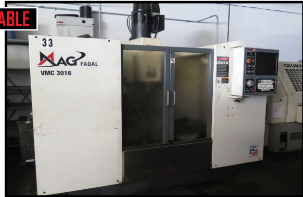
2007 MAG Fadal VMC3016HT CNC VMC w/ MultiProcessor Controls, 21-ATC, CAT-40, 10K RPM, Metric Ball Screws, Rigid Tapping