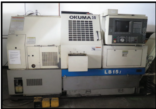
Okuma LB15 II CNC Turning Center w/ OSP7000L Controls, 12-Station Turret, Tailstock, Parts Catcher