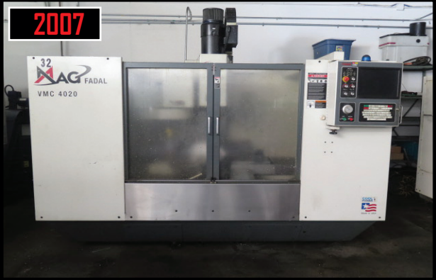
2007 MAG Fadal VMC3016HT CNC VMC w/ MultiProcessor Controls, 21-ATC, CAT-40, 10K RPM, Metric Ball Screws, Rigid Tapping