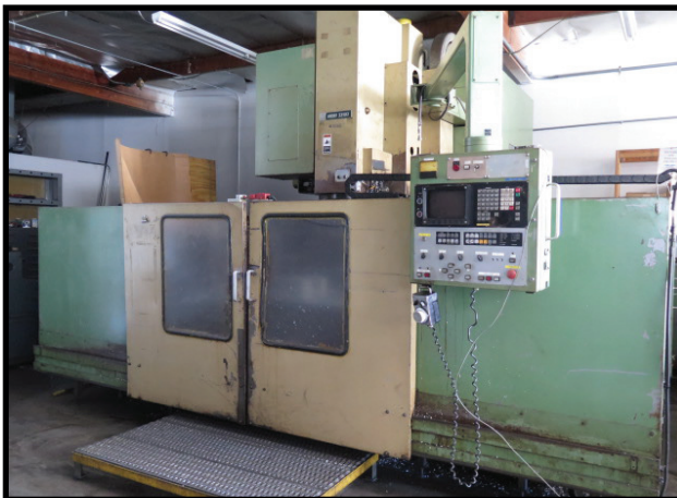
Mori Seiki MV-80A CNC VMC w/ Fanuc 11M Controls, 40-ATC, CAT-50