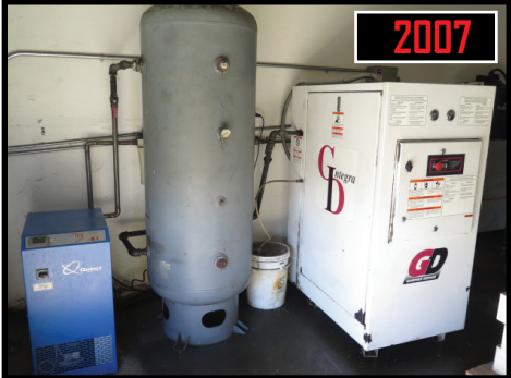
2007 Gardner Denver Air Compressor System