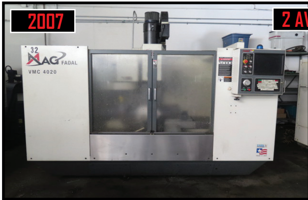
2007 MAG Fadal VMC3016HT CNC VMC w/ MultiProcessor Controls, 21-ATC, CAT-40, 10K RPM, Metric Ball Screws, Rigid Tapping