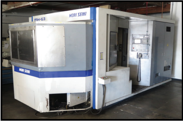
Mori Seiki MH-63 2-Pallet 4-Axis CNC HMC w/ Fanuc MF-M6 Controls, 60-ATC, CAT-50, 4 th Axis @ 1 Deg, 6,000 RPM