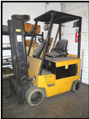
Hyster E50XL-33 4800 Lb Electric Forklift w/ Charger