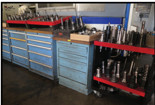
Partial View of Machine Tooling