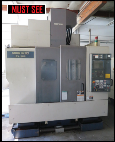
Dec/99 SV-500/50 CNC VMC w/ MSC-501 Controls, 30-ATC, CAT-50, Thru Spindle Coolant