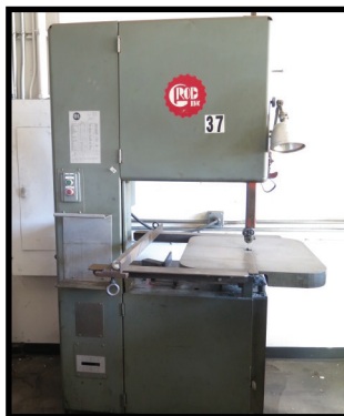
Grob 4V-24 24" Vertical Band Saw