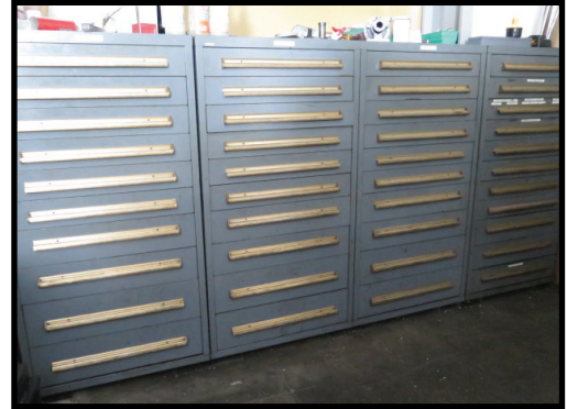
Equipto Tooling Cabinets