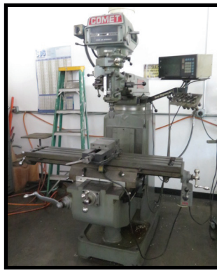
Hyster E50XL-33 4800 Lb Electric Forklift w/ Charger