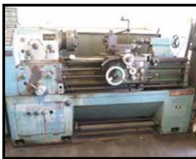
Victor mdl. 1640 16" x 40" Geared Head Gap Bed Lathe