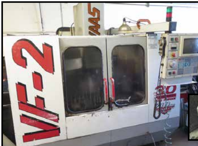
1998 VF-2 4-Axis CNC Vertical Machining Center w/ 21-Station ATC, CAT-40 Spindle, 10,000 RPM