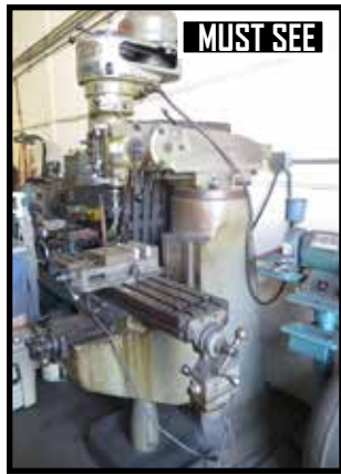
Bridgeport Vertical Mill