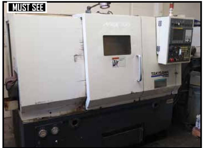
Takisawa NEX-108 CNC Turning Center w/ Fanuc Series 0i-TC Controls