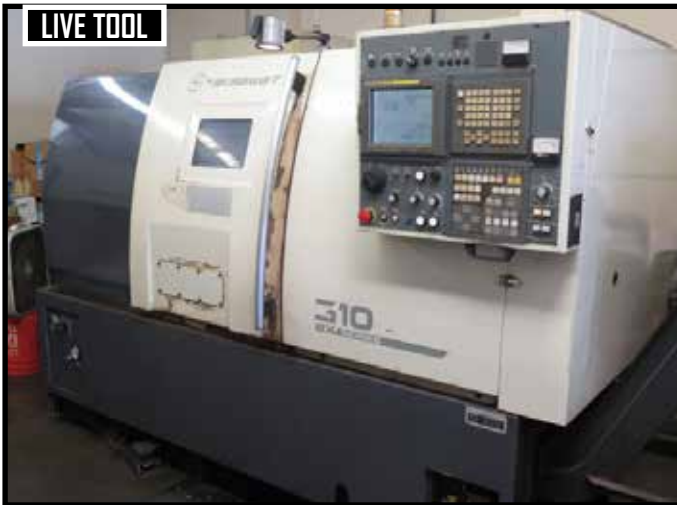
Takisawa-T EX-310 Live Turret CNC Turning Center w/ Fanuc Series 21i-TB Controls