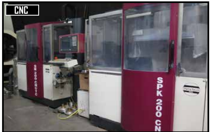
1999 OptoTech GmbH SM200 CNC TC-D and SPK200 CNC-D CNC Lens Grinding and Polishing Machines w/ Siemens Sinumerik Controls