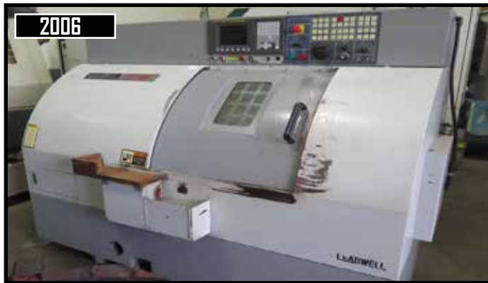
2006 Leadwell T-5 CNC Cross Slide Lathe w/ Fanuc 0i Mate-TC Controls