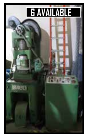
Bruderer BSTA-30 33-Ton High Speed Stamping Presse w/ 100-600 Hits/Min