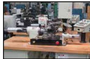
Hardinge Optical Lathe