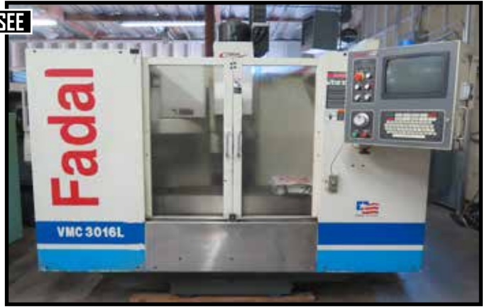
2000 Fadal VMC 3016L CNC Vertical Machining Center w/ Fadal Multitprocessor Controls, 21-ATC, CAT-40