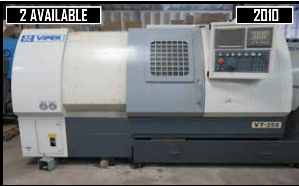
2010 Mighty Viper VT-25B CNC Turning Centers w/ Fanuc Oi-TD Controls, 12-Station Turret