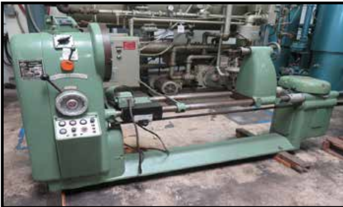
Heinrich Schumann, Lubeck Coil Winder s/n 230120 w/ 29 1/2" x 39 1/2" Cap, 10-670 RPM