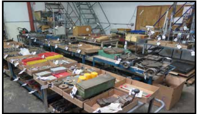
Large Quantity of Tooling and Inspection Equipment