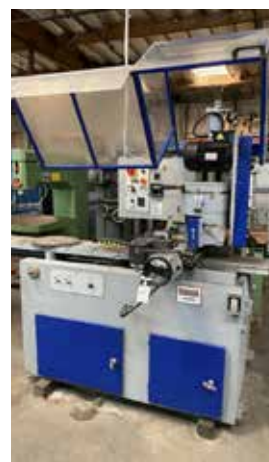
DAKE Automatic Cold Saw Model OMP EUROMATIC 370 PPL 14.5"