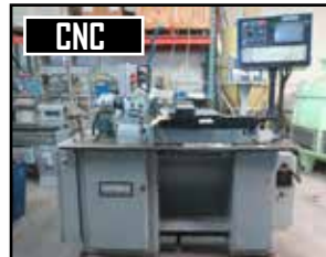
Hardinge Omni Turn CNC Lathe