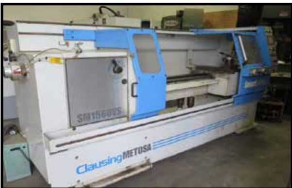
2001 Clausing Metosa SM1560VS 15" x 60" "Smart Lathe" Soft CNC Gap Bed lathe s/n 42299 w/ GE Fanuc Quick Panel PLC Controls, 5C Collet Nose, Tailstock, Phase II Tool Post, Coolant.

Branson B-250-RS Ultrasonic Cleaning System