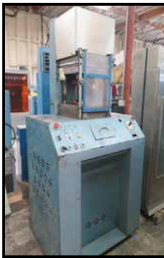
Ferrara HY50-4P-DS Hydraulic Coining Press