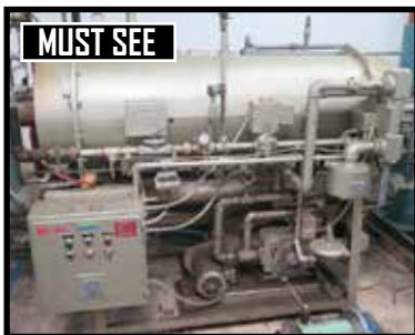
Lindberg Type 16-5000-HYEX LEAN 5000 CFH Exothermic Gas Generator