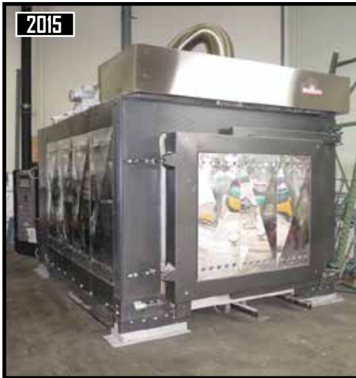
2015 Italforni Pesaro TT600X 600kW Ventilated Electric Kiln w/ Italforno Controls, 48" x 60" x 84" Roll-Out Chamber Car