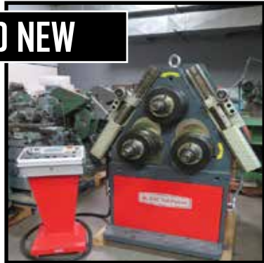
2019 Akyapak (NEW) mdl. APK101 4" x 4" Angle Roll w/ Akyapak Digital Controls, Hydraulic Support and Guide Rollers