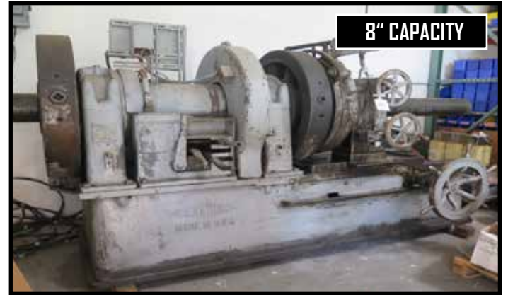
Landis Type 8 8" Pipe Threader w/ 8.3-23.5 RPM, (2) 33" 3-Jaw Chucks