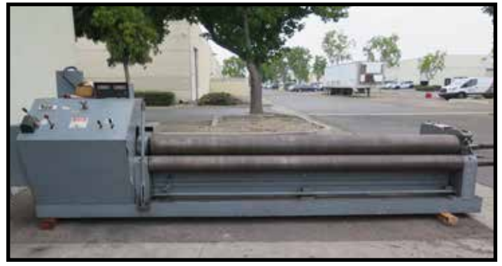
Grenen / Branch Hydraulics Type HPV6-2.5 106" Hydraulic Power Roll