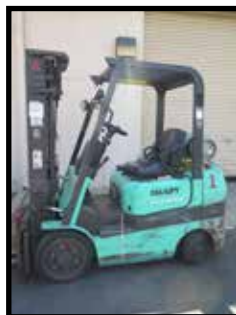
Mitsubishi FGC25K 5000 Lb Cap LPG Forklift