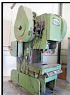
Heim 120 Ton, 55 Ton and 32 Ton Stamping Presses