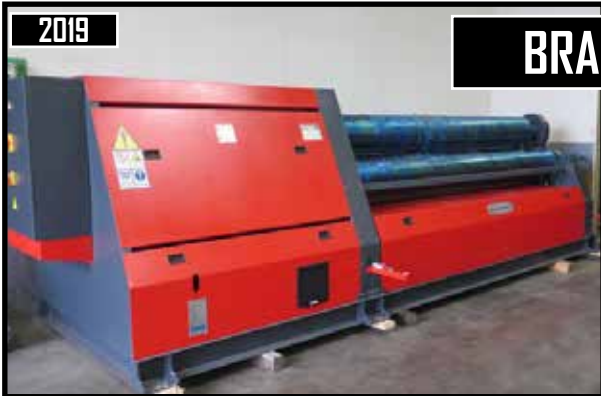
2019 Akyapak (NEW) AHS 30-13 10' Hydraulic 4-Roller Plate Roll w/ Akyapak Touch Screen Controls