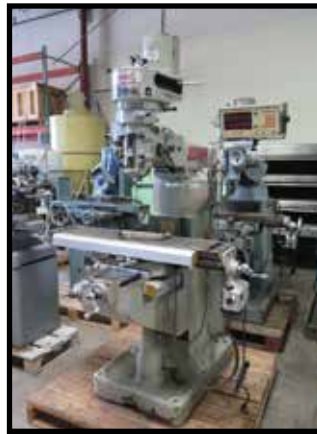
Comet Vertical Mill w/ Quality-800 DRO, Power Feed