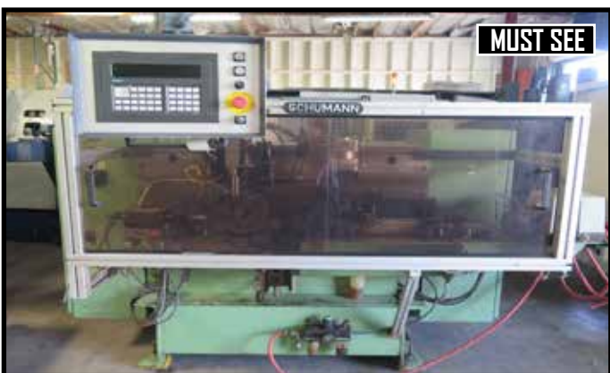
Heinrich Schumann, Lubeck Type 4010 CNC Coil Winder s/n 4010-037w/ Siemens Controls