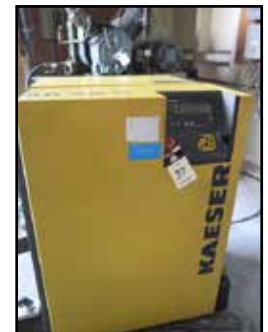
Kaesar Sk 20 Rotary Air Compressor