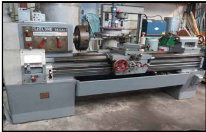
LeBlond Regal 19" x 56" Geared Head Lathe