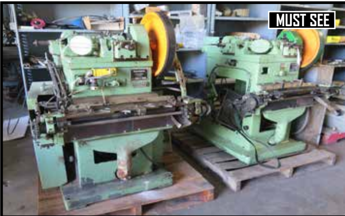
Buendgens type US and US-2 Nail and Brad Formers