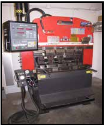
1990 AMADA RG-35S, 4FT X 35 TON CNC PRESS BRAKE,