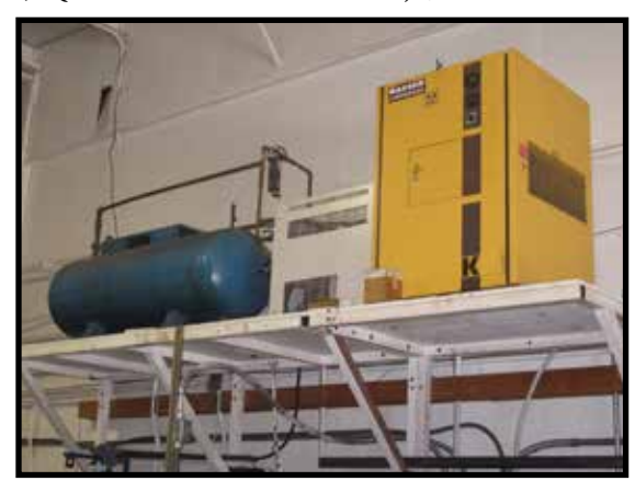
KAESER ROTARY AIR COMPRESSOR WITH DRYER AND TANK.