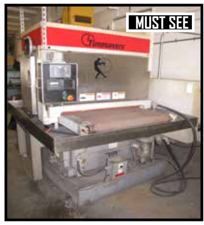
TIMESAVER MODEL 137-1HDMW 37" WET WIDE BELT GRAINER, W/ QUICK