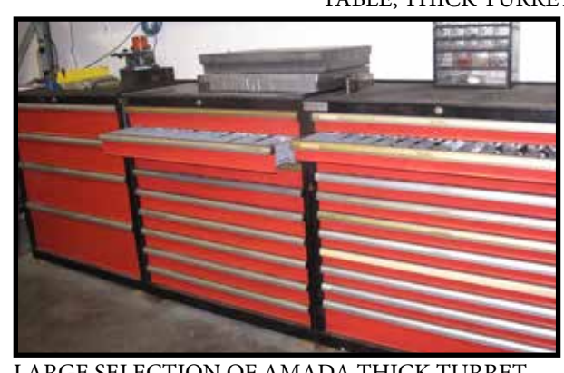
LARGE SELECTION OF AMADA THICK TURRET TOOLING WITH CABINETS.