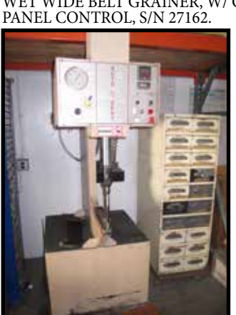
AUTO SERT MODEL X7 HYD INSERTION PRESS, S/N 00186.