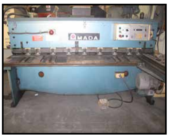
AMADA M-2045, MECHANICAL 73.74" X 3/16" POWER SHEAR, W/ CNC BACK GAGE, SQ ARM.