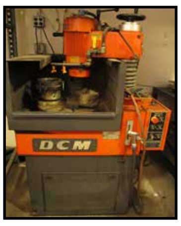
DCM MODEL PDG-5-3 ROTARY DISC GRINDER, S/N 435589.