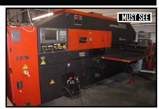
1998 AMADA VIPROS-255 CNC HYD TURRET PUNCH, 22 TON, W/ FANUC 18i CONTROL, BRUSH TABLE, THICK TURRET, S/N VP2550096.