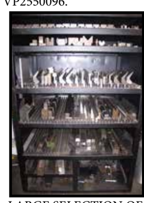
LARGE SELECTION OF AMADA FORMING DIES.