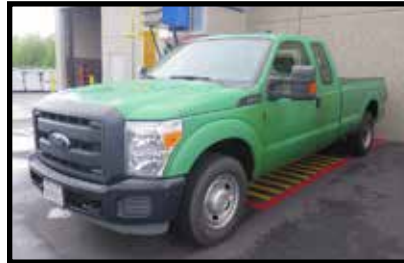
2012 Ford F-250 Super Duty Extended Cab Truck