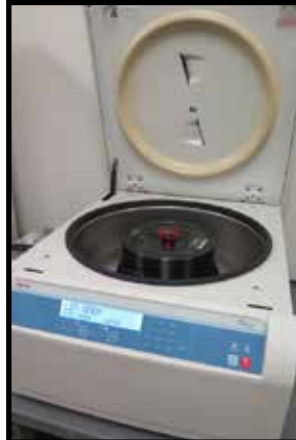
2012 Thermo Scientific "Extend XT" Centrifuge