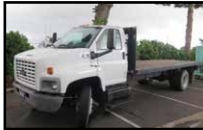
2005 Chevrolet C6500 18' Stake Bed Truck