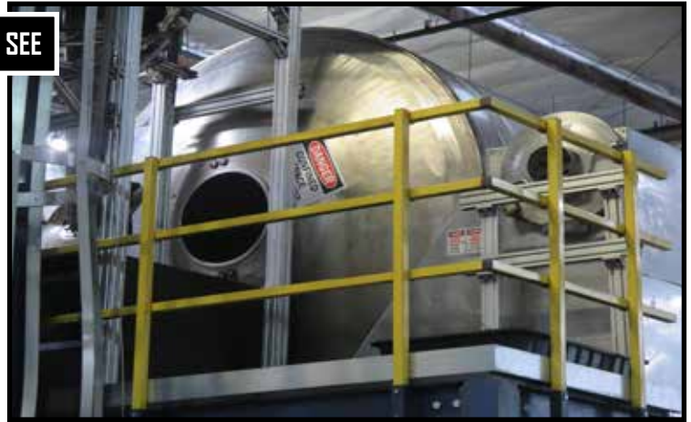
STAINLESS STEEL TUMBLER