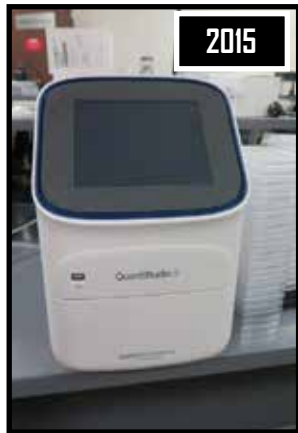
2015 Applied Biosystems "Quant Studio" 3Real-Time PCR System