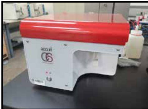
2008 Accuri Cytometers "Accuri C6" Flow Cytometer