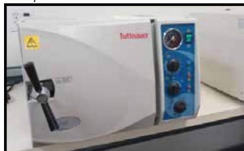
Tuttnauer 2540M Autoclave Steam Sterilizers