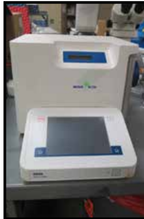
2012 Nutec "EDDYJET" 2" Spiral Plating System