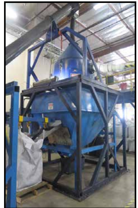
CMI MDL. EBWB 36-R CENTRIFUGE S/N 14-101 WITH 50HP MOTOR