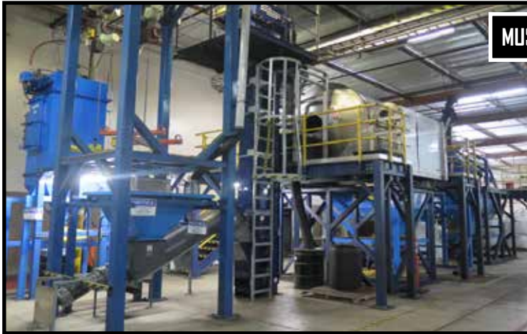
AGRITECH PRODUCTS MANUFACTURING LINE