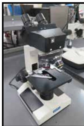
Omax Stereo Microscope