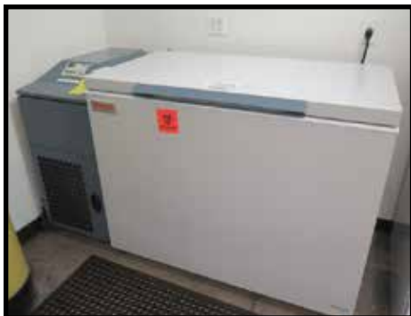
Thermo Scientific 5813 -80 Deg Sub-Zero Chest Freezer