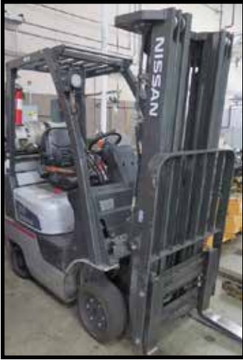
Nissan MCP1F1A18EM 3200 Lb Cap LPG Forklift