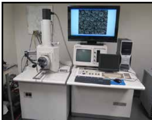
Hitachi S-2700 Scanning Electron Microscope