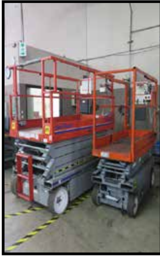
Skyjack SJM 4626 and SJM 3015 Scissor Lifts