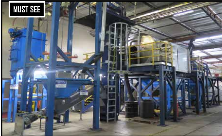
AGRITECH PRODUCTS MANUFACTURING LINE