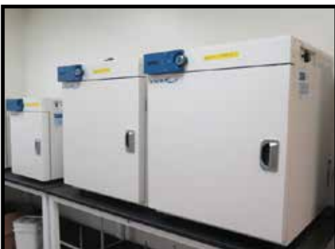
VWR Gravity Convection Ovens