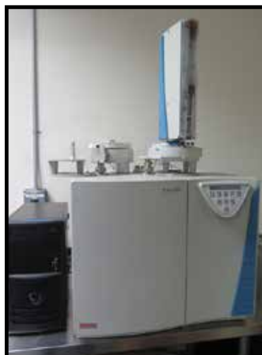
Thermo Scientific "Flash 2000" CHNS/O Organic Element Analyzer