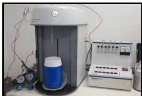
Micrometronics "TriStar II PLUS 3030" Analyzer