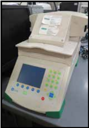
Bio Rad ICycler PCR Thermal Cycler