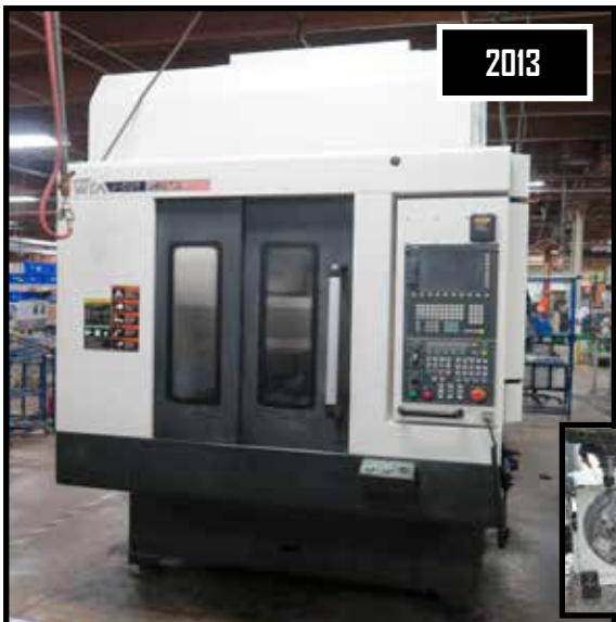
2013 Hyundai WiA i-Cut 380 TDi 4-Axis 2-Pallet CNC Vertical Machining Center w/ Sinumerik 828D Controls, 20-ATC, CAT-40, 12,000 RPM