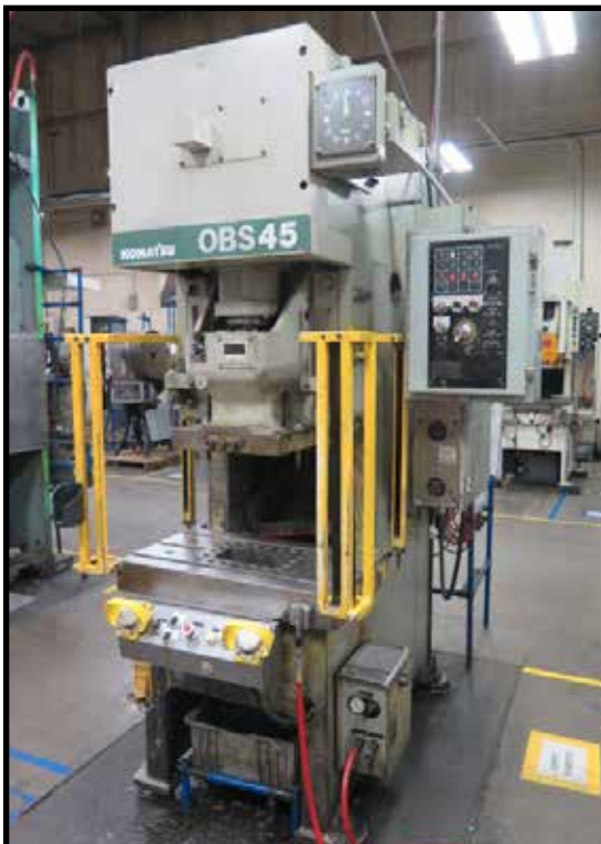
1999 Komatsu OBS45-32B 45 Ton Gap Frame Stamping Press w/ Komatsu Controls