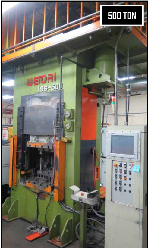
Wetor 165-50 500 Ton Hot Forging Hydraulic Press w/ Phoenix Contact Touch Screen Controls, 40 Ton Pull-Out Force