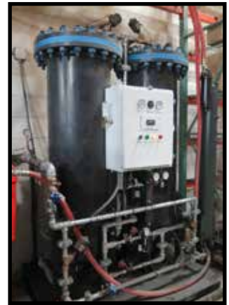
Clifton mdl. 503SPL APP 300 Ton 4-Post Hydraulic Forging Press w/ Allen Bradley DTAM M100 Digital Controls