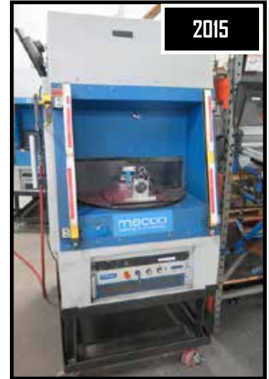
2015 Mecco Marking and Traceability "WinLase LEC-1 MeccoMark" 20kW Fiber Laser Marking System