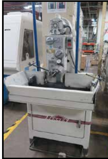
Sunnen MBB-1660 Honing Machine