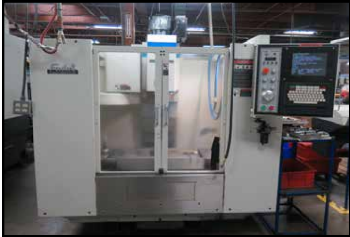
1995 Fadal VMC3016 4-Axis CNC Vertical Machining Center w/ CNC88HS Controls, 21-ATC, CAT-40 5739 Setting Probe, 10,000 RPM, Mayfran Chip Conveyor, Coolant.