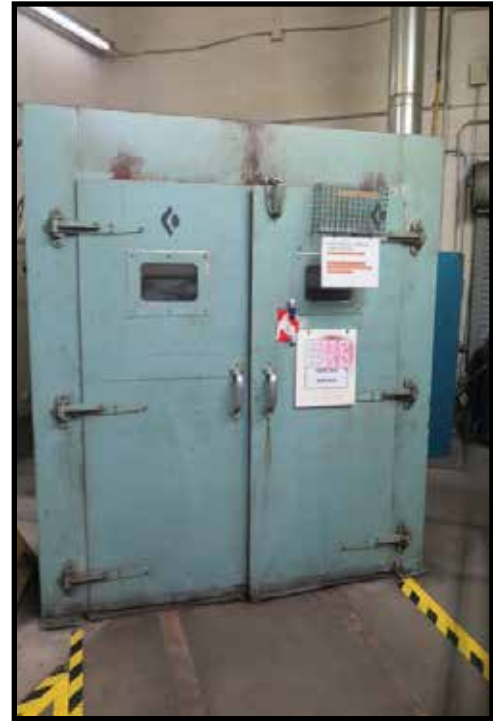
Despatch PSC3-24R 500 Deg F. Industrial Oven

ALL MACHINERY MOVERS MUST BE APPROVED BY THE SELLER PRIOR TO REMOVAL OF EQUIPMENT