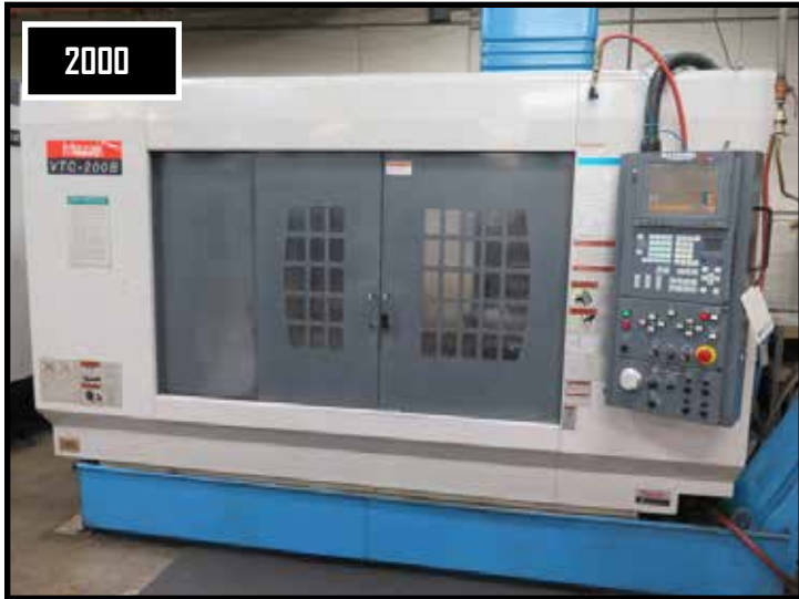
2000 Mazak VTC-200B CNC Vertical Traveling Column Machining Center w/ Mazatrol PC-Fusion-CNC 640M Controls, 24-ATC, CAT-40 Spindle, 10,000 RPM