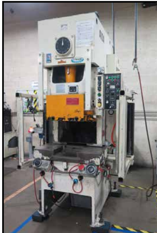
Aida NC1-60 60 Metric Ton (66 US Ton) Stamping Press w/ Aida Controls

Cincinnati 175 OBS 175 Ton Open Back Stamping Press s/n 43894 w/ Cincinnati Touch Screen Controls, 10" Stroke, 30" x 50" Bolster Area, 24" x 50" Ram Area.