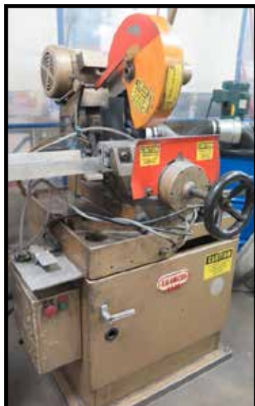
Kalamazoo CA-350P Miter Cold Saw