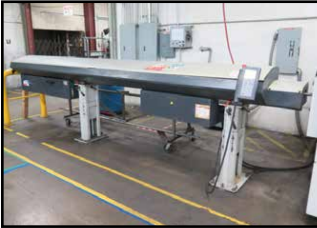
LNS Hydrobar Express 332 Automatic Bar Loader/Feeder