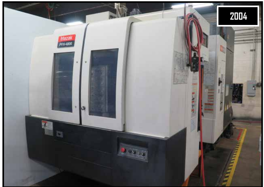
2004 Mazak PFH-4800 4-Axis 2-Pallet CNC Horizontal Machining Center w/ Mazatrol 640M Controls, 80-Station ATC, CAT-40 Spindle, 15,000 RPM