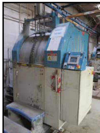
Mass Finishing H160 4-Drum Media Tumbling System w/ Panel View PLC Controls **2-AVAILABLE**