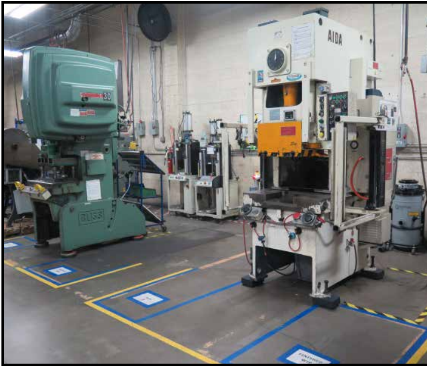
Aida and Bliss Presses