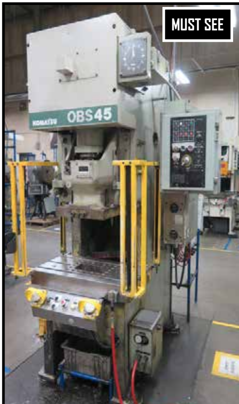
1999 Komatsu OBS45-32B 45 Ton Gap Frame Stamping Press w/ Komatsu Controls