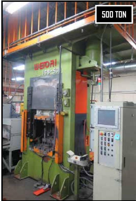
Wetori ISS-500 500 Ton Hot Forging Hydraulic Press w/ Phoenix Contact Touch Screen Controls, 40 Ton Pull-Out Force