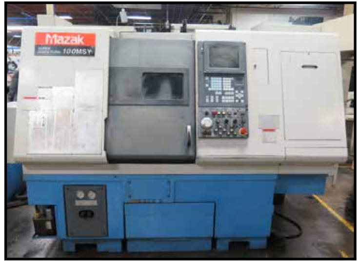
2000 Mazak Super Quick Turn 100MSY Twin Spindle Live Turret CNC Turning Center w/ Mazatrol PC-Fusion-CNC 640 Controls, Tool Presetter, 12-Station Live Turret