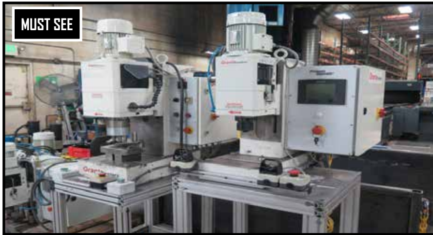
Grant Riveters G012 and G008 Orbital Riveters