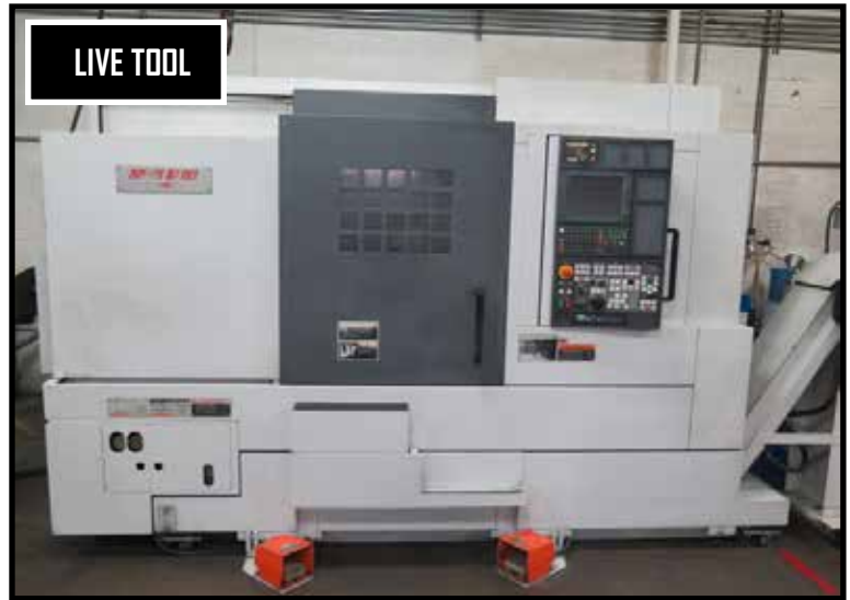
2005 Mori Seiki NL2500SY/700 Twin Spindle Live Turret CNC Turning Center w/ MSX-850 III Controls, Tool Presetter, 12-Station Live Turret