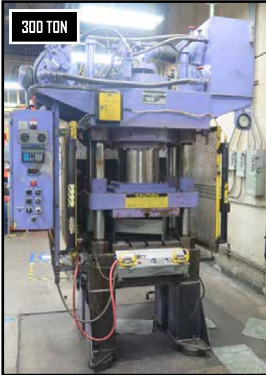
Clifton mdl. 503SPL APP 300 Ton 4-Post Hydraulic Forging Press w/ Allen Bradley DTAM M100 Digital Controls