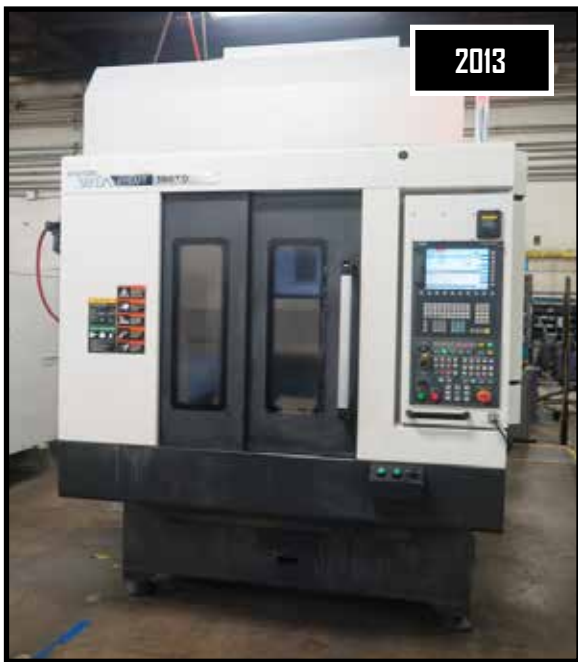
2013 Hyundai WiA i-Cut 380 TDi 2-Pallet CNC Vertical Machining Center w/ Sinumerik 828D Controls, 20-ATC, CAT-40, 12,000 RPM