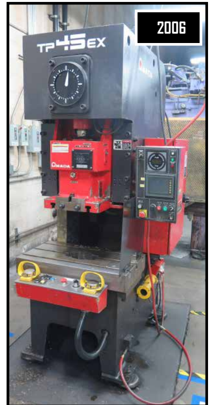
2006 Amada TP45EX 45 Metric Ton (49.5 Short Ton) Gap Frame Stamping Press w/ Amada Touch Screen Controls