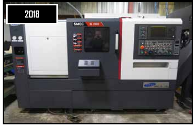
2018 SMEC Samsung Machine SL2000 CNC Turning Center w/ Fanuc Oi-TF Controls