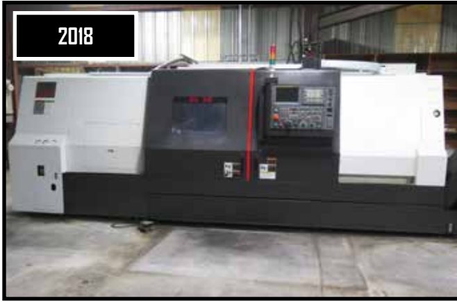
2018 SMT Samsung Machine Tools SL35/1500 CNC Turning Center w/ Fanuc Oi-TD Controls, Tool Presetter, 5.2" Through Spindle