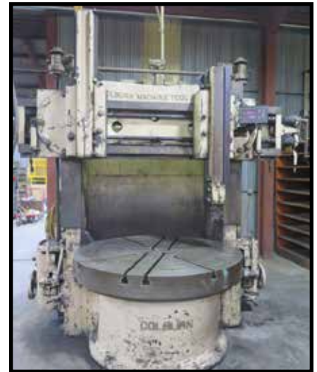
Colburn Machine Tools 60" Vertical Turret Lathe w/ Sargon DRO, Vari-Drive Conversion