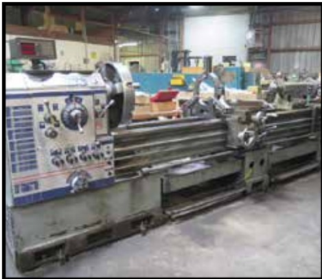
Tuda TudorMax 23" x 118" Geared Head Gap Bed Lathe w/ Sargon DRO