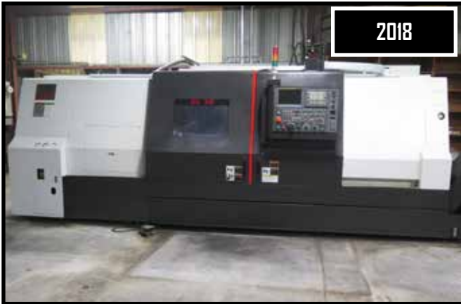
2018 SMT Samsung Machine Tools SL35/1500 CNC Turning Center w/ Fanuc Oi-TD Controls, Tool Presetter, 5.2" Through Spindle

PRESORTED First-Class Mail U.S. Postage PAID STA CLARITA, CA Permit No. 298