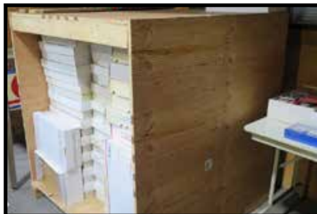
Fleer, Tops, Donruss, Upper Deck and Specialty Manufacturers Baseball Cards, Football Cards, Basketball Cards