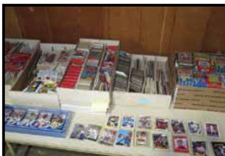
Partial View of Cards **APPROX 500,000 CARDS**