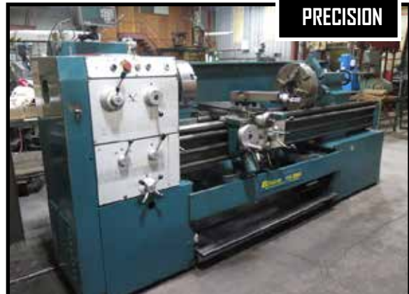
Enco 20" x 80" Geared Head Gap Bed Lathe w/ Acu-Rite DRO, 3 1/8" Thru Spindle