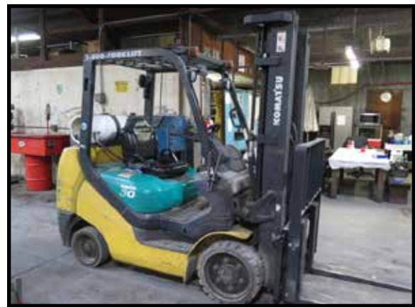
2009 Komatsu FG30SHT16 5850 Lb Cap LPG Forklift