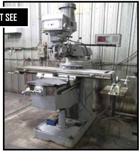
Enco Vertical Mill w/ Enco DRO