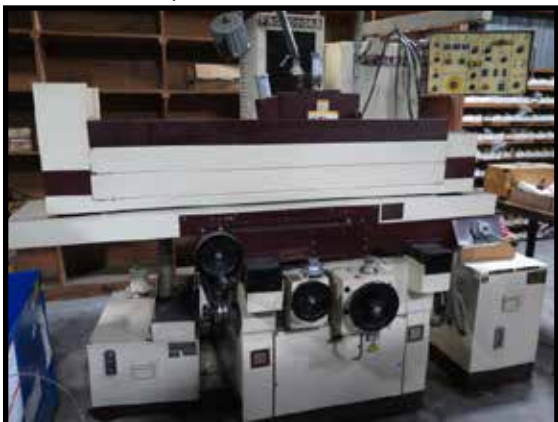
Falcon Chevalier FSG-1020AD 10" x 20" Auto Hydraulic Surface Grinder

Cincinnati No. 5 Horizontal Mill w/ 16-443 RPM, 50-Taper Spindle, Universal Vertical Milling Head, Box Ways, Power Feeds, Arbor Support, 21" x 83" Table, Coolant.