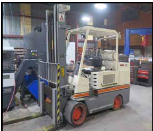
Allis Chalmers ACC-120-RL-2PS 13,000 Lb Cap LPG Forklift