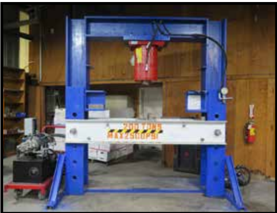
Custom 200 Ton Hydraulic H-Frame Press