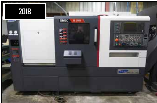
2018 SMEC Samsung Machine SL2000 CNC Turning Center w/ Fanuc Oi-TF Controls