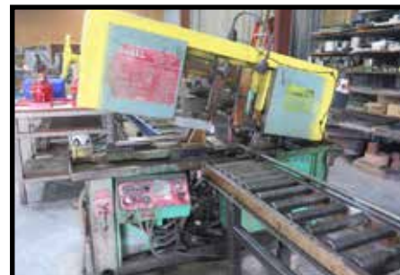
DoAll C-90 12" Horizontal Band Saw