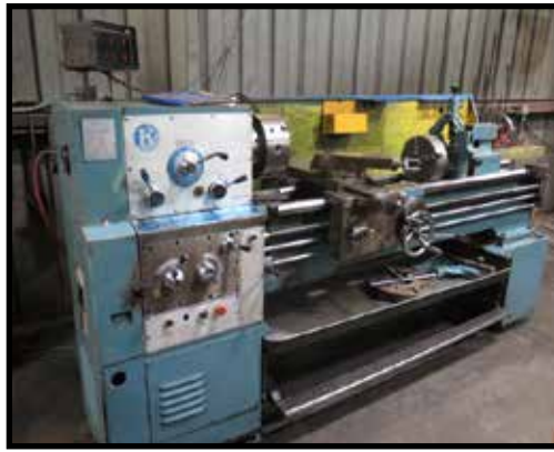
Enco 17 1/2" x 65" Geared Head Gap Bed Lathe w/ Enco DRO