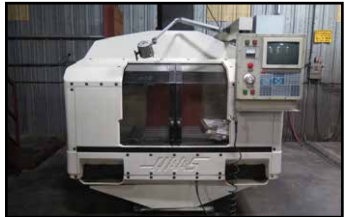
1992 Haas VF-0 4-Axis CNC Vertical Machining Center w/Haas Controls