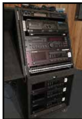
Professional Audio Recording Equipment