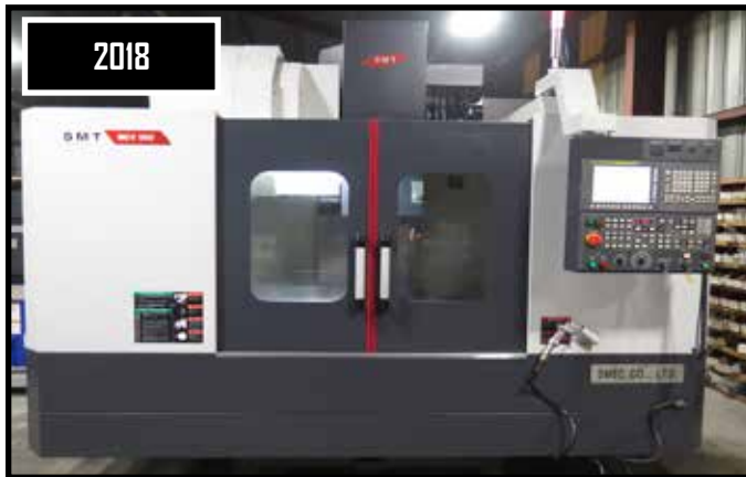
2018 SMT Samsung Machine Tools MCV500 CNC Vertical Machining Center w/ Fanuc Oi-MFControls, 30-ATC, CAT-40