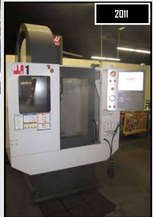
2011 HAAS DT-1 CNC VMC MILL/DRILL CENTER, 20 ATC, S/N 1033174.