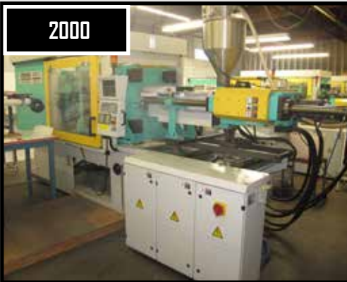
2000 ARBURG ALLROUNDER 470 C 1300-675, 130 TON INJECTION MOLDER W/ CONTROLS.