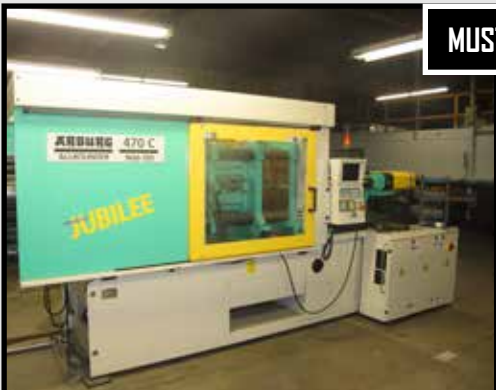
ARBURG ALLROUNDER 470 C 1600-350, 160 TON INJECTION MOLDER (NEED BOARD)