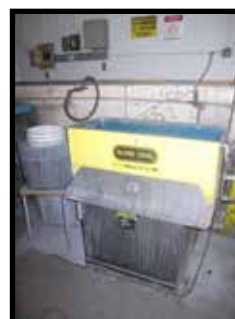
BURR KING TUMBLER