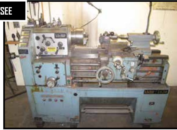
VICTOR 16 X 30 GAP ENGINE LATHE WITH DIALS.