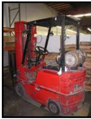
MITSUBISHI 3000 LB LPG FORKLIFT, SIDE SHIFT, 3 STAGE.