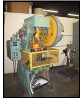
JOHNSON 35 TON OBI PUNCH PRESS, W / 110 SPM.