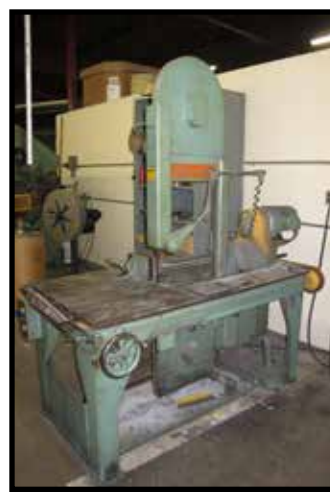
MARVEL 8/M8/M3 18" TILTING VERTICAL BAND SAW