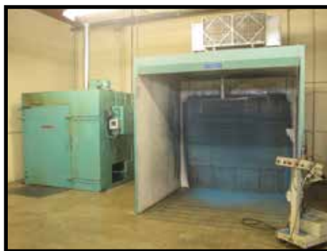
BLEEKER BROS POWDER COAT BATCH SPRAY SYSTEM W/ GUNS