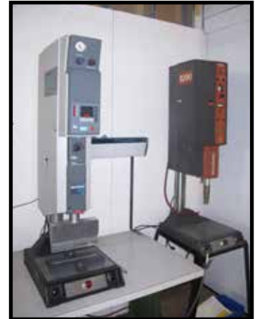
BRANSON 900 & 8200 SERIES ULTRASONIC WELDERS.