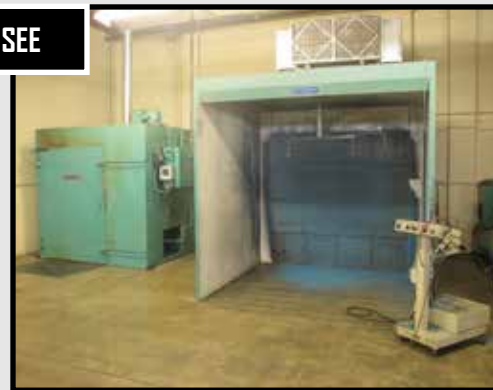
BLEEKER BROS POWDER COAT BATCH SPRAY SYSTEM W/ GUNS