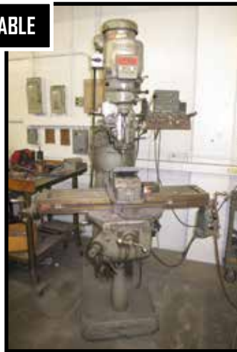
(1 OF 4) BRIDGEPORT VERTICAL MILLING MACHINES.