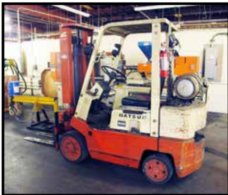
DATSUN 5000 LB LPG FORKLIFT, SIDE SHIFT, 2 STAGE.