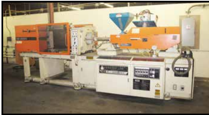
TM200MS 220 TON INJECTION MOLDING MACHINE.