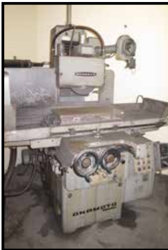
OKOMOTO 12" X 24" HYD SURFACE GRINDER W/ ACCUGAR 124.