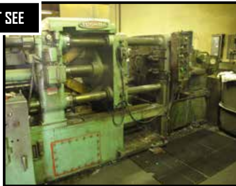
TOSHIBA 250 TON ZINC/AL MODEL DC250A DIE CASTING MACHINE.