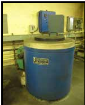
(1 OF 4) DENISON MULTIPRESS HYD PRESS.