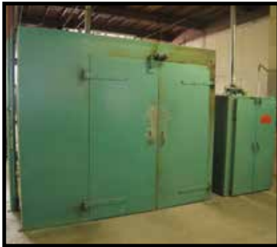
WALK IN OVENS FOR BATCH POWDER COATING.