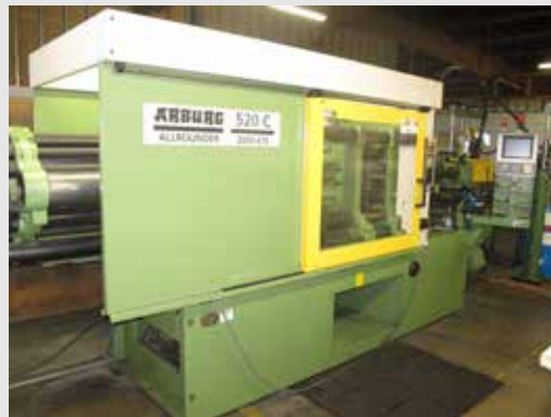
ARBURG ALLROUNDER 520 C 2000-675, 200 TON INJECTION MOLDER, WITH SILICON INJECTION SCREW OPTION.