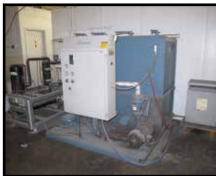
ADVANTAGE CPTS-500-2P WATER CHILLER.

PLASTIC GRANULATORS, CHILLERS, TEMPERATURE CONTROLLERS. BLEEKER BROS POWDER COAT BATCH SPRAY SYSTEM W/ GUNS. 8958 WALK IN OVENS FOR BATCH POWDER COATING. CASTMASTER 400 TON ZINC/AL TOGGLE TYPE DIE CASTING MACHINE. TOSHIBA 250 TON ZINC/AL MODEL DC250A DIE CASTING MACHINE. LESTER PHOENIX 150 TON ZINC / AL DIE CASTING MACHINE. CASTMASTER 100 TON TOGGLE ZINC/AL DIE CASTING MACHINE. CONAIR TEMPERATURE CONTROLLERS AND CHILLERS. MITSUBISHI 3000 LB LPG FORKLIFT, SIDE SHIFT, 3 STAGE. DATSUN 5000 LB LPG FORKLIFT, SIDE SHIFT, 2 STAGE. PYRO SYSTEM 600AMC MELTING FURNACE IR 25 HP ROTARY AIR COMPRESSOR. IMS HOPPERS AND DRYERS.