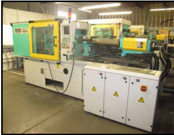
2000 ARBURG ALLROUNDER 420 C 1000-350, 100 TON INJECTION MOLDER (NEED BOARD)