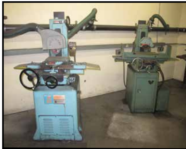
B AND S SURFACE GRINDERS.