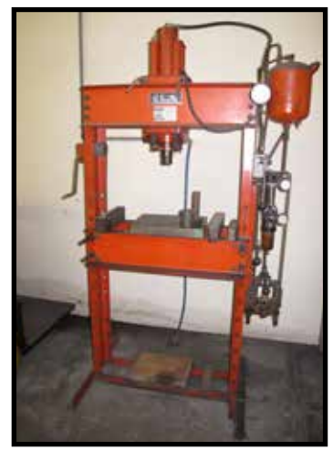
NUGIER H40-14, 40 TON HYD PRESS.