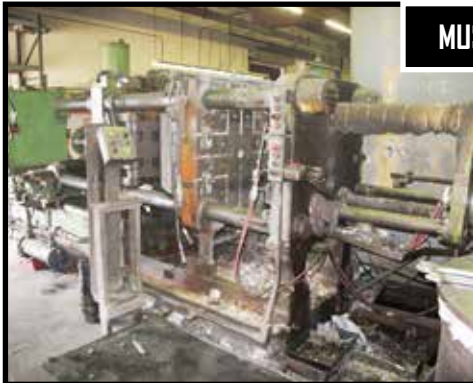
CASTMASTER 400 TON ZINC/AL TOGGLE TYPE DIE CASTING MACHINE.