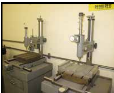
2) CO-CHECK CMM MODEL 100.