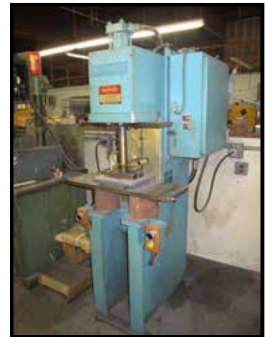
(1 OF 4) DENISON MULTIPRESS HYD PRESS.