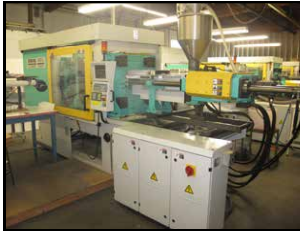
2000 ARBURG ALLROUNDER 470 C 1300-675, 130 TON INJECTION MOLDER W/ CONTROLS.