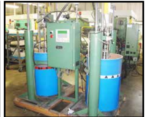
4) FLUID AUTOMATION SILICON PUMP STATIONS WITH SIEMENS CONTROL, MODEL E4-55-55.