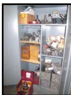
LARGE SELECTION OF INSPECTION TOOLS.