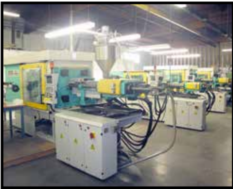
INJECTION MOLDING DEPARTMENT

PRESORTED First-Class Mail U.S. Postage PAID STA CLARITA, CA Permit No. 298