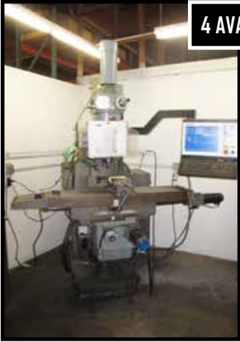
(1 OF 4) SHIZUKA CNC MILLS W/ CENTROID CNC CONTROLS.