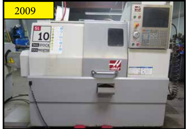
2009 Haas SL-10 CNC Turning Center w/ Haas Controls, Tool Presetter, 12-Turret, Tailstock, 6000 RPM, Rigid Tapping