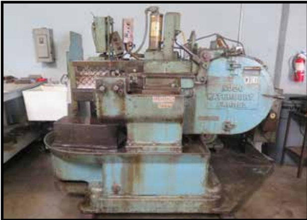
Waterbury Farrel No. 20 Thread Crush Rolling Machine