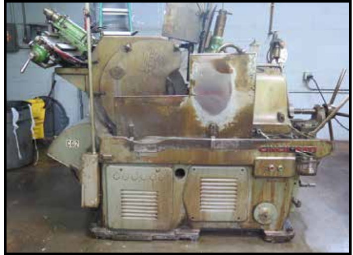
Cincinnati OM Centerless Grinder w/ 24" Grinding Wheel Cincinnati EA Centerless Grinder w/ 24" Grinding Wheel