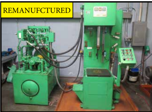
BMS US BROACH PB518 Hydraulic Vertical Broaching Machine (REMANUFACTURED)