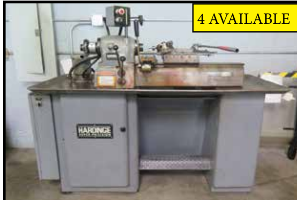
Hardinge DV-59/DSM-59 Narrow Bed Second OP Lathe 4 -AVAILABLE**