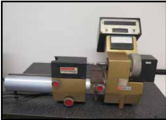
Pratt & Whitney mdl. C Super Micrometer

Clark GCS25MB 4500 Lb Cap LPG Forklift s/n G138MB-0127-6830FA w/ 3-Stage Mast, 188" Lift Height, Cushion Tires. Forklift Barrel Grabber, Barrel Stands. Forklift Safety Cage. Cantilever Material Racks. Josef Kihlberg Box Stapler. Conference Table. Office Furniture. Work and Assembly Benches. Storage Shelving and Cabinets.