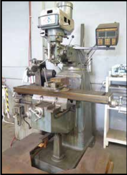
Amura Vertical Mill w/ Stor-King DRO