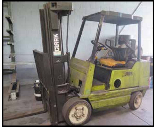
Clark GCS25MB 4500 Lb Cap LPG Forklift