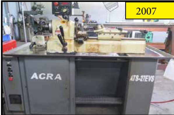
2007 Acra ATS-27EVS Narrow Bed Second OP Lathe