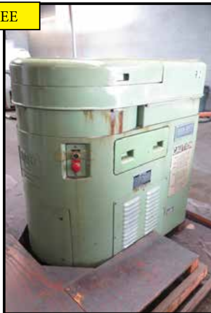
Reed-Rico A-22 3 3/4" Cap. 3-Die Cylindrical Thread Rolling Machine