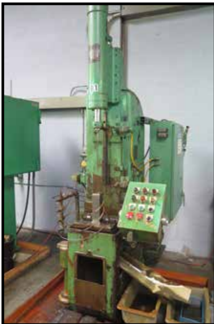
American Broach V-1 1/2-4 Hydraulic Vertical Broaching Machine