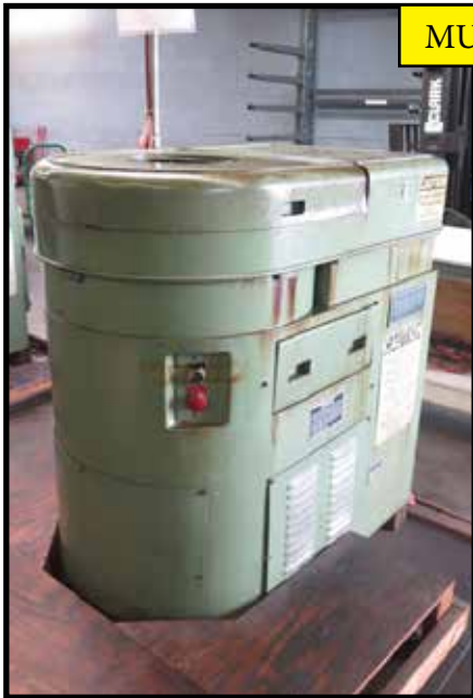
Reed-Rico A-22 3 3/4" Cap. 3-Die Cylindrical Thread Rolling Machine