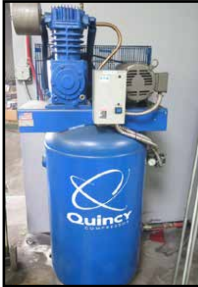
Quincy 7.5Hp Air Compressor