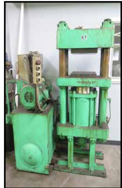
100 Ton Hydraulic 4-Post Press