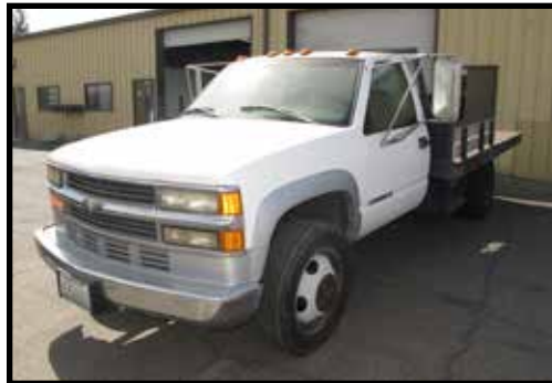
1996 CHEVY 3500 HD, 1 TON 10FT STAKE BED TRUCK, 119K MILES, GAS