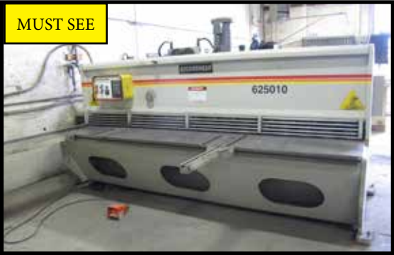
MUST SEE ACCURSHEAR MODEL 625010, 10FT X .25" HYD POWER SHEAR W/ CNC BACK GAGE.