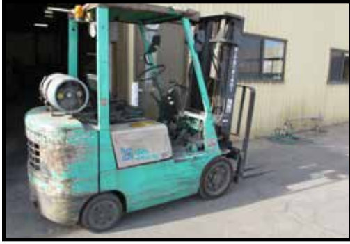
MITSUBISHI 5000 LB LPG FORKLIFT, 3 STAGE, SIDE SHIFT, 7500 METERED HOURS