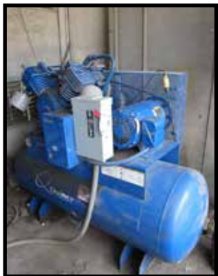
QUINCY QT-15, 15HP PISTON TYPE 2 STAGE AIR COMPRESSR.