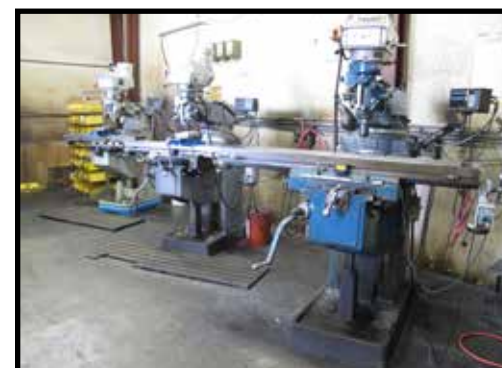
2) ATRUMP AND 1) ACRA VERTICAL MILLS, DROS, POWER FEED, VAR SPEED.