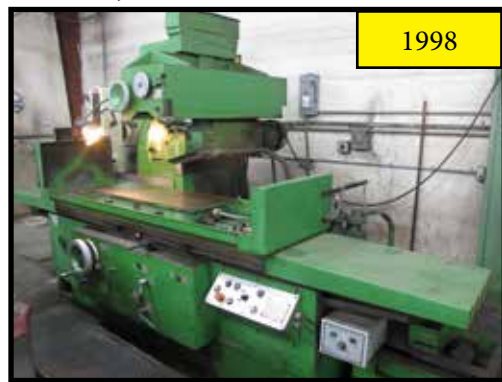
1998 1998 JOTES 16" X 40" MODEL SPD40 AUTOMATIC SURFACE GRINDER, W/ELECTROMAGNETIC CHUCK, S/N 212/1998.