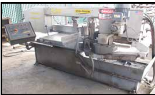
HYD MECH SERIES III, S-20M, HORIZONTAL BAND SAW, S/N 6A0906251.