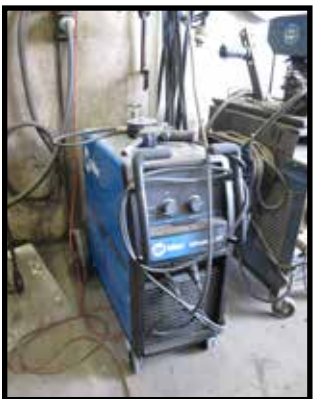
MILLER SYNCROWAVE 250DX TIG WELDER.

1996 CHEVY 3500 HD, 1 TON 10FT STAKE BED TRUCK, 119K MILES, GAS.