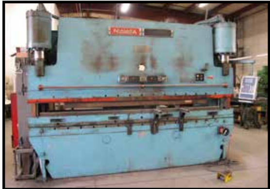
NIAGARA HBM-175-10-12, 12FT X 175 TON HYD PRESS BRAKE, W/ CYBELEC DNC 60 CONTROL, STROKE CONTROL, S/N 52275.