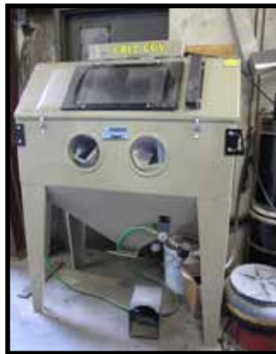
RIT GUY 24 X 36 SAND BLAST CABINET