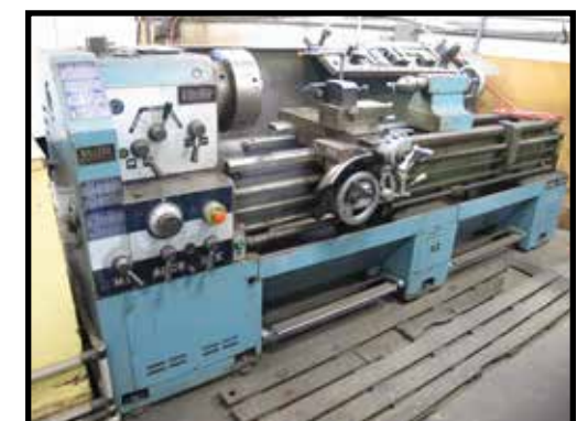
VICTOR 2080G, 20 X 80 ENGINE LATHE, W/ THREADING, 5 TO 1000 RPMs, S/N 710469