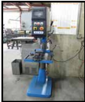
ACRA 2HP VARIABLE SPEED DRILL PRESS, MODEL MDP-435VA.