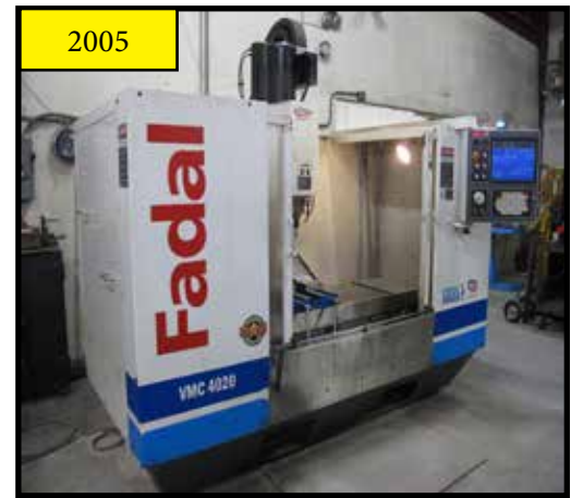
2005 2005 FADAL VMC 4020HT CNC VMC, 10,000 RPM, BT-40, 20 ATC, S/N 32005088062.