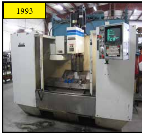
1993 1993 FADAL VMC 4020 CNC VMC, 20 ATC, FADAL CNC 88 CONTROL, S/N 9302061.