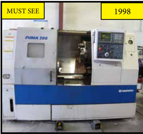
MUST SEE 1998 1998 DAEWOO PUMA 200 LCX CNC LATHE, FANUC 18-T CONTROL, 10" CHUCK, TAILSTOCK, 12 STATION TURRET, S/N PM200710.