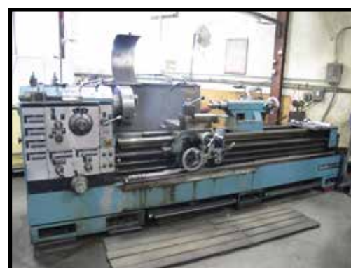
VICTOR 24100, 24" X 100" ENGINE LATHE, VARIOUS CHUCKS, THREADING, 29 TO 700 RPMs.