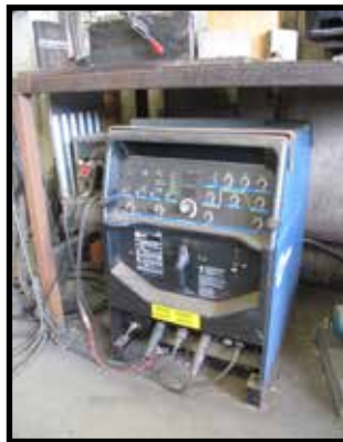
MILLERMATIC 252 MIG WELDER.