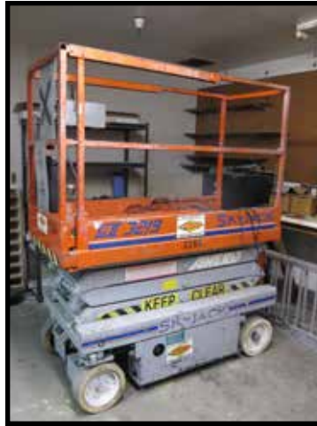
SKYJACK II MODEL 3219 ELECTRIC SCISSOR LIFT.