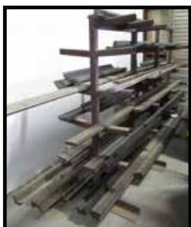
PRESS BRAKE TOOLING AND FORMING DIES.