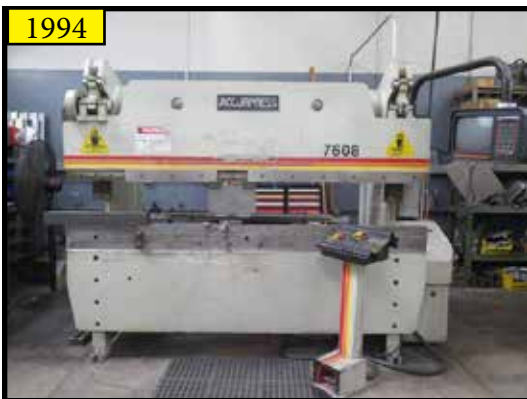
1994 Accurpress 7608 60 Ton x 8' CNC Press Brake w/ Accurpress CNC Gaging System