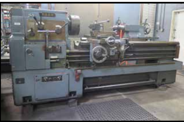
Webb 20 1/2 GX60 20" x 60" Gear-Gap Lathe

1996 Mori Seiki SL-25B5 CNC Turning Center s/n 7926 w/ Mori Seiki MSC-680 Controls, Tool Presetter, 12-Station Turret, Hydraulic Tailstock, 10" 3-Jaw Power Chuck, 5C Collet Nose, S26 Collet Pad Nose, Coolant, LNS Quick Load Automatic Bar Loader / Feeder.