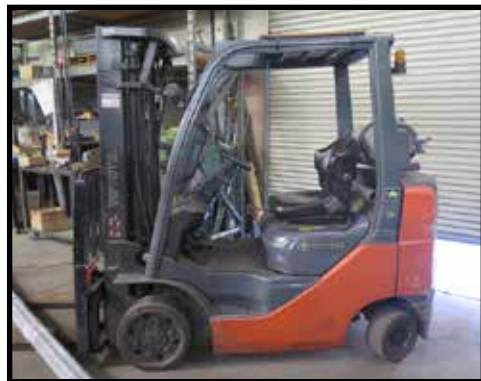
Toyota 8FGCU25 4500 Lb Cap LPG Forklift