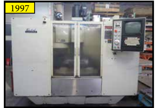
1997 Fadal VMC 3016HT CNC Vertical Machining Center w/ CNC88HS Controls, 21-ATC, CAT-40 Spindle