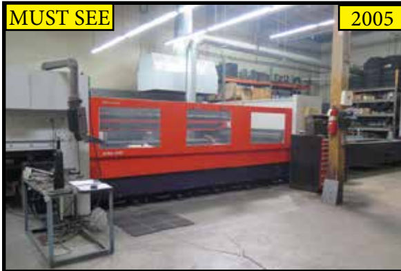
2005 Bystronic "ByStar 4020" CNC Laser Contour Machine w/ Bystronic Controls, "Bylaser 4400"