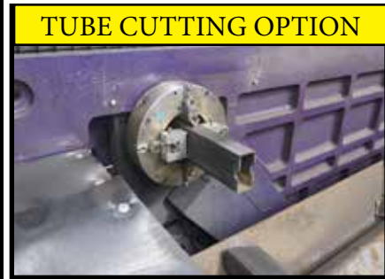
2005 Bystronic "ByStar 4020" CNC Laser Contour Machine w/ Bystronic Controls, "Bylaser 4400"