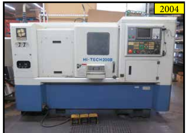
2004 Hwa Cheon Hi-TECH 200B CNC Live Turret Turning Center w/ Fanuc 0i-TB Controls