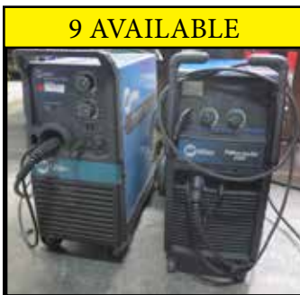
Miller Welders **9-AVAILABLE**