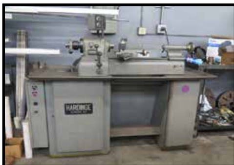
Hardinge DV-59 Narrow Bed Second OP Lathe