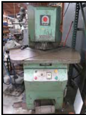
Amada CSH-220 8 3/4" x 8 3/4" Power Notcher