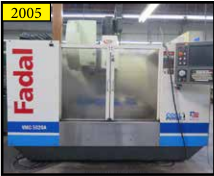
2005 Fadal VMC 5020A HA CNC Vertical Machining Center w/ Multi Processor CNC Controls, 24-Station Side-Mount ATC, CAT-40 Spindle, 10,000 RP