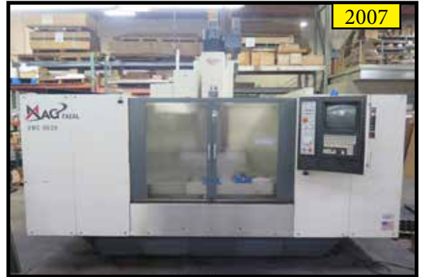
2007 Fadal MAG VMC 6030HT 4-Axis CNC Vertical Machining Center w/ CNC 32MP Controls, 21-Station ATC, CAT-40 Spindle, 10,000 RPM