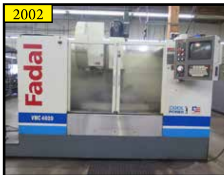
2002 Fadal VMC 4020HT CNC Vertical Machining Center w/ Multi Processor Controls, 24-Station Side-Mount ATC, CAT-40 Spindle, 10,000 RPM