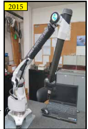
2015 Hexagon Metrology "Romer Absolute Arm" RA-7520-3 Portable CMM System w/ 2m/6.6' Measuring Range