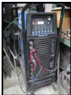
Miller Dynasty 350 Arc Welder