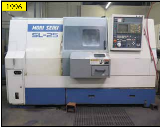
1996 Mori Seiki SL-25B5 CNC Turning Center w/ MSC-680 Controls