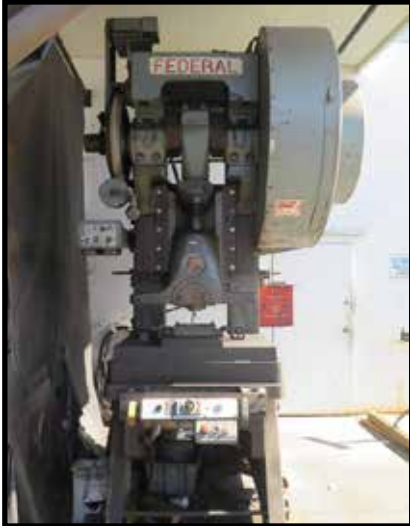
Federal 125 Ton OBI Stamping Press **Remanufactured July/1990**