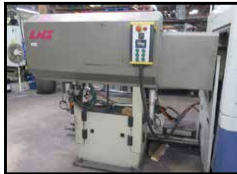
LNS Quick Load Automatic Bar Loader/Feeder