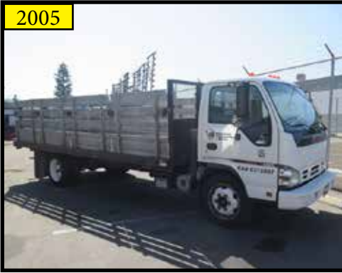
2005 GMC W4500 16' Stake Bed Truck w/ 6.0L Gas Engine, Auto Trans