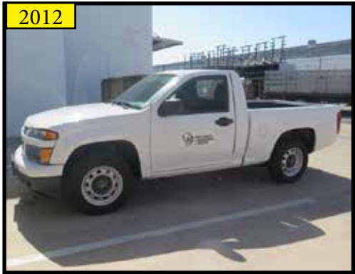
2012 Chevrolet Colorado Pickup Truck w/ 2.9L Gas Engine, Auto Trans