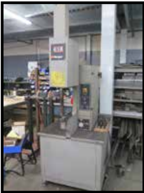
Haeger 618 6 Ton x 18" Hardware Insertion Press