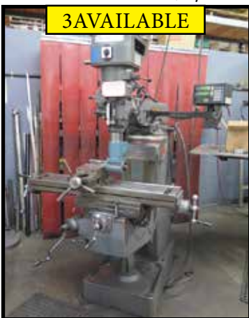
Lagun FT-2 Vertical Mills w/ DRO's