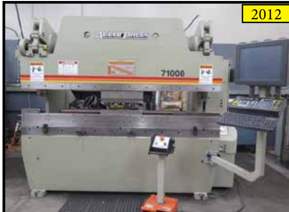
2012 Accurpress 71008 100 Ton x 8' CNC Press Brake w/ Accurpress ETS100 Controlled Gaging SYSTEM