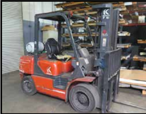
Kalmar P60BXH PS 5550 Lb Cap LPG Forklift