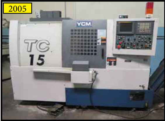
2005 YCM TC-15 CNC Turning Center w/ Yeong Chin Fancu TXP-100i Controls