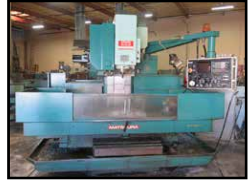
Matsura MC-1000V 4-Axis CNC Vertical Machining Center w/ Fanuc 6M Control