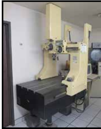
DEA OITA P mdl. P1270 CMM Machine