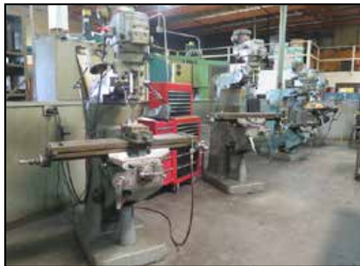
Bridgeport Vertical Mills