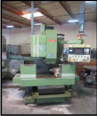
Victor V Center-4 CNC Vertical Machining Center w/ Fanuc 10M Controls