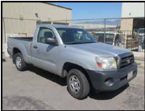
2005 Toyota Tacoma Pickup Truck w/ 2.7L VVT-I Gas Engine