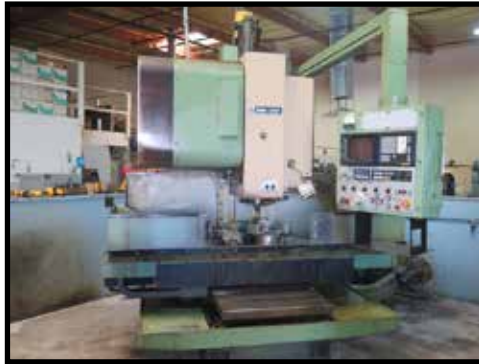
Mori Seiki MV-45/40 CNC Vertical Machining Center w/ Fanuc 11M Controls