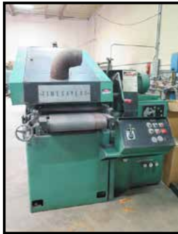
Timesavers TOP-18 18" Belt Grainer