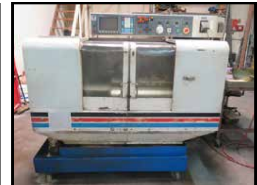
Wickman 26-130 CNC Cross Slide Lathe w/ Fanuc 0T Controls