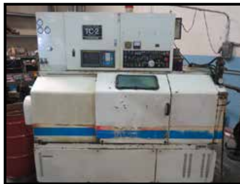
Takisawa TC-2 CNC Turning Center w/ Fanuc 0T Controls

Wickman 26-130 CNC Cross Slide Lathe s/n 28024 w/ GE Fanuc 0T Controls, Crawford Colleted Spindle, Part Chute, 7 3/4" x 30 1/4" Table, Ikura Seiki "Bartop" Automatic Bar Loader / Feeder.