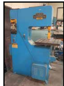
Kalamazoo Startrite 20RWS 20" Vertical Band Saw