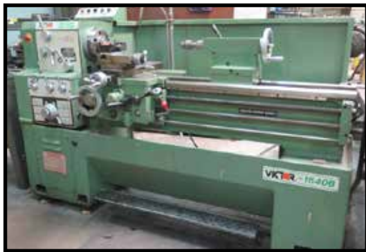
Victor 1640B 16" x 40" Gear-Gap Lathe