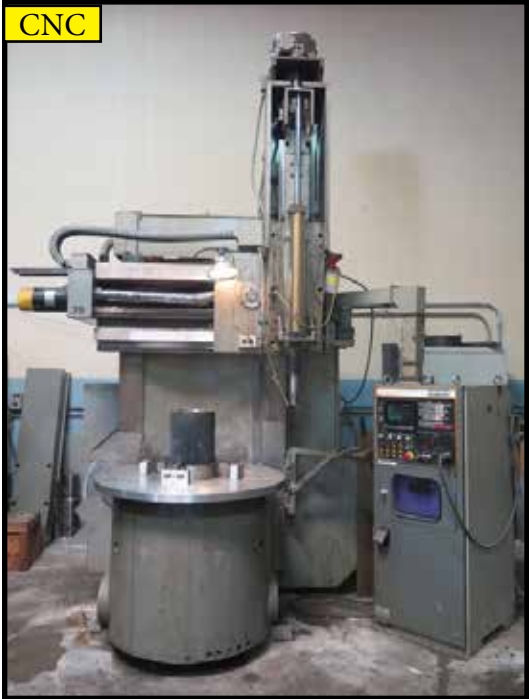
Bullard Retrofit CNC Vertical Boring Lathe w/ GN 6 Series CNC Controls