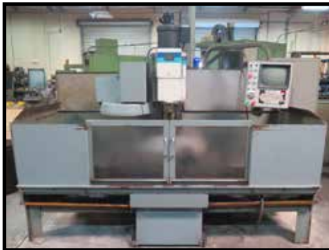
Fadal VMC4020 CNC Vertical Machining Center

Fadal VMC4020 mdl. 904-1 CNC Vertical Machining Center s/n 8604408 w/ Fadal CNC88 Controls, 21-Station ATC, CAT-40 Taper Spindle, 10,000 RPM, 20" x 48" Table, Coolant.