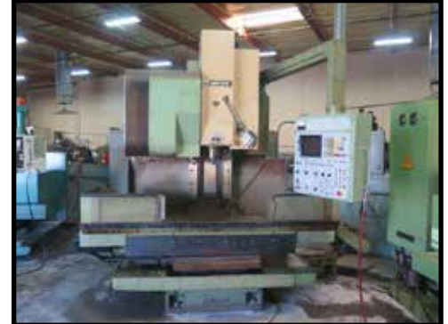
Mori Seiki MV-40 CNC Vertical Machining Center w/ Fanuc 6M Controls