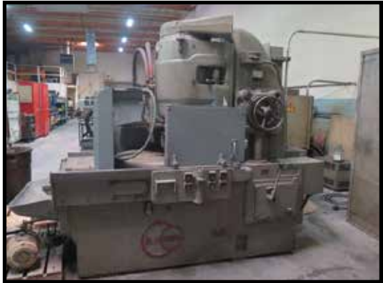
Blanchard No. 18 36" Blanchard Rotary Grinder