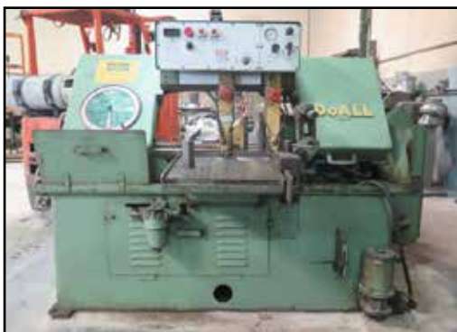
DoAll C-1213M 13" Horizontal Band Saw