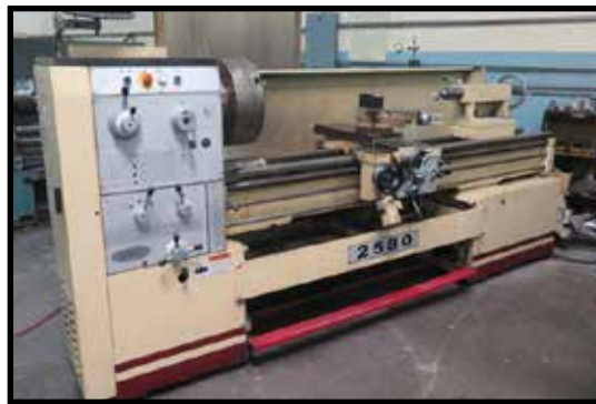
GMC 2580 25" x 80" Gear-Gap Lathe w/ Sino SDS6-2V Programmable DRO