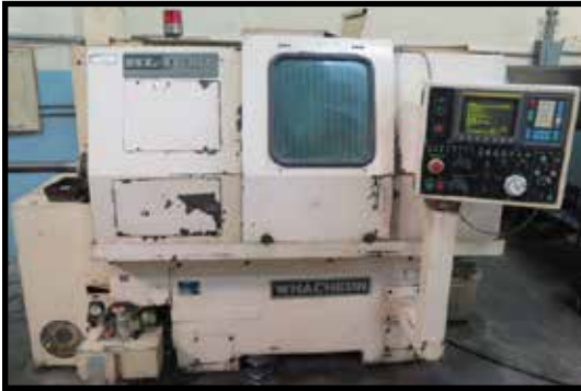
Turning Center w/ Fanuc OT Controls