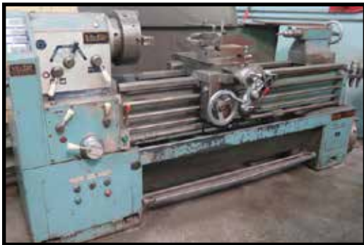
Victor 2060 20" x 60" Gear-Gap Lathe