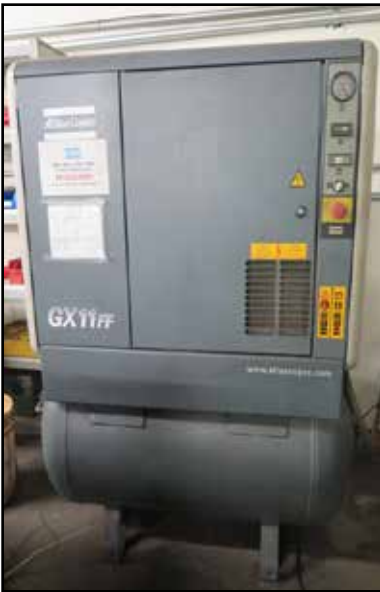
2004 Atlas Copco GX11FF 15Hp Rotary Air Compressor