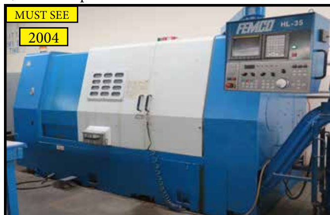
2004 Femco HL-35 CNC Turning Center w/ Fanuc 0i-TB Controls