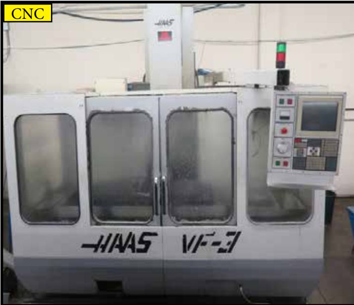
1994 Haas VF-3 4-Axis CNC Vertical Machining Center w/ 20-ATC, CAT-40 Spindle