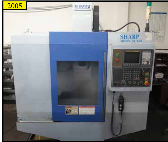
2005 Sharp SV-2412 CNC Vertical Machining Center w/ Fanuc 0i Mate-MB Controls