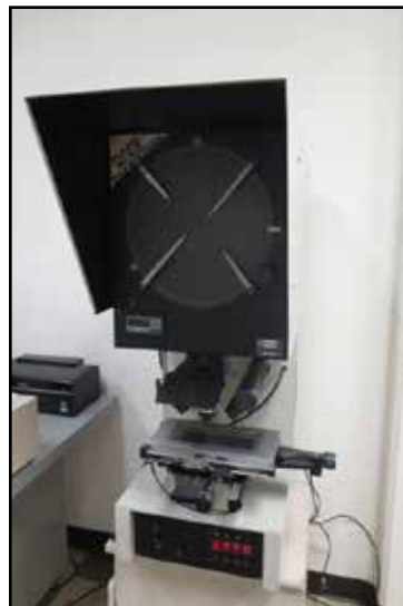
Gage Master mdl. 49/GMX4 12" Optical Comparator