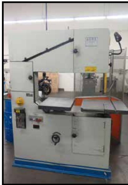
2004 Acra KV-100 40" Vertical Band Saw