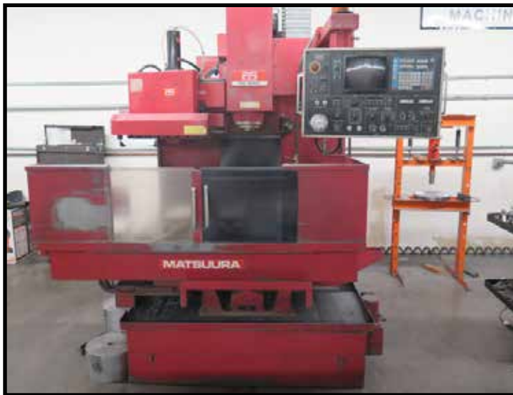
Matsuura MC-500V CNC Vertical Machining Center w/ Yasnac Controls, 20-ATC, BT-35 Spindle