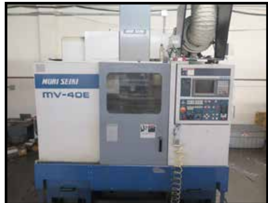
Mori Seiki MV-40E CNC Vertical Machining Center w/ Fanuc Controls, 20-ATC, CAT-40