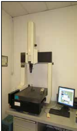
Brown & Sharpe Micro Val CMM Machine