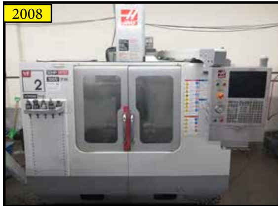
2008 Haas VF-2DYY CNC Vertical Machining Center w/ 20-ATC, CAT-40 Spindle