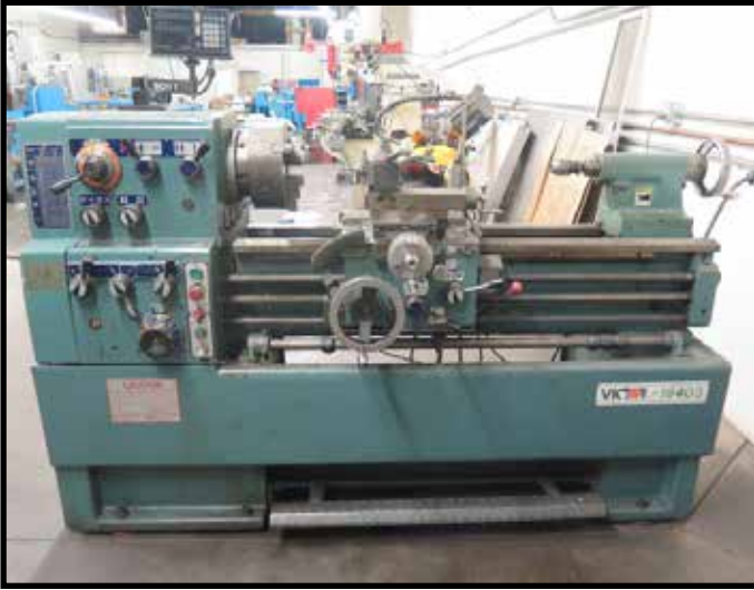
Victor 1640S 16" x 40" Gear-Gap Lathe w/ Sony LH52 DRO