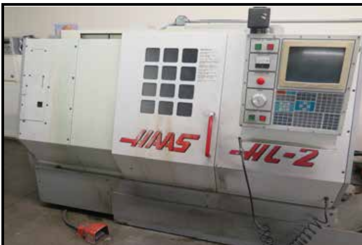
1996 Haas HL-2 CNC Turning Center w/ Haas Controls