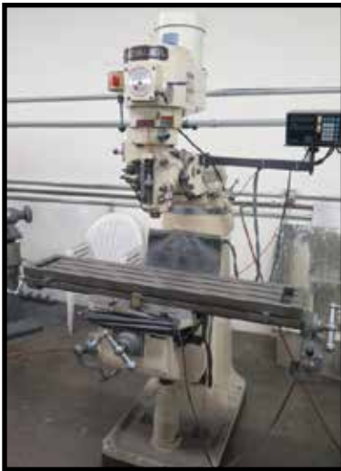
Acra WS-18VH Vertical Mill w/ Sargon DRO