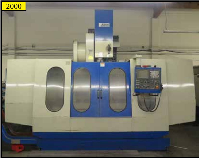
2000 Johnford VMC-1600SHD CNC Vertical Machining Center w/ Fanuc 18-M Controls, 32-ATC, CAT-50 Spindle