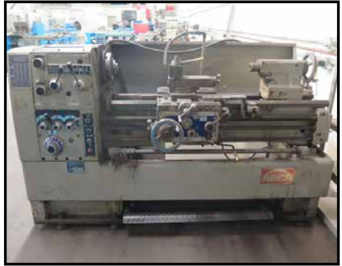
1995 Arch 13" x 46" Geared Head Gap Bed Lathe