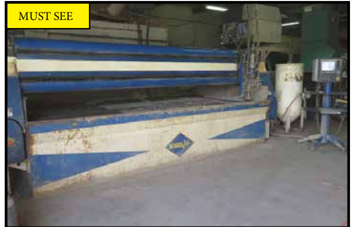
Ward Jet Z-613 CNC Waterjet Contour Machine w/ Burny-Phantom ST Controls