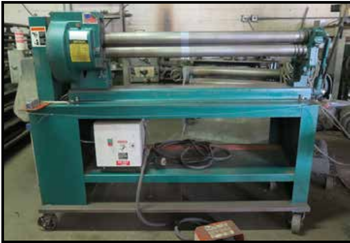
Tennsmith 16GA x 48" Power Roll