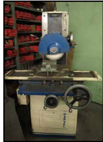
Harvel 6" x 12" Surface Grinder