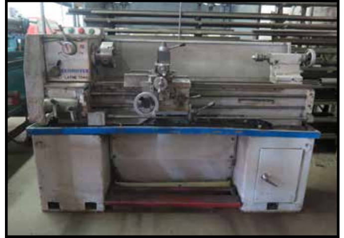
Econotek mdl. 1340 13" x 40" Gear-Gap Lathe