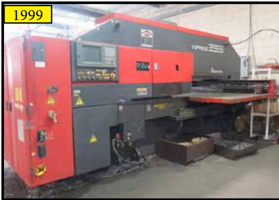
1999 Amada VIPROS 255 20-Ton 31-Station CNC Turret Punch Press w/ Fanuc 18-P Controls