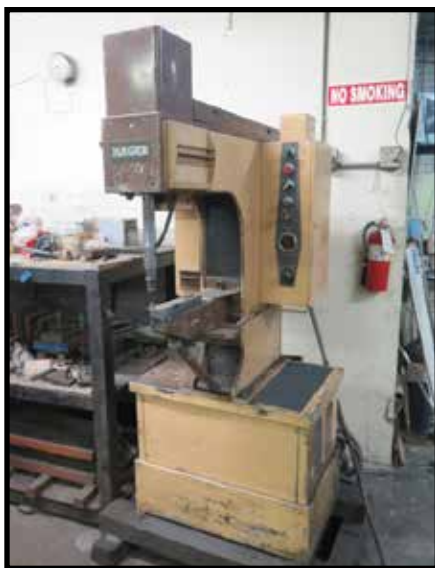
Haeger 6-Ton x 18" Hardware Insertion Press