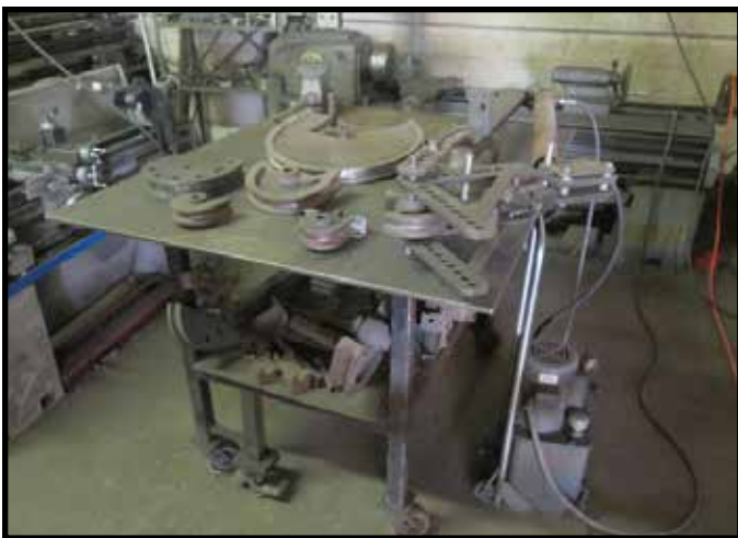
Hydraulic Universal Tube Bender