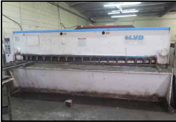
990 LVD JS/25/10 ¼" x 10' Hydraulic Power Shear w/ Comptrol Digital Controls