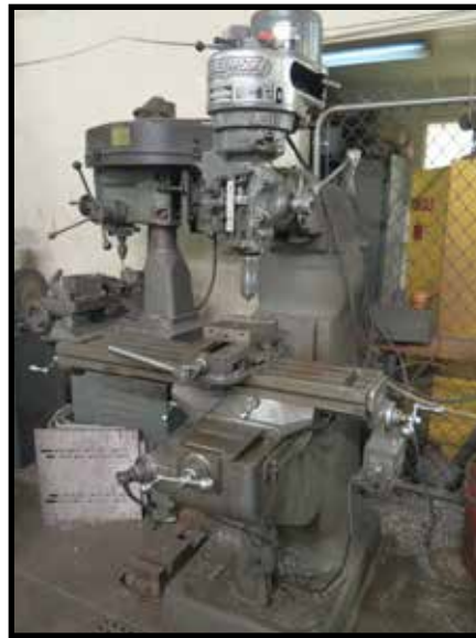
Bridgeport Vertical Mill