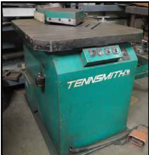
Tennsmith PN-9 9.5" x 9.5" Power Notcher