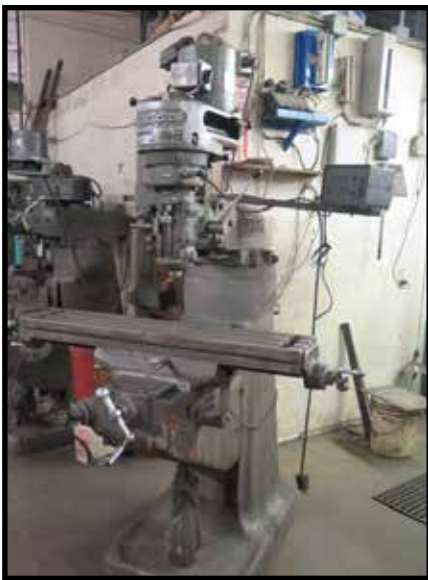
Hartford Vertical Mill