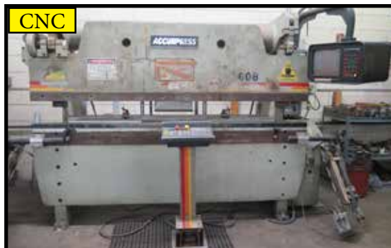
1995 Accurpress 7608 60 Ton x 8' CNC Hydraulic Press Brake