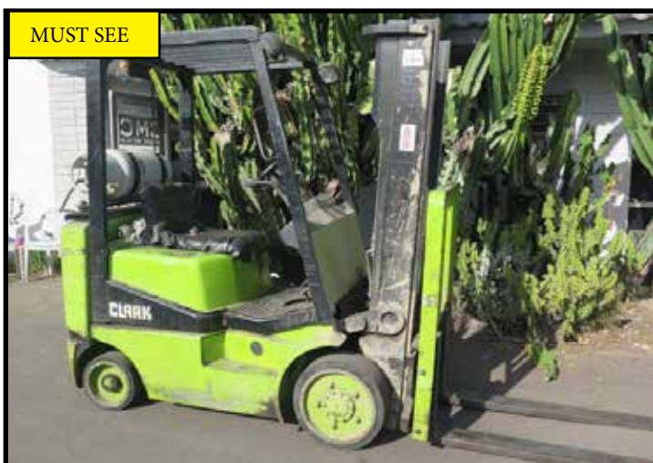
Clark CGC20 3300 Lb Cap LPG Forklift