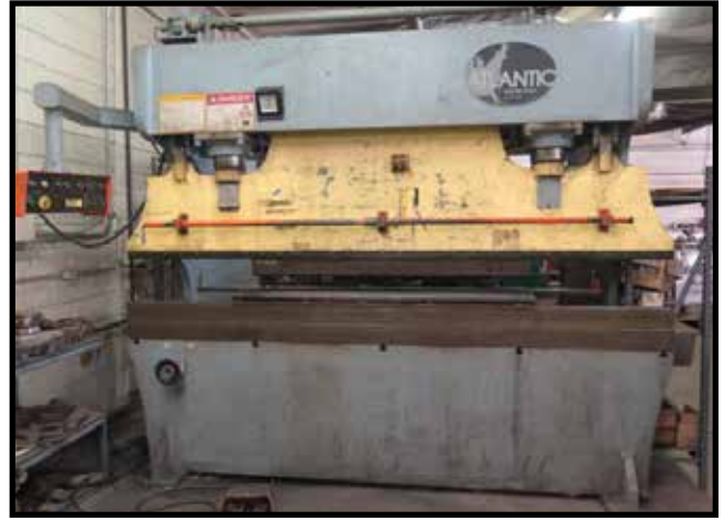
Atlantic HD200-10 200 Ton x 10' Cap Hydraulic Press Brake