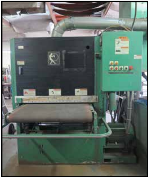
Timesavers mdl. 137-1HFM/75 36" Belt Grainer