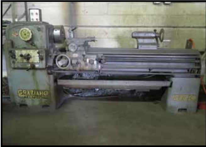
Graziano Tortona SAG-14 14" x 60" Geared Head Lathe