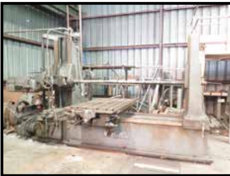
Lucas "No. 42 Precision" Horizontal Boring Mill