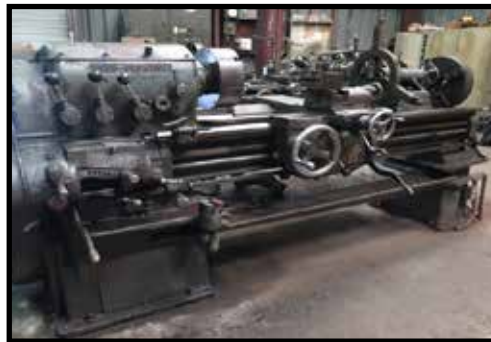
Reed-Prentice 16" x 58" Sliding Gear Lathe