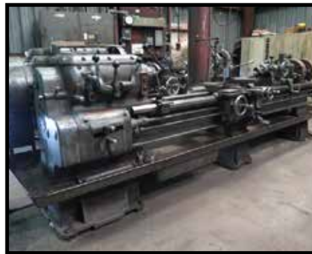
Axelson "16" 16" x 102" Geared Head Lathe