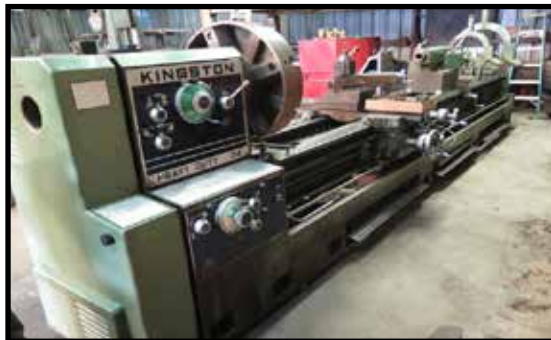
Kingston HR4000 35" x 157 1/2" Geared Head Gap Bed Lathe