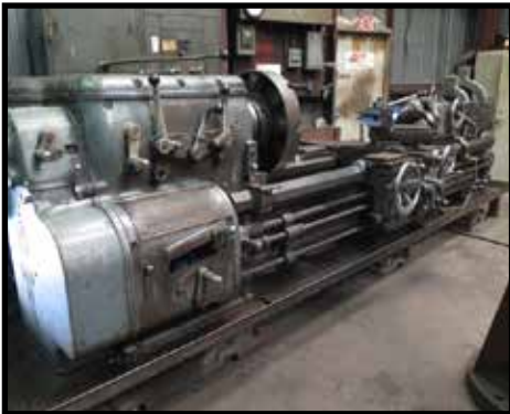
Axelson "25" 25" x 95" Geared Head Lath

Lucas "No. 42 Precision" Horizontal Boring Mill s/n 42-26- 4 w/ 9-255 RPM, 4" Spindle, 40" x 60" Table, Arbor Support, 93" x 3" Boring Arbor.