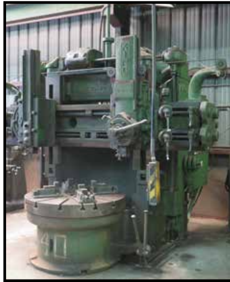
King 52" Vertical Turret Lathe w/ 64" Max Swing