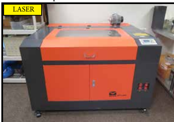
LASER Jinan Morn mdl. MT-L960 Laser Engraving and Cutting Machine