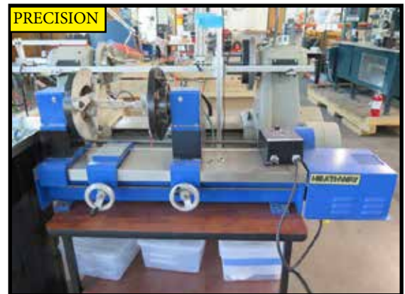
PRECISION Heathway 16" x 24" Glass Lathe w/ Variable Speed Drive and Acces