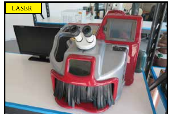
LASER Neutec "Studio Plus 100 & Microscopic Laser Welding System