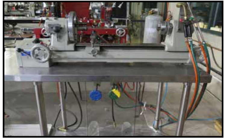
Litton mdl. F-U 8" x 16" Glass Lathe w/ Variable Speed Drive and Acces