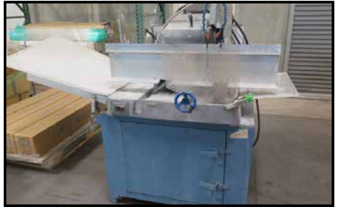
Wale Heathway mdl. "16" TILT Head" Glass Cutting Machine