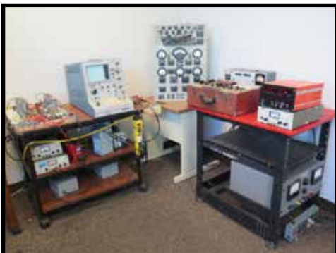
Electronic Test Equipment