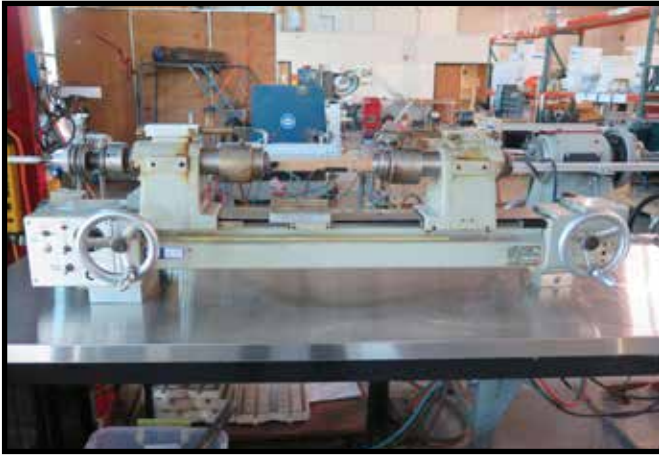
2000 Litton mdl. F053 8" x 12" Glass Lathe w/ 5C Colleted Head s