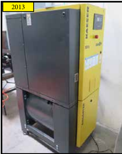
2013 Kaesar Air-Center SX-5 5Hp Rotary Air Compressor Combo

Electronic Components, Test Leads and Hardwar