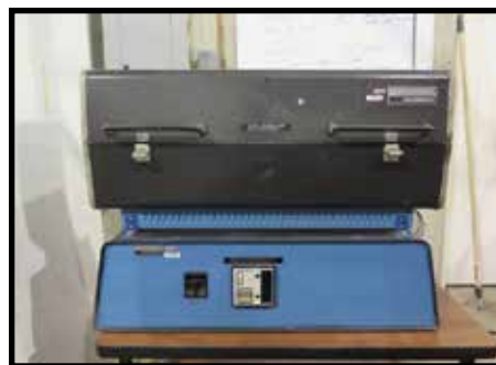
Lindberg Benchtop Laboratory Tube Furnace