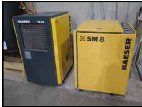
Kaesar SM8 7.5Hp Rotary Air Compressor