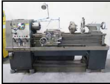
Concord mdl. 1550 15" x 50" Geared Head Gap Bed Lathe