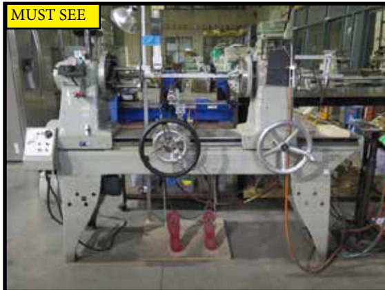
MUST SEE 1993 Litton mdl. EE125 Glass Lathe w/ Variable Speed Drive and Acces