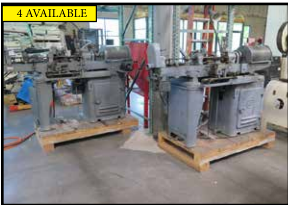
RCA mdl. 705Y Universal Grid Winding Machines ***4-AVAILABLE***