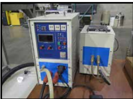
2012 Across International mdl. IH15AB 7kW Induction System w/ Digital Controls

Clearaudio "Maximum Solution" Turntable w/ Master TQI Tangent Tone Arm (NO STYLUS). Graff GM20 OTL, PrimaLuna ProLogue One and THD PicoValve Amplifiers. ART "Tube MP Studio" Tube Microphone Preamplifier. AMC mdl. MD5401 Bitstream DAC and Misc Guitar Effects. Fender "Pro-Junior" Amplifier and Champ Guitar Amplifier. Jolida mdl. JD 301RC Integrated Amplifier and Speakers. Greta MDF Guitar Amplifier. D & A Speaker System and Opera Platea Speaker System w/ Cords.