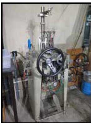
Du-Gil Glass Tube Drop Sealer w/ Vacuum Pump