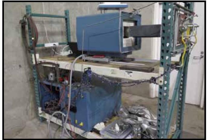
Lindberg Benchtop Laboratory Tube Furnace