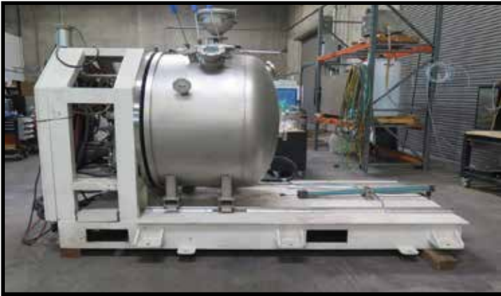
Vacuum Chamber w/ 50" Dia. x 36" Stainless Steel Chamber