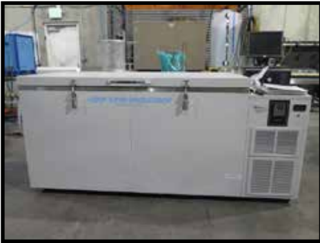
300 Below Inc. & Cryogenic Tempering -300 Deg F Cryo-Processor