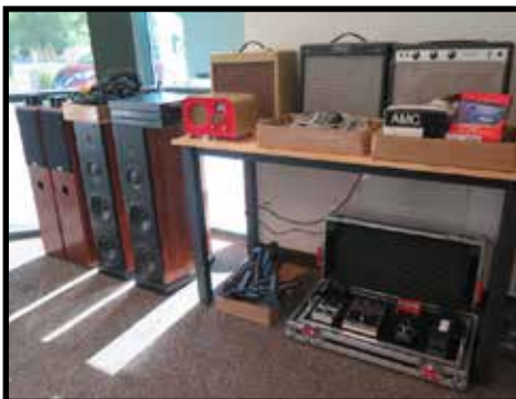
Guitar Amplifiers and Effects