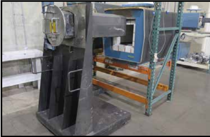
Lindberg Type 51668-R 1200 Deg C Environmental Furnaces