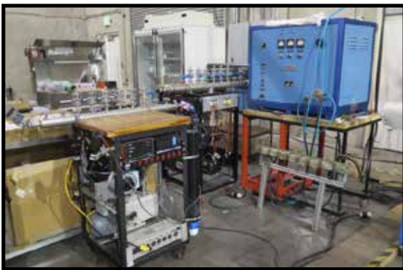
Turbotronik Turbo Pump Systems w/ 10-Station Manifolds