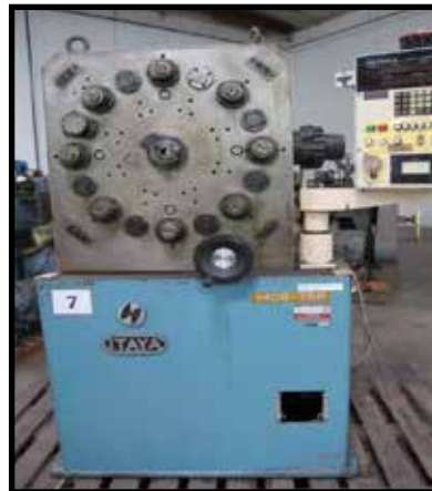
ITAYA MCS-15D CNC Coiling Machine w/ MVS System II Controls