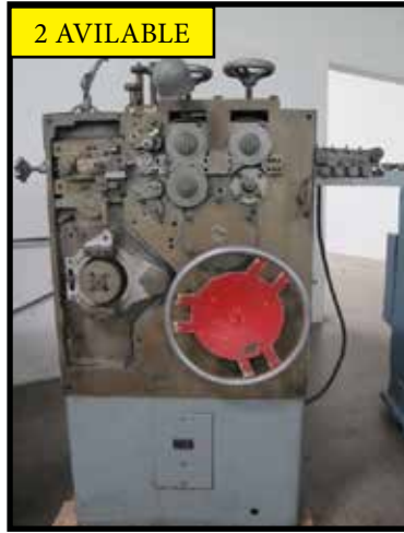
Torrington mdl. W12-A Precision Coil Spring Winder ***2-AVAILABLE***