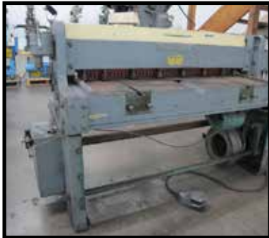
Wysong mdl. 1452 14GA x 52" Power Shear