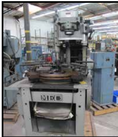
MEC Matsuoka Engineering mdl. VRA-20 5-Slide Ring Coiling Machine