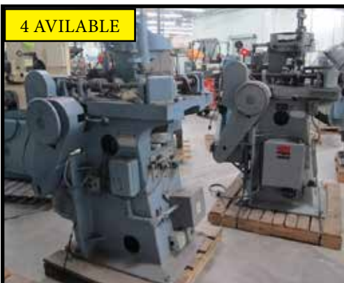
Torrington mdl. W-3001 Torsion Spring Winder w/ 22-120 Springs/Min, Wire Cap .080 for 10 Turn Gears, .062 for 24 Turn Gears, .047 for 47 Turn Gears ***4-AVAILABLE***