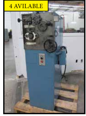
Torrington mdl. W10-A Precision Coil Spring Winder w/ 0.008"-0.028" Wire Cap, 1/16"-7/8" Coil OD Range ***4-AVAILABLE***