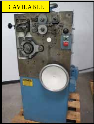
Torrington mdl. W11-A Precision Coil Spring Winder w/ 0.015"-0.072" Wire Cap, 0.093"-1.562" Coil OD Range ***3-AVAILABLE***