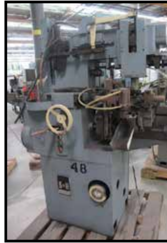
Sleeper & Hartley Torsion Spring Winder