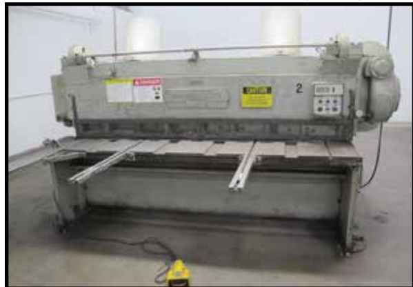
Cincinnati 18 mdl. 1808 ¼" x 8' Deep Throat Power Shear w/ Controlled Back Gaging