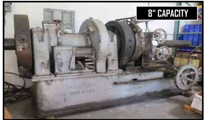
Landis Type 8 8" Pipe Threader w/ 8.3-23.5 RPM, (2) 33" 3-Jaw Chucks

CNC Mills and Lathes : (2) 2010 Mighty Viper VT-25B CNC Turning Centers s/n's 4331011012, 4331011011 w/ Fanuc Series 0i-TD Controls, 12-Station Turret, Hydraulic Tailstock, 10" 3-Jaw Power Chuck, Chip Conveyor, Coolant. 2006 Leadwell T-5 CNC Cross Slide Lathe s/n L2TJE0575 w/ Fanuc Series 0i Mate-TC Controls, 5C Collet Nose, 7 ½" x 15" Cross Slide Tooling Table, Coolant. 2001 Takisawa EX-106 CNC Cross Slide Lathe s/n CB08E60284 w/ Fanuc Series 21i-T Controls, 5C Collet Nose, 6 ½" x 17 ¾" Cross Slide Tooling Table, Coolant. 2001 Clausing Metosa SM1560VS 15" x 60" "Smart Lathe" Soft CNC Gap Bed Lathe s/n 42299 w/ GE Fanuc Quick Panel PLC Controls, 5C Collet Nose, Tailstock, Phase II Tool Post, Coolant. Hardinge Cobra 42 CNC Turning Center s/n C-515 w/ Fanuc Series 21-T Controls.