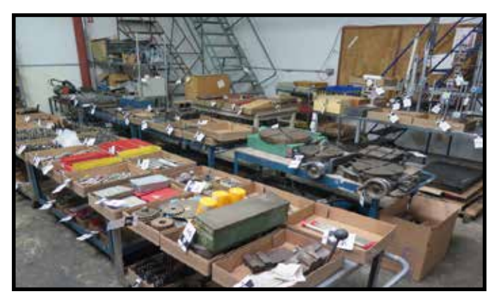
Large Quantity of Tooling and Inspection Equipment