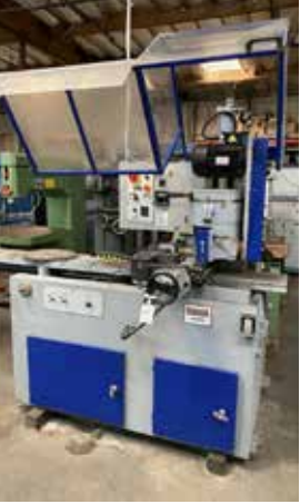
DAKE Automatic Cold Saw Model OMP EUROMATIC 370 PPL 14.5'