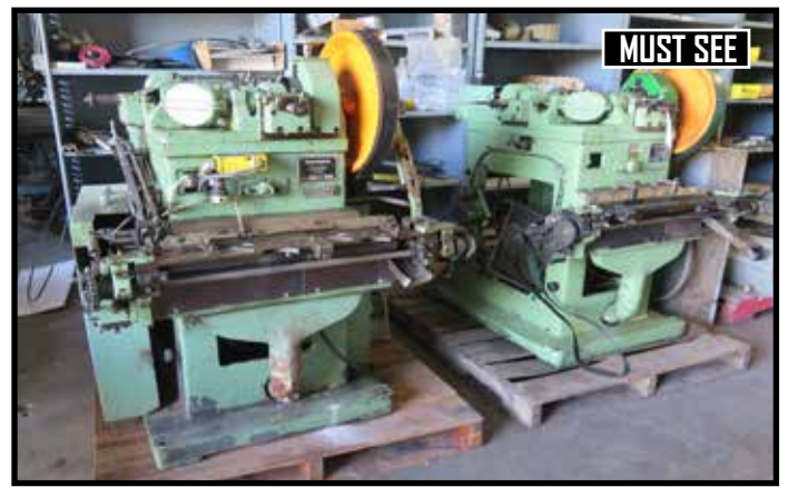
Buendgens type US and US-2 Nail and Brad Formers