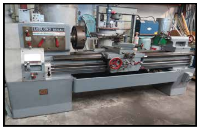
LeBlond Regal 19" x 56" Geared Head Lathe