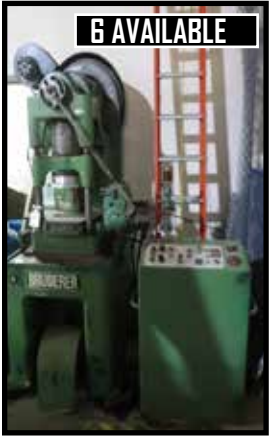
Bruderer BSTA-30 33-Ton High Speed Stamping Presse w/100-600 Hits/Min