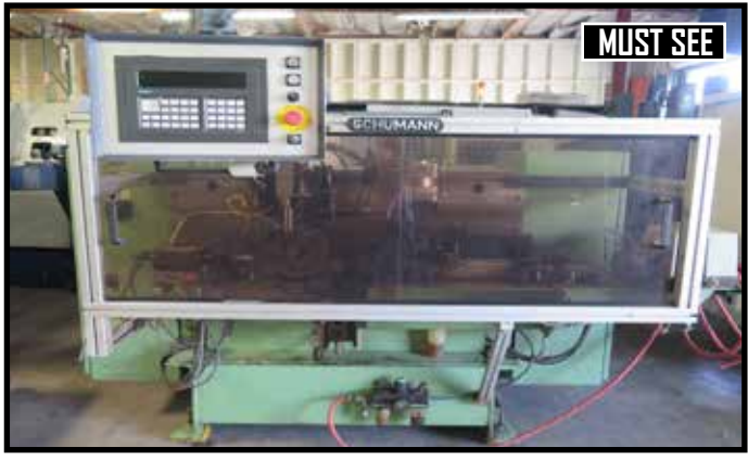
Heinrich Schumann, Lubeck Type 4010 CNC Coil Winder s/n 4010-037w/ Siemens Controls