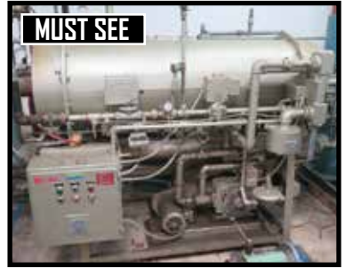
Lindberg Type 16-5000-HYEX LEAN 5000 CFH Exothermic Gas Generator