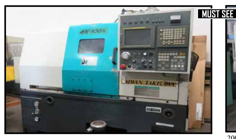
2001 Takisawa EX-106 CNC Cross Slide Lathe w/ Fanuc 21i-T Controls