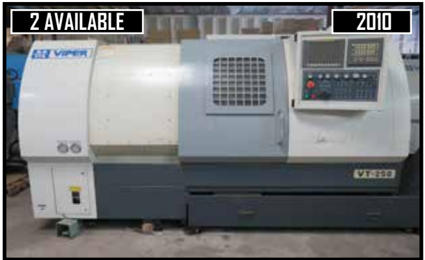
2010 Mighty Viper VT-25B CNC Turning Centers w/ Fanuc 0i-TD Controls, 12-Station Turret

2019 Akyapak (NEW) AHS 30-13 10' Hydraulic 4-Roller Plate Roll w/ Akyapak Touch Screen Controls