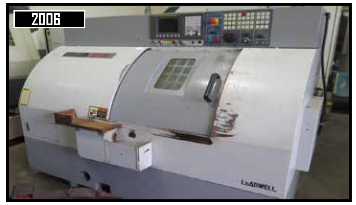
2006 Leadwell T-5 CNC Cross Slide Lathe w/ Fanuc 0i Mate-TC Controls