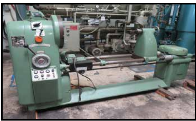
Heinrich Schumann, Lubeck Coil Winder s/n 230120 w/ 29 1/2" x 39 ½" Cap, 10-670 RPM