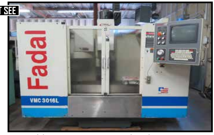
2000 Fadal VMC 3016L CNC Vertical Machining Center w/ Fadal Mulitprocessor Controls, 21-ATC, CAT-40