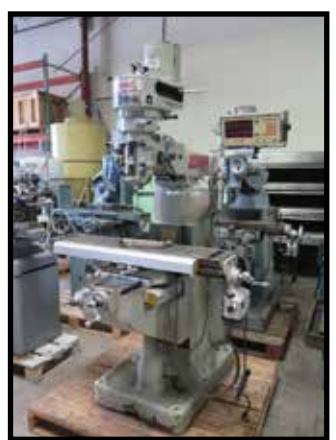
Comet Vertical Mill w/ Quality-800 DRO, Power Feed