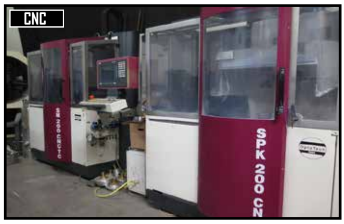
1999 OptoTech GmbH SM200 CNC TC-D and SPK200 CNC-D CNC Lens Grinding and Polishing Machines w/ Siemens Sinumerik Controls