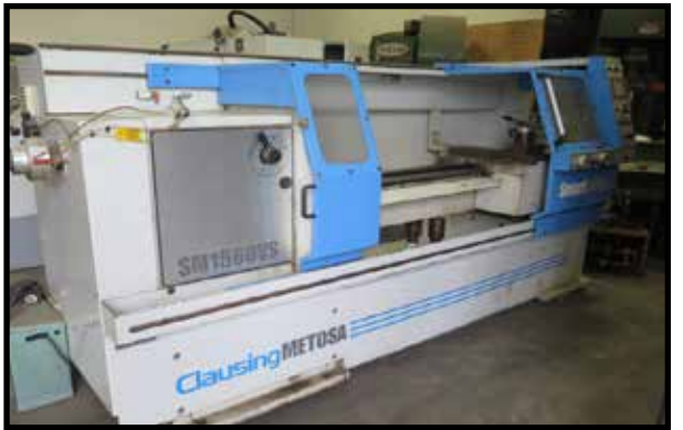
2001Clausing Metosa SM1560VS 15" x 60" "Smart Lathe" Soft CNC Gap Bed lathe s/n 42299 w/ GE Fanuc Quick Panel PLC Controls, 5C Collet Nose, Tailstock, Phase II Tool Post, Coolant.