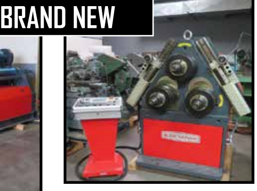
2019 Akyapak (NEW) mdl. APK101 4" x 4" Angle Roll w/ Akyapak Digital Controls, Hydraulic Support and Guide Rollers