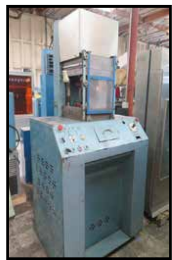
Ferrara HY50-4P-DS Hvdraulic Coining Press