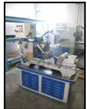
IMC Industrial Machinery Corp mdl. 2015 Power Pipe Threader s/n 4323 w/ 60-90 RPM, 2-Speeds, 9" Threading Head, 1.5" Cap.