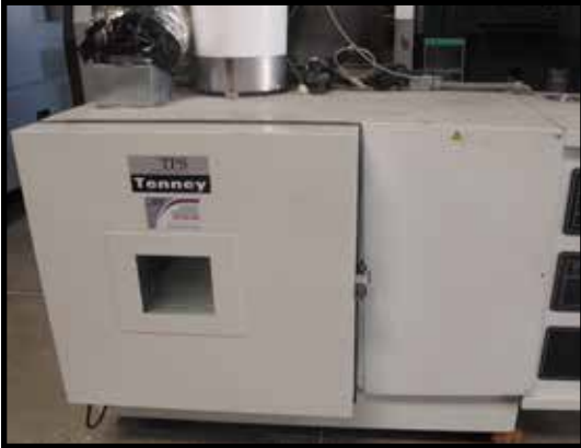
TPS Tenney mdl. BTRC -70 Deg C to 200 Deg C Thermal Chamber 0801000056 w/ TenneyVersaTenn II Digital Controls, Chart Recorder.