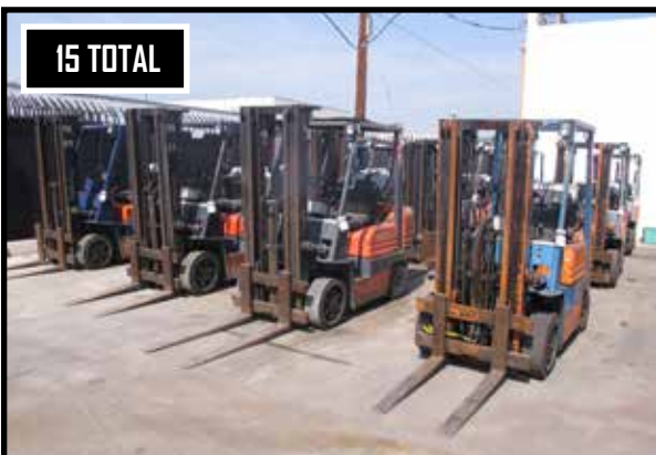
(15) Toyota 5FGC25 & 6FGCU25 5000 Lb Cap LPG Forklifts w/ 3-Stage Mast, Cushion Tires.