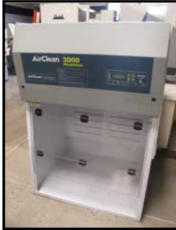
Air Clean Systems "AirClean 3000" Bench Model Flow Hood s/n AC3000-558 w/ Airsafe Digital Controls.