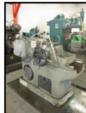
Landis Power Pipe Threader w/ 11" Threading Head, 2 1/2" Thru Head.