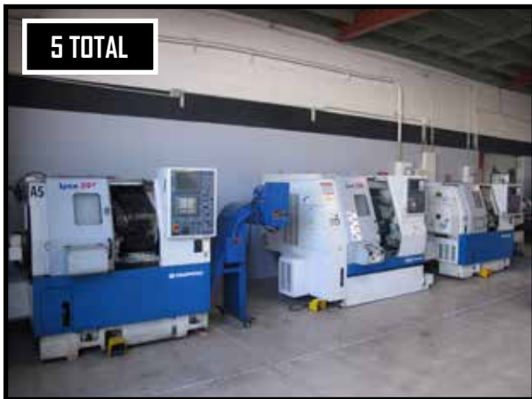
(5) Daewoo/Doosan CNC Turning Centers.

MAJOR FORKLIFT / CNC MACHINE TOOL AUCTION