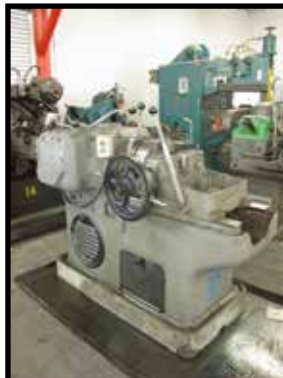
Landis Power Pipe Threader w/ 11" Threading Head, 2 1/2" Thru Head.