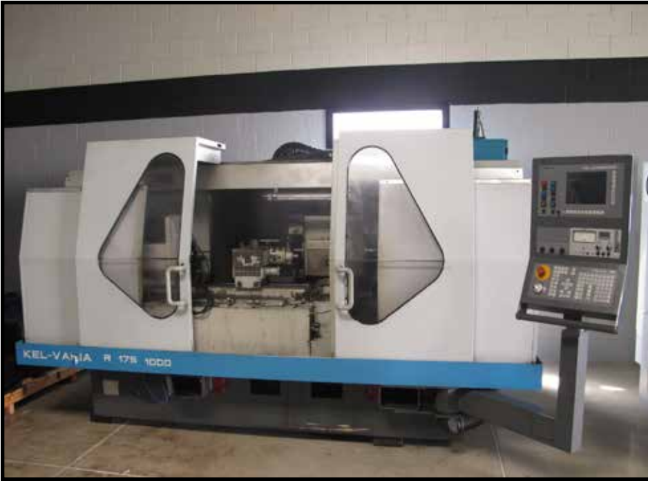
Kellenberger "Kel-Varia R175/1000" CNC Cylindrical Grinder s/n 650296 w/ Kelco 90 CNC Controls, 1000mm (39.4") Between Centers, Auto Sizer Head, 10 Deg Tilt Table, Coolant.