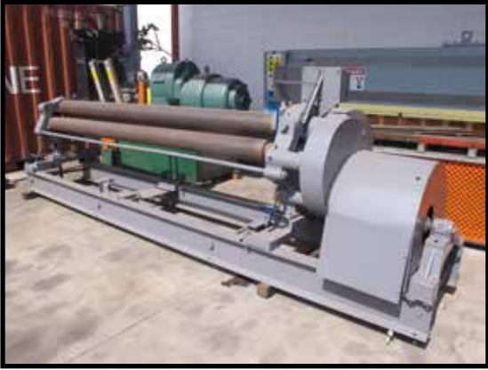
Handley 10' x 10 Gage Initial Pinch Power Roll w/ 10Hp Motor, 7" Top Roll, 6" Lower Rolls.