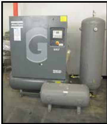
2010 Atlas Copco GA7P 7.5Hp Rotary Air Compressor s/n CA1703140 w/ 80 Gallon Tank.