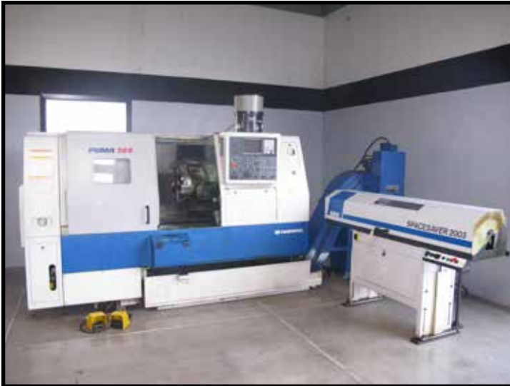
Daewoo Lynx 200 CNC Turning Center s/n 201237 w/ Fanuc Series 21-T Controls, Tool Presetter, 12-Station Turret, Hydraulic Tailstock, Parts Catcher, S26 Collet Pad Nose, Coolant, SMC Spacesaver 2003 Automatic Bar Loader / Feeder.