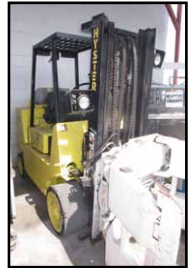
Hyster 12,000 lb lpg Forklift with Hyd Clamping Attachment.