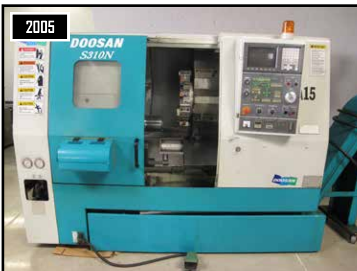
2005 Doosan S310N CNC Turning Center s/n LSA-1207 w/ Fanuc Controls, Tool Presetter, 12-Station Turret, Hydraulic Tailstock, Parts Catcher, Collet Pad Nose, Turbo Chip Conveyor, Coolant, SMW Spacesaver Automatic Bar Loader / Feeder.