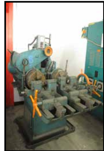
Landis 3-Head Power Pipe Threader w/ 9" threading Heads, 2" Thru Head.