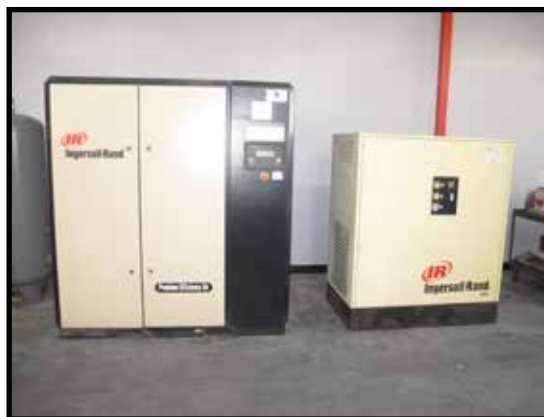
2003 Ingersoll Rand TMS0540 Refrigerated Air Dryer s/n TMS0540-0307/1354.