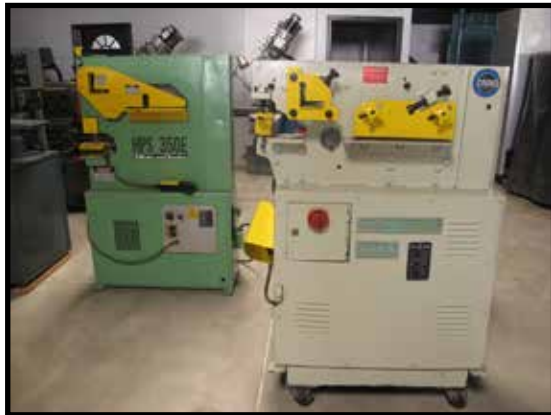
Geka Microcrop-36 36 Ton Ironworker s/n 016 w/ 11/16" Thru 3/8" Punch Cap, 8" x 1/2" to 14" x 1/4" Flat Shear Cap, 3" x 3" x 5/16" Angle Shear Cap.