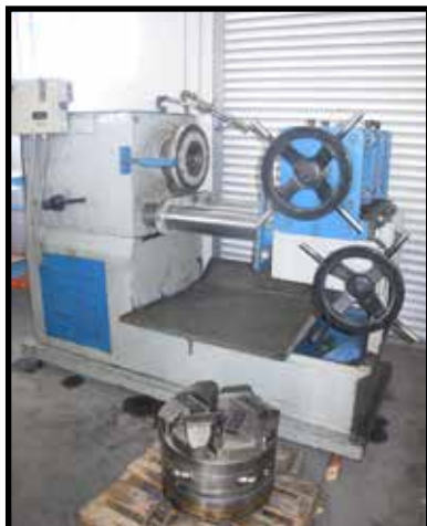
6" Power Pipe Threader w/ 16" Threading Heed 7" Thru Head.