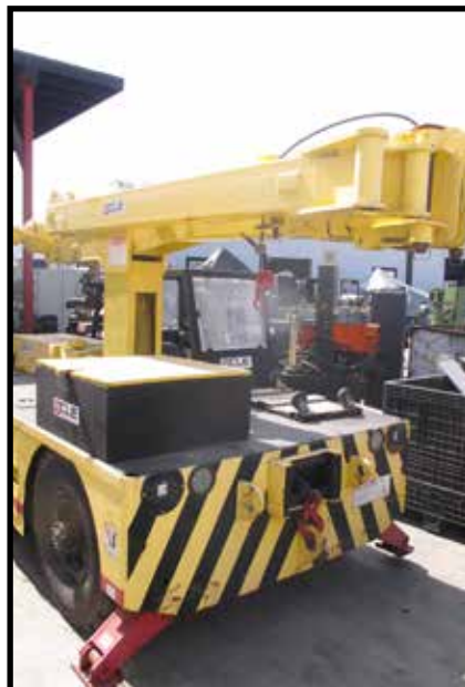
Portable LPG Crane.