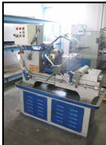
IMC Industrial Machinery Corp mdl. 2015 Power Pipe Threader s/n 4323