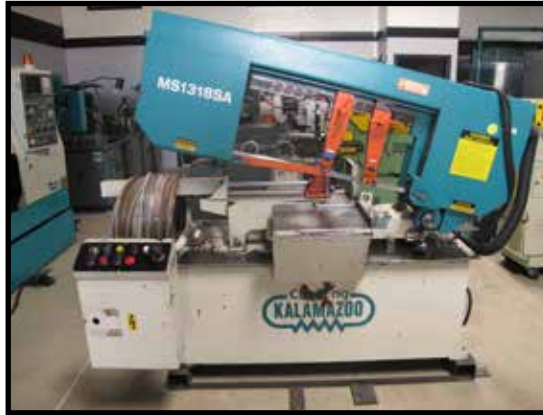
Kalamazoo MS1318SA 13" Horizontal Miter Band Saw w/ Hydraulic Clamping and Down Feed, Coolant.