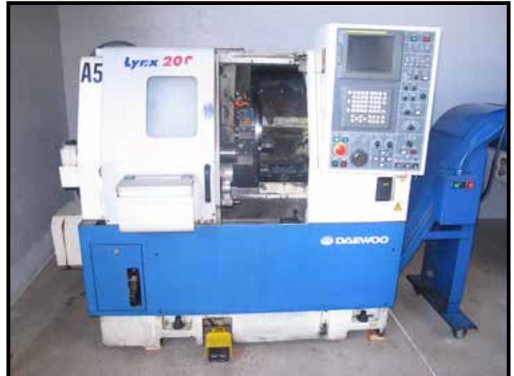
2000 Daewoo Lynx200B CNC Turning Center s/n L2001590 w/ Fanuc Series 21i-T Controls, Tool Presetter, 12-Station Turret, Parts Catcher, S16 Collet Pad Nose, Turbo Chip Conveyor, Coolant.