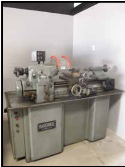
Hardinge HLV-H Wide Bed Tool Room Lathe w/ 125-3000 RPM, Inch Threading, Tailstock, Power Feeds, 5C Collet Closer, KDK Tool Post, Coolant.