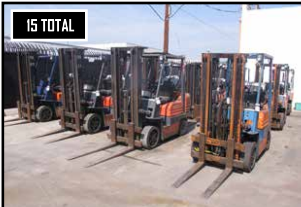
(15) Toyota 5FGC25 & 6FGCU25 5000 Lb Cap LPG Forklifts w/ 3-Stage Mast, Cushion Tires.