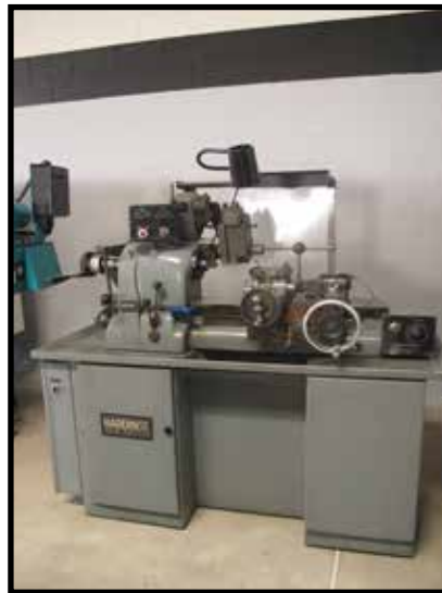
Hardinge HC Hand Chucker s/n HC-6527-T w/ Threading Attachment, 125-3000 RPM, 8-Station Turret, Power Feeds, 5C Collet Closer, Coolant.