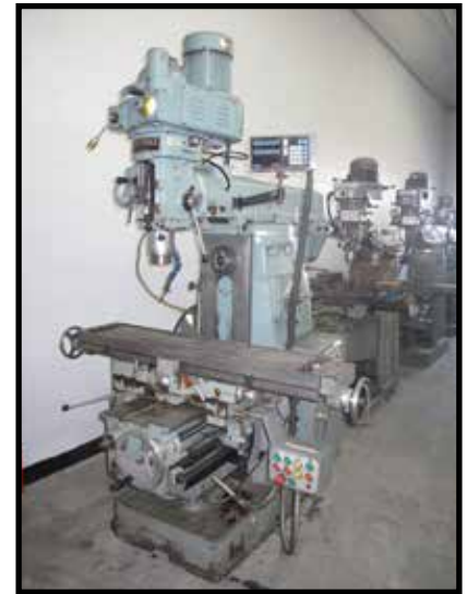
Supermax Series II mdl. YC2GUS Universal Mill s/n 04804 w/ Sony Millman DRO, Mitutoyo Digital "Z" Scale, 75-4220 Vertical RPM, 40-Taper Spindle, 49-1300 Horizontal RPM, 40-Taper Spindle, BoxWays, Power Feeds, 11" x 51" Table.