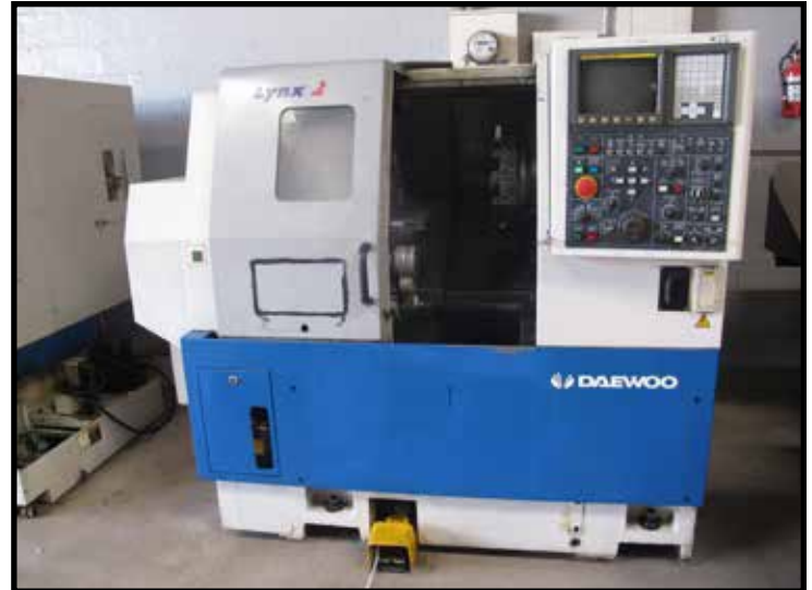
2000 Daewoo Lynx200A CNC Turning Center s/n L2001342 w/ Fanuc Series 21-T Controls, Tool Presetter, 12-Station Turret, Hydraulic Tailstock, Parts Catcher, 6 1/2" 3-Jaw Power Chuck, Coolant.