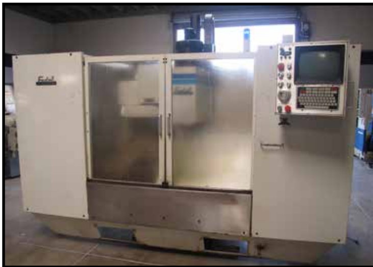
Fadal VMC4020HT CNC Vertical Machining Center s/n 9003047 w/ Fadal CNC88 Controls, 21-Station ATC, CAT-40 Taper Spindle, 20" x 48" Table, Coolant.