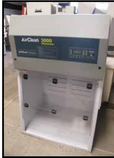
Air Clean Systems "AirClean 3000" Bench Model Flow Hood s/n AC3000-558 w/ Airsafe Digital Controls.