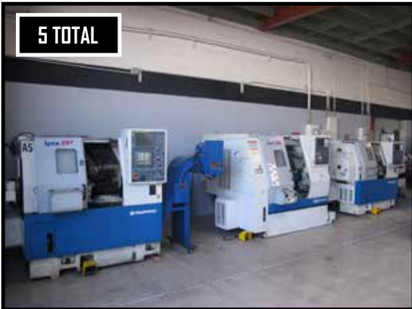
(5) Daewoo/Doosan CNC Turning Centers.

MAJOR FORKLIFT / CNC MACHINE TOOL AUCTION