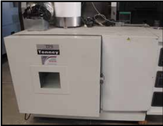
TPS Tenney mdl. BTRC -70 Deg C to 200 Deg C Thermal Chamber 0801000056 w/ TenneyVersaTenn II Digital Controls, Chart Recorder.