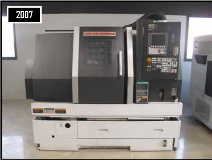
2007 Mori Seiki Dura Turn 2050 CNC Turning Center s/n DT205GG0201 w/ Mori Seiki MSC-504 Controls, Tool Presetter, 12-Station Turret, Hydraulic Tailstock, 8" 3-Jaw Power Chuck, 5C Collet Nose, Coolant.