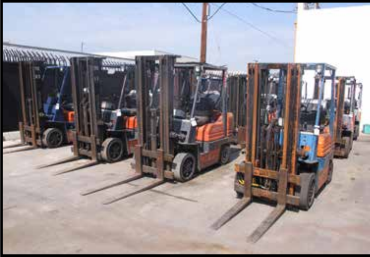
(15) Toyota 5FGC25 & 6FGCU25 5000 Lb Cap LPG Forklifts w/ 3-Stage Mast, Cushion Tires.