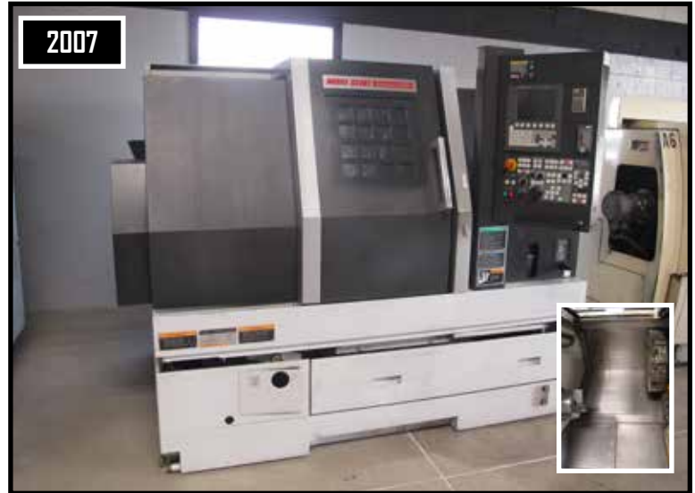
2007 Mori Seiki Dura Turn 2050 CNC Turning Center s/n DT205GG0199 w/ Mori Seiki MSC-504 Controls, Tool Presetter, 12-Station Turret, Hydraulic Tailstock, 8" 3-Jaw Power Chuck, 5C Collet Nose, Coolant.