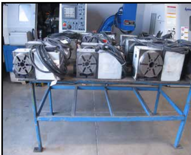
Large Selection of Haas HRT 210/HRT 160 4 th Axis Rotary Tables.