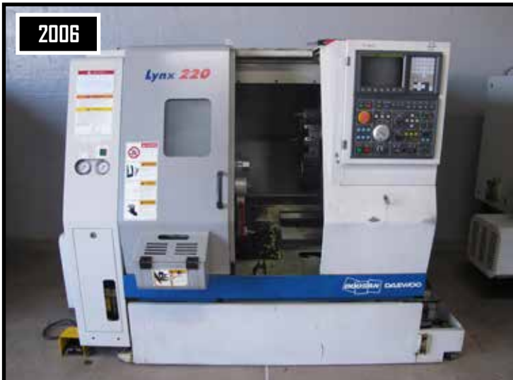
2006 Doosan Lynx220A CNC Turning Center s/n L2201200 w/ Fanuc i-Series Controls, Tool Presetter, 12-Station Turret, Hydraulic Tailstock, Parts Catcher, 6 1/2" 3-Jaw Power Chuck, Coolant.