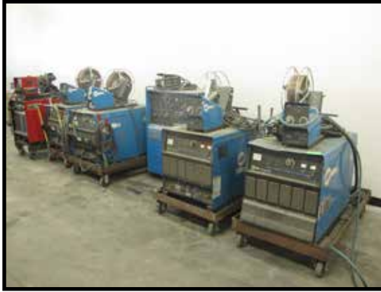
(6) Miller Deltaweld 452 CV-DC Arc welding Power Sources w/ Miller 70-Series Wire Feeders.