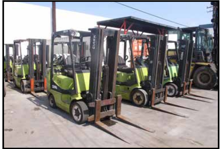
(7) Clark CGC25 5000 Lb Cap LPG Forklifts w/ 3-Stage Mast, 189" Lift Height, Cushion Tires.