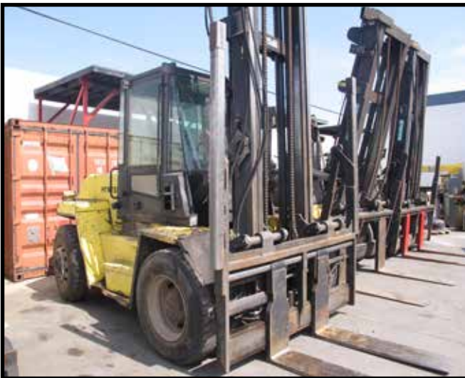
(3) 2000 Hyster H210XL 21,000 Lb Cap Diesel Forklifts w/ 2-Stage Tall Mast, 212" Lift Height, Monotrol Trans, Pneumatic Tires.