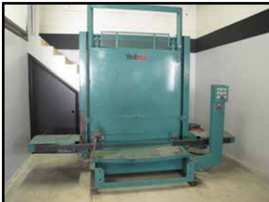
Wellsaw mdl. 12-20G Special Purpose Hydraulic Horizontal Band Saw s/n 231 Trim Cut Configuration, To 78" Max Diameter.