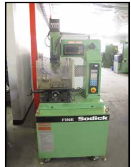
Sodick K1C Small Hole Porret EDM Machine w/ Mitutoyo KS DRO, Sodick Controls, 9 3/4" x 13 1/2" Table, 5" x 10" Magnetic Chuck.