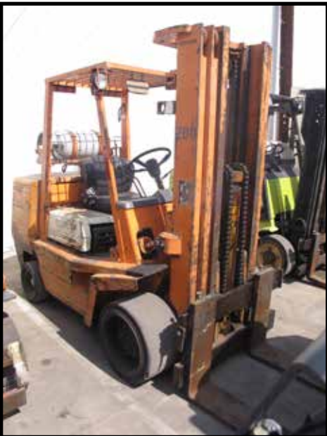
Toyota 10,000 lb Capacity LPG Forklift.