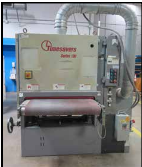
Timesavers Series 100 mdl. 137-1HPM 36" Belt Grainer s/n 50638M w/ Timesavers Controls, 36" Belt Feed, CAT mdl. C-5 Water-Filtered Dust Collector.