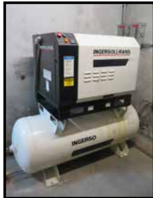
Ingersoll Rand SSR-HP15 15Hp Rotary Air Compressor

Directions : From Los Angeles, take the 5-Fwy South to the 805-Fwy South. Take the Main St exit (Exit #3) and turn left. Turn left on Brandywine Ave. Look for "Auction Today" signs.