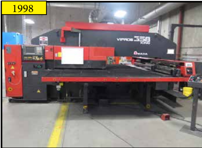
1998 Amada VIPROS 358 King 30 Ton 58-Station CNC Turret Punch Press w/ Fanuc 18-P Controls, 58-Station Thick Turret