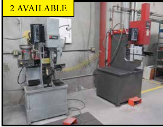
Haeger 618 Hardware Insertion Presses **2-AVAILABLE**