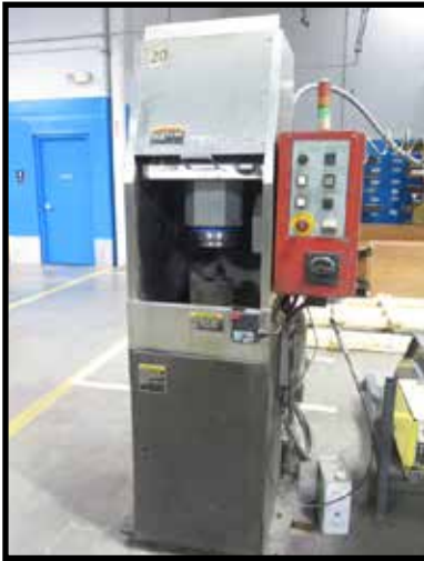
Amada TOGU III.US Automatic Punch and Die Grinder