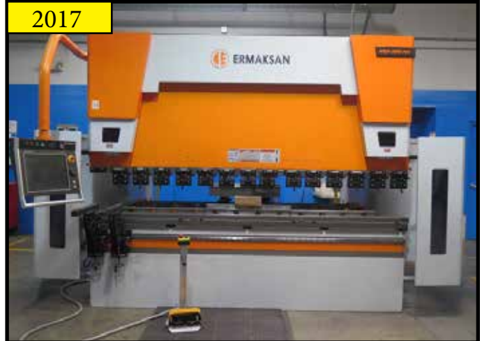
2017 Ermaksan "Speed Bend PRO 10.17X149" 149 Ton x 10' CNC Press Brake w/ Delem DA-66T Controls, Quick-Lock Holders