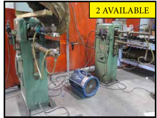
Acme Spot Welders **2-AVAILABLE**