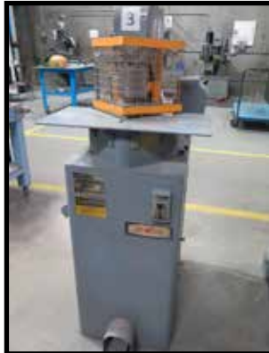
DiAcro 6" x 6" Power Tab Notcher