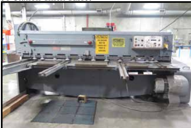
Amada M-2545 98" Power Shear