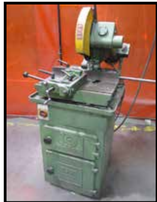
Doringer D350 Miter Cold Saw