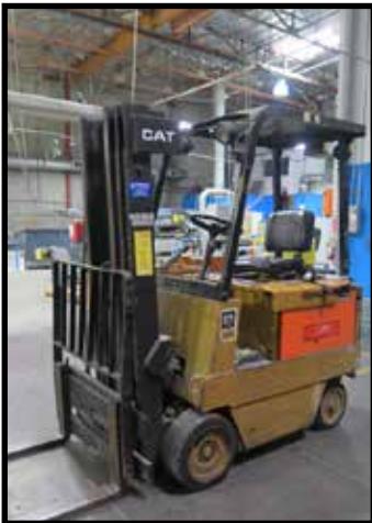
Caterpillar M40B 4000 Lb Cap Electric Forklift s/n Z90Y643 w/ 3-Stage Mast, 159" Lift Height, Side Shift, Cushion Tires, 6652 Metered Hours, Charger.

Caterpillar M40B 4000 Lb Cap Electric Forklift s/n Z90Y643 w/ 3-Stage Mast, 159" Lift Height, Side Shift, Cushion Tires, 6652 Metered Hours, Charger. Crown 35SCTT 3500 Lb Cap Electric Forklift s/n W-21572 w/ 3-Stage Mast, 154" Lift Height, Side Shift, Cushion Tires, 3489 Metered Hours, Charger. (6) Dayton, Pallet Master and Uline Pallet Jacks. (61) Sections of Pallet Racking. (8) Cantilever Sheet Stock Racks. Hydraulic Die Lift Carts. Digi-Weigh 5000 Lb Cap 48" x 48" Digital Platform Scale. Mettler 150 Lb Digital Scale. Precision Counting Systems Digital Counting Scale. Instapak 900 2-Part Foam-Fill Packaging System. Shipping Benches and Supplies. Sheet Carts and Shop Carts. Toshiba e-Studios 5560C Color Office Copy Machine w/ Collate, Sort and Staple. NEC SV9100 Phone System Product # CHS2UG-US. Reception Furniture and Display Cases. Conference Table and (8) Chairs. U-Shaped Office Desks. (2) Flammables Storage Cabinets. 36" x 60" Rolling Steel Table w/ Wilton 8" Bench Vise.