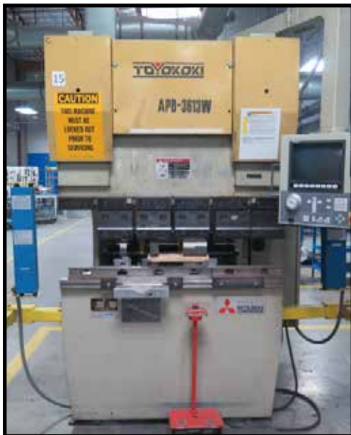
Toyokoki APB-3613W 50" CNC Press Brake w/ Toyokoki Controls