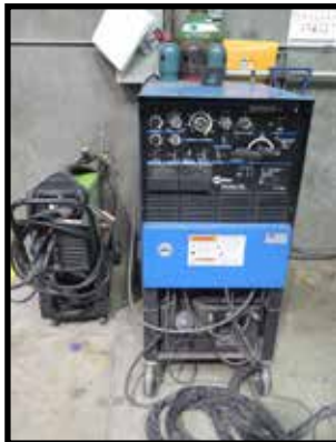
Miller and CIR Welders