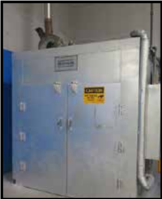
Binks BWN686-G Gas Fired Curing Oven

(2) Wilson 5-Drawer Rolling Tooling Cabinets w/ Wilson and Amada Press Brake Tooling. Wilson Thick Turret Punch Die Tooling. Misc Thin Turret Punch Die Tooling. Haeger Auto Feeder Accessories and Tooling. 6" Angle-Lock Vise. Suburban 5" x 12" x 8" Angle Master. DeWalt Angle Grinders, Drills and Routers. Milwaukee, Ryobi and Makita Cordless Tools. Dynafile Pneumatic Belt Sander. Pneumatic Orbital and Pad Sanders. Pneumatic Pop Riveters. Dake Arbor Press. Tenma mdl/. 21-10560 Soldering/Desoldering Station. Hakko and Weller Soldering Stations. Electrical Wire and Supply Racks. Insertion Hardware and Cabinets. Electronic Test Equipment. Welding Clamps, Bar Clamps and C-Clamps.