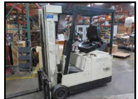
Crown 35SCTT 3500 Lb Cap Electric Forklift