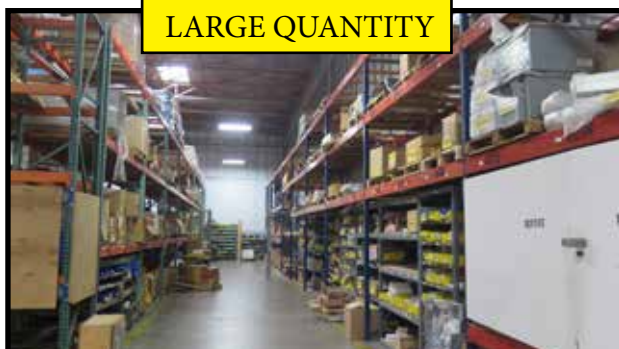
Pallet Racking **Large Quantity**