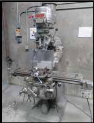
Bridgeport Series 1 - 2Hp Vertical Mill