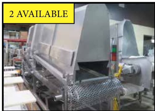
Cote Lydon Conveyors 29" x 16' Fully Enclosed Foreign Object Removal Systems **2-AVAILABLE**