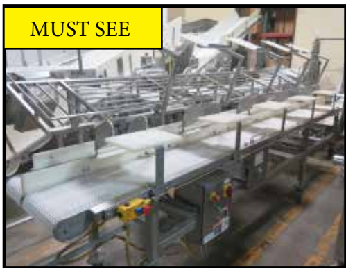
5-Station Trim and Prep Conveyor