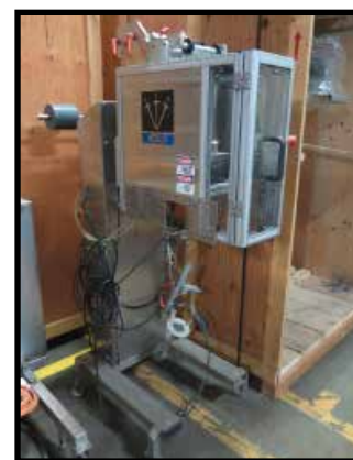
Aesus Systems ECO SHRINK 2010 Packaging Machine