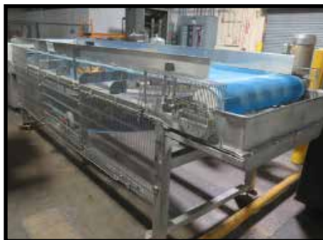
Turatti mdl.1580-17-000 De-Watering Conveyor w/ 42" W Mesh Belt