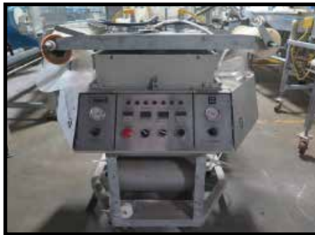
14" Vacuum Tray Sealer w/ Nitrogen Level Indicator