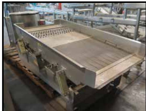
Key Technology mdl. 421789-1APFF Iso-Flo De-Watering Shaker