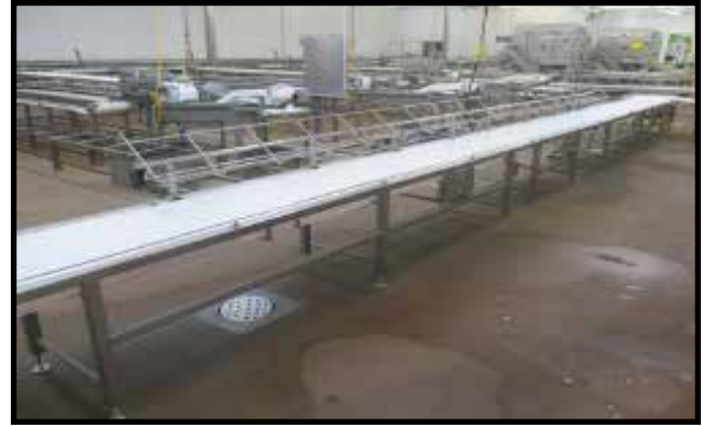
Bowl and Tray Manual Packaging Line