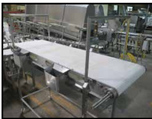
24" Belt x 84" Inspection Conveyor w/ (4) Drop Chutes