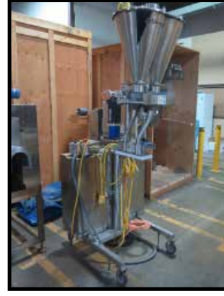
Spee-Dee mdl. CMS-194 Yogurt Dispenser