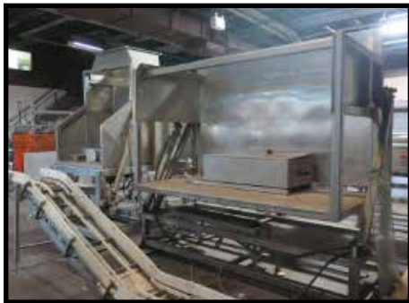
Single and Double Hydraulic Bin Dumpers