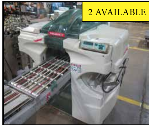
EXACT EQUIPMENT "POWER PACK WRAPPER GS" TRAY PACKAGING MACHINE **2-AVAILABLE**