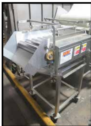
Key Technology SSR106066 Sliver Sizer