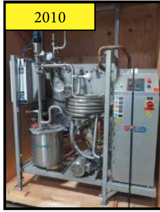
2010 Goodnature Products PNP360 Pasteurization System