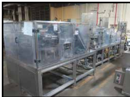
Pack-Line 6-Station Carousel Style Tray Packaging Machine w/ AB Panel View Controls