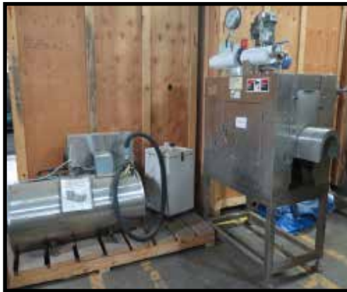
TRI PACK ST-3 7.5 STEAM TUNNEL W/ REIMERS RX36-120 SERIES STEAM BOILER