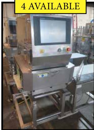
Anritsu Industrial Solutions D7416AWH X- Ray Inspection Systems