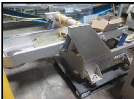
Key Technology SH01-005476 Iso-Flo Shaker