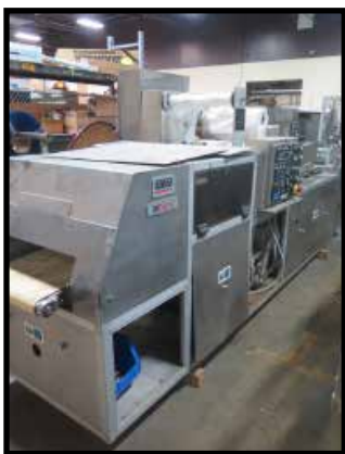
Reiser Ross / InPack A20 mdl. PXG-2 Tray Sealer (Film Cover) Machine