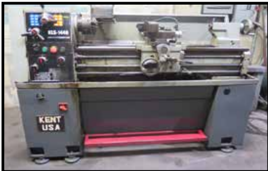
Kent KLS-1440 14" x 40" Geared Head Gap Bed Lathe