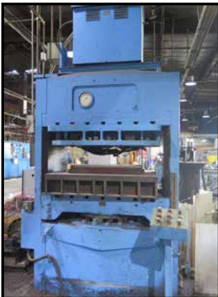
French Oil Mill Machinery Hydraulic Hydroform Press