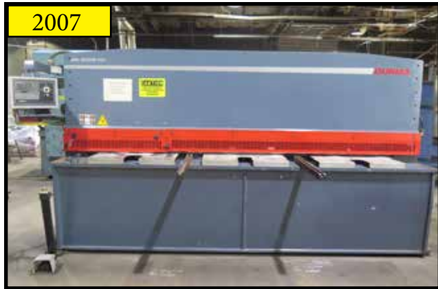
2007 Durma SB3006NT 1/4" x 122" CNC Power Shear w/ Durma ENC100M Controls