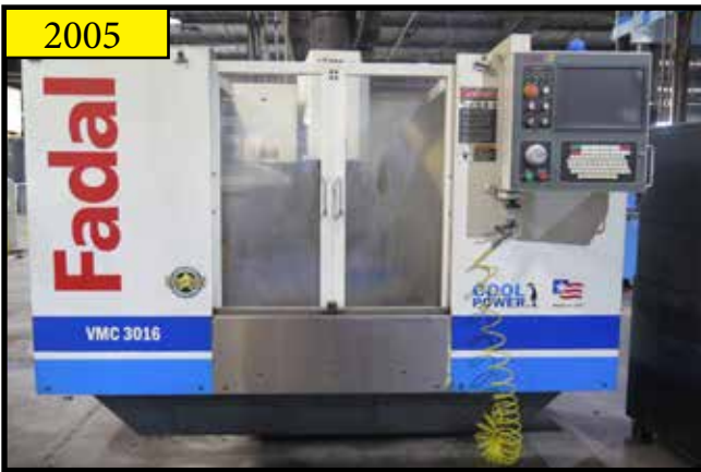
2005 Fadal VMC3016HT CNC Vertical Machining Center w/ Multi Processor Controls, 21-ATC, CAT-40, 10,000 RPM