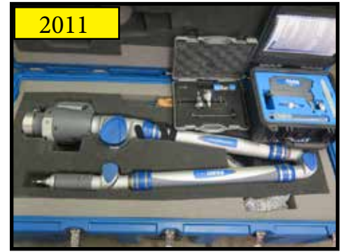
2011 Faro "Platinum" 8' 7-Axis CMM Faro Arm with Bluetooth w/ Faro Laser Line Probe V3 Laser Scanning Probe