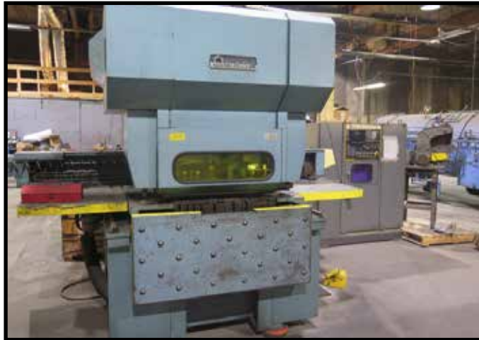
Amada OCTO 30-30-40 30-Ton 8-Station CNC Inline Punch Press w/ Amada-Fanuc-0 System 6M Controls