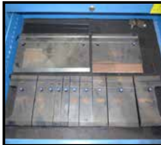
Wila and Wilton Button-Lock Press Brake Tooling