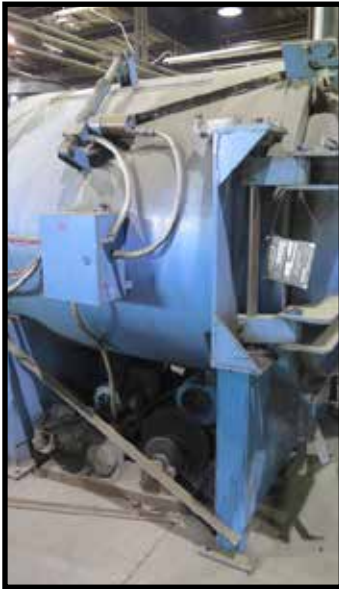
Lindburg Isobrite type 0921830124CX 1400 Deg F Vacuum Furnace