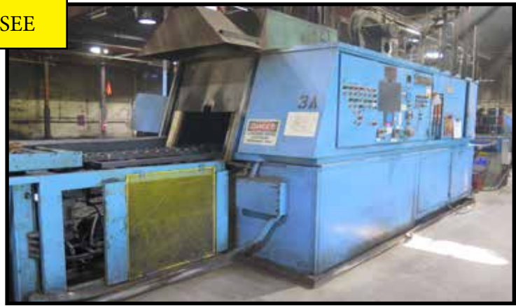
Lindburg Type TF-1 2000 Deg F Gas Fired Heat Treat Furnace with Oil Quench