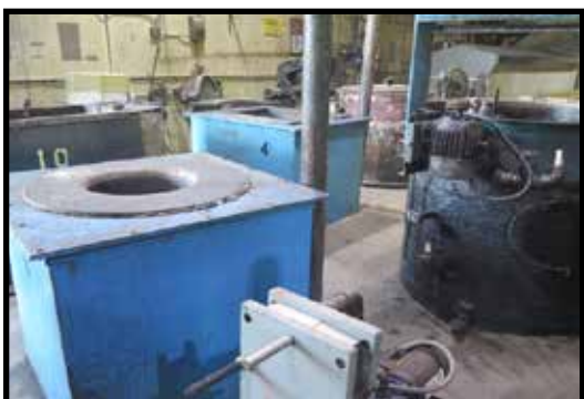
Neutral Salt Bath System