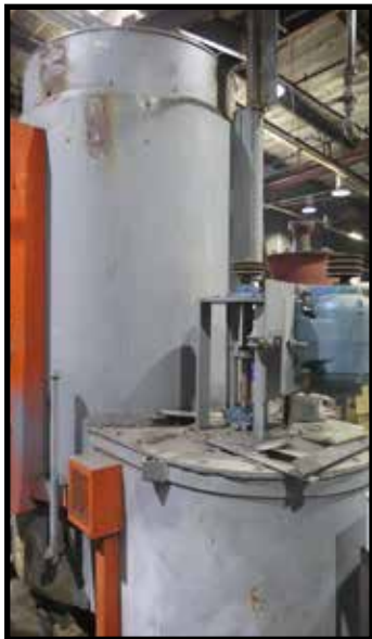
Lindburg Type 12-RO-2860-17A 1750 Degree F Air Temper Furnace