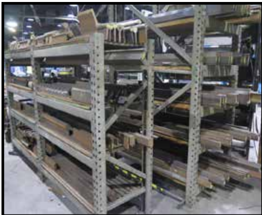
Press Brake Dies w/ Racks