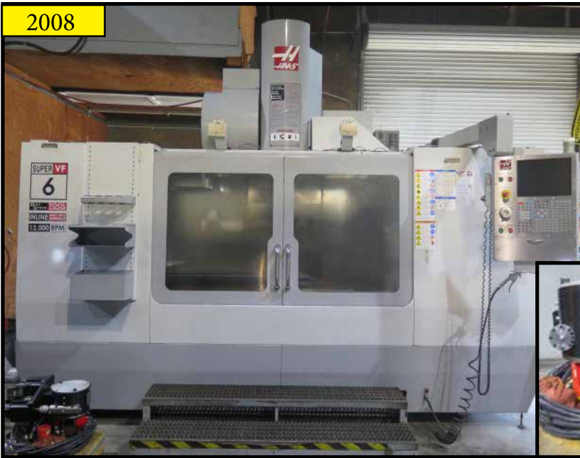
2008 Haas VF-6SS 5-Axis CNC Vertical Machining Center w/ Haas Controls, 24-Station Side Mount ATC, CAT-40 Taper Spindle, 12,000 Max RPM