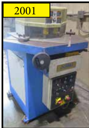
2001 Durma Type VHKM2004 8" x 8" Hydraulic Corner Notcher