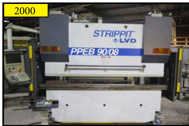
2000 Strippit LVD Type 90 BH 08 CADMAN-CNC "PPEB 90/08" 90 Ton x 8' CNC Hydraulic Press Brake