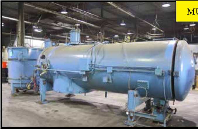
Lindburg Isovac type 09318-30124BRSX 2400 Degree F Vacuum Furnace