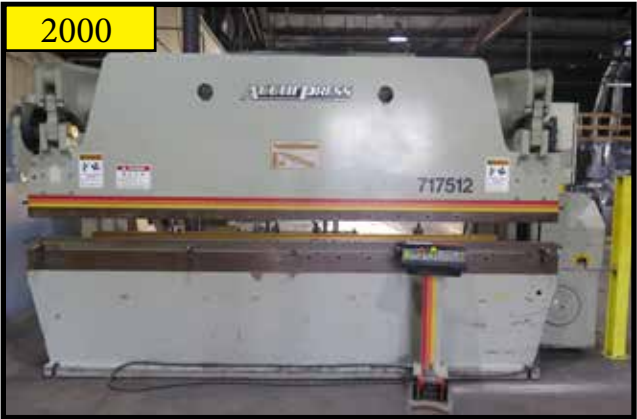
2000 Accurpress 717512 175 Ton x 12' CNC Hydraulic Press Brake