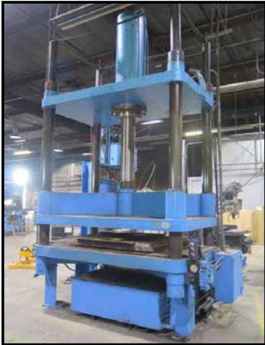
Nugier 200 Ton 4-Post Hydraulic Guided Platen Press