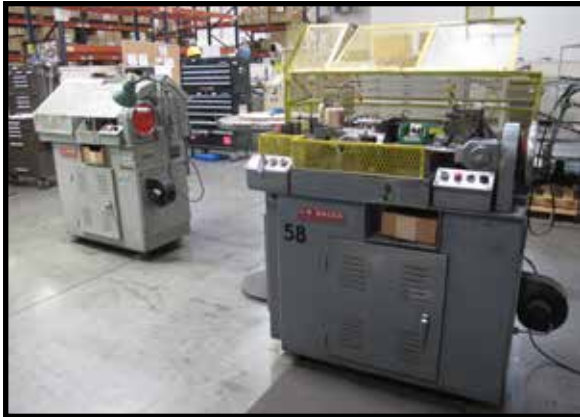
3) US BAIRD NO OF 4 SLIDE MACHINES, MODEL 00, S/N 244, 228, AND 111.