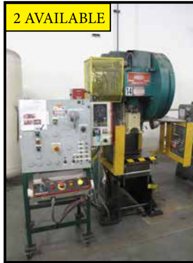
2) BENCHMARKER DIE MASTER 25 TON OBI PUNCH PRESS, LIGHT CURTAIN, W/ WINTRESS DIE PROTECTOR AND PALM BUTTON CONTROLS.