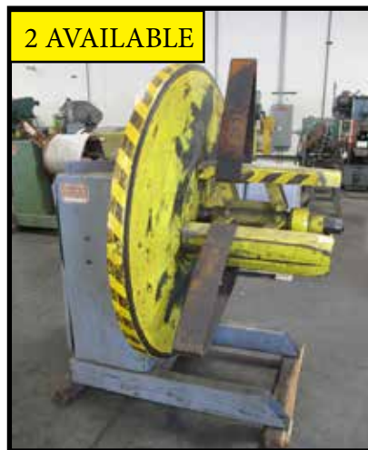
2) AMERICAN STEEL LINE 2500 LB MOTORIZED UNCOILERS.