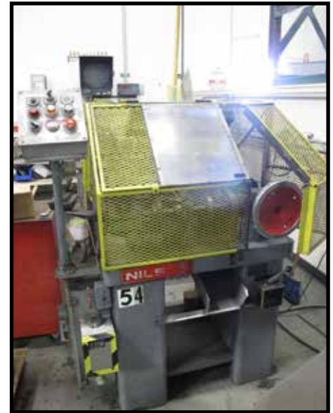
NILSON MODEL 70 4 SLIDE MACHINE, 1/32 CAP.