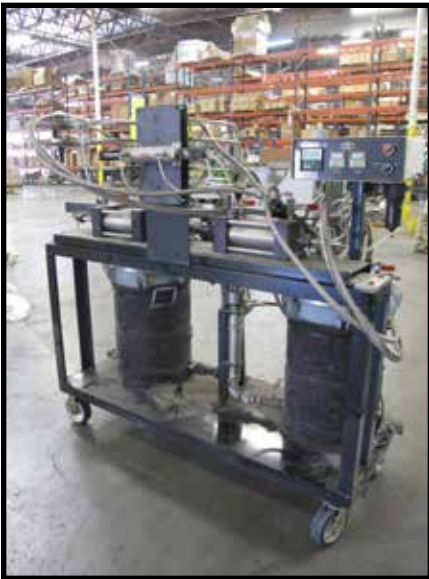
URETHANE PUMP SYSTEM (OVER $60K NEW)