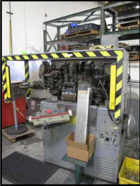
TORRINGTON VERTI SLIDE 4 SLIDE MACHINE, MAX WIDTH 1.500, MAX THICKNESS .062, FEED LENGTH 8" MAX, PRODUCTION 60 - 300 R.P.M.