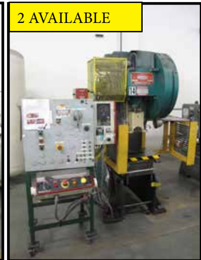
2) BENCHMASTER DIE MASTER 25 TON OBI PUNCH PRESS, LIGHT CURTAIN, W/ WINTRESS DIE PROTECTOR AND PALM BUTTON CONTROLS.