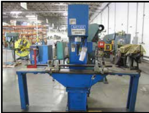
1997 EITEL RP-25, 25 TON HYDRAULIC PRESS WITH CRADLE TO STRAIGHTEN SHAFTS.