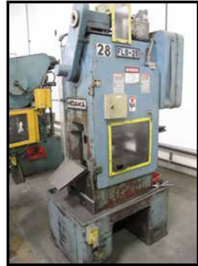
HIDAKA FLS-25, 25 TON HIGH SPEED PUNCH PRESS, 0-300 SPM, WINTRESS DIE PROTECTION.