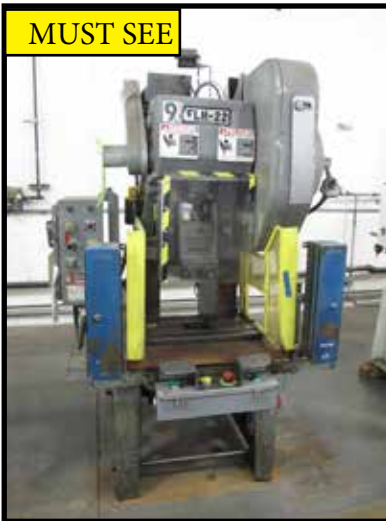
HIDAKA FLH-22, 22 TON PUNCH PRESS, 60 SPM, LIGHT CURTAINS, PALM BUTTONS.