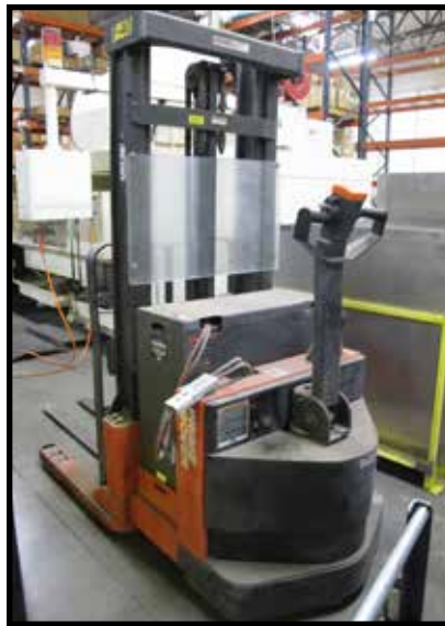
PRIME MOVER ELECTRIC PALLET JACK.