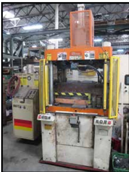
STOKES-PENWALT 35 TON HYD 4 POST PRESS, HEAT PLATTEN, 2) OILERS, LIGHT CURTAINS, MODEL 735-17, 32" X 24" WORK AREA BETWEEN THE POST (W X D).

NILSON MODEL 70 4 SLIDE MACHINE, 1/32 CAP.