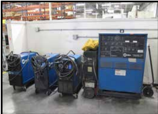
3) MILLER MILLERMATIC 250 MIG WELDERS.