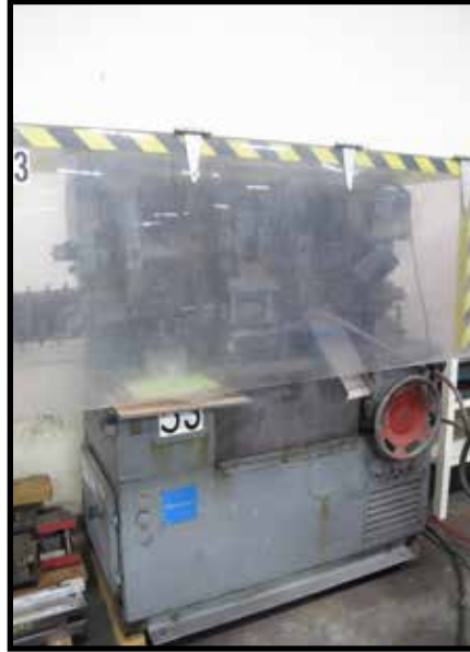
TORRINGTON VERTI SLIDE 4 SLIDE MACHINE,