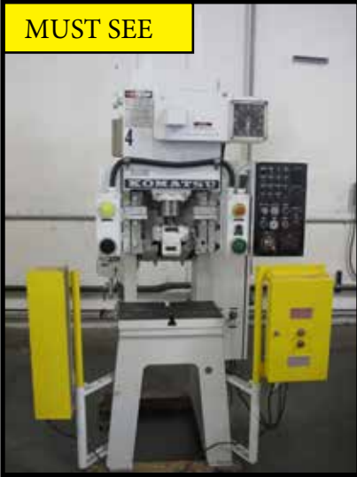
1984 KOMATSU OBS25-2, 25 TON PUNCH PRESS, 125 SPM, , 2.95" STROKE, (NEEDS WORK)