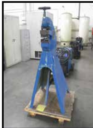
MERCHANT MODEL 6FG SHRINKING & STRETCHING MACHINE.