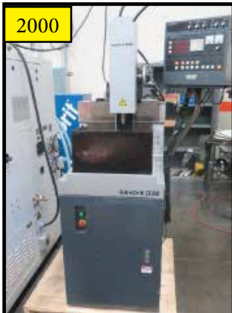
2000 Elenix / Current EDM "EDM Drill ST300" EDM Drilling Machine