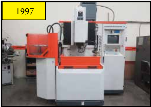
1997 Charmilles Roboform 31 CNC Die Sinker EDM Machine w/ Charmilles Controls, 15-Station ATC