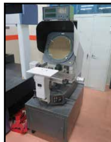
Mitutoyo PH350 14" Optical Comparator w/ Mitutoyo DRO