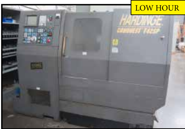
Hardinge Conquest T42SP Super Precision CNC Turning Center w/ Fanuc 18-T Controls, 12-Station Turret