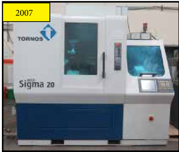
2007 Tornos DECO Sigma-20 6-Axis Sliding Headstock CNC Screw Machine w/ Fanuc 31iA Controls, 10,000 RPM All Axes, Full C-Axes, Radial Tooling