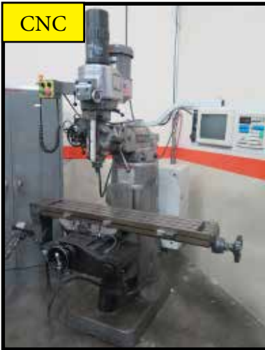
Bridgeport / EZ-Trak 2-Axis CNC Vertical Mill