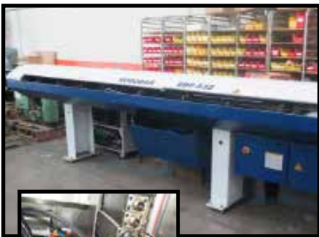
Robobar SBF-532 4M Automatic Bar Loader / Feeder