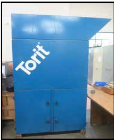
Donaldson Torit VS2400 Dust Collector