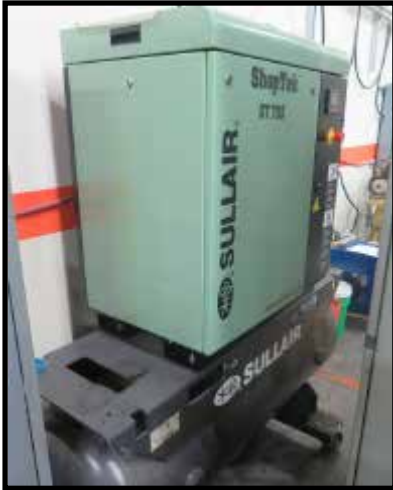
Sullair LS-10 25Hp Rotary Vane Air Compressor.