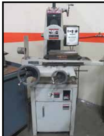
Harig 612 6" x 12" Surface Grinder

Donaldson Torit mdl. VS2400 Dust Collection System s/n IG537854-001-1.