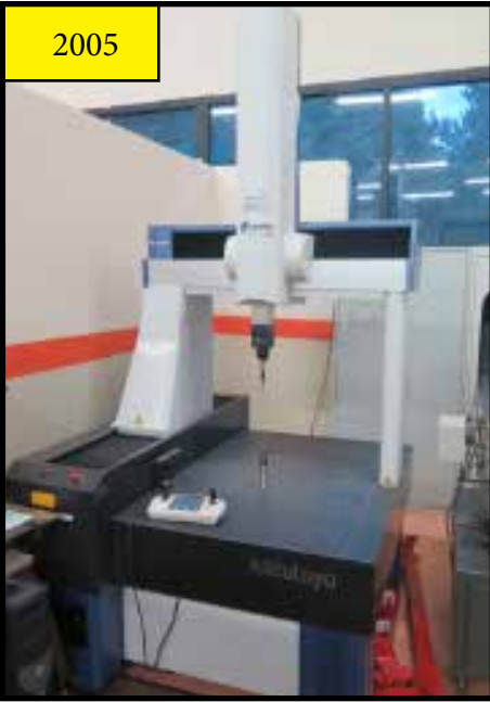
2005 Mitutoyo Crysta-Apex C776 4062M-3113 CMM Machine w/ Renishaw PH10MQ Motorized Probe and MRC20 6-Station Probe Tip Changer, Joystick Controller