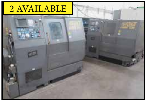
2 AVAILABLE Hardinge Conquest T42SP Super Precision CNC Turning Centers