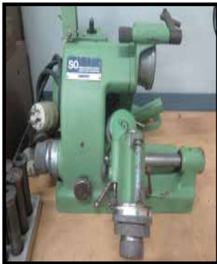
Deckel SO Single Lip Tool Grinder