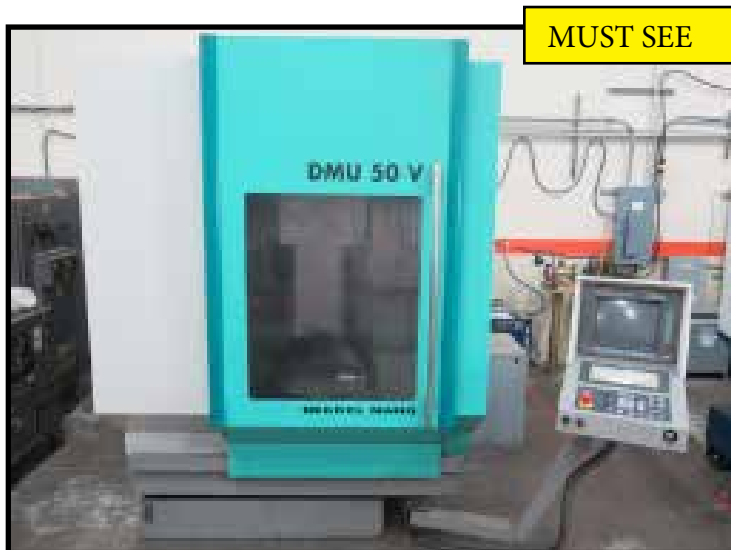
Deckel MAHO DMU50V 4-Axis CNC Vertical Machining Center w/ Deckel Mill Plus Controls, Dual 12-Station ATC's