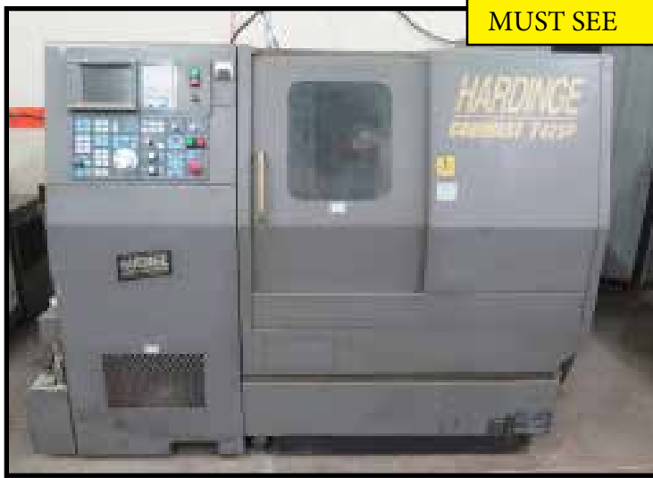
Hardinge Conquest T42SP Super Precision CNC Turning Center w/ Fanuc 18-T Controls, 12-Station Turret