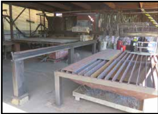
MG Cutting Systems 3-Head CNC Burn Table w/ Burny 3 CNC Controls