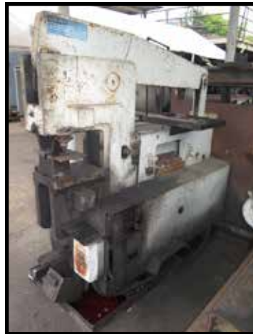
Scotchman / Excel mdl. 7012 70 Ton Hydraulic Iron Worker