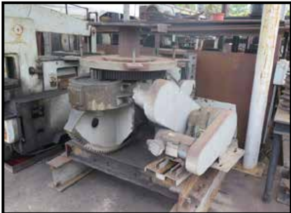
Motorized Welding Positioner