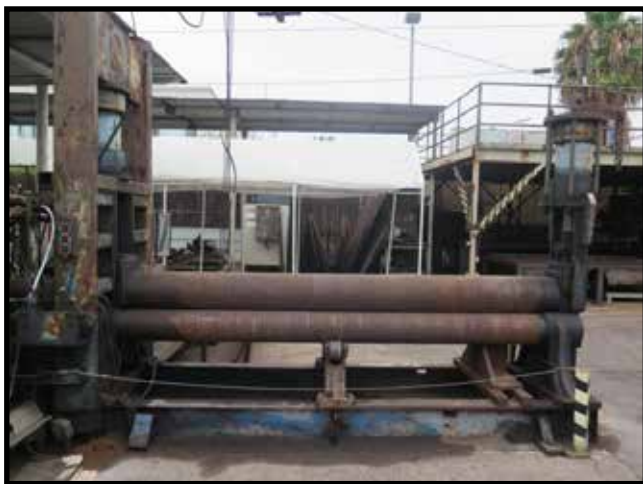
1" x 10' Cap Hydraulic Power Plate Roll

Duplicator Eye, 6' x 10' Burn Table, Duplicator Template Table, Torch Heads, Gauges and Supplies.