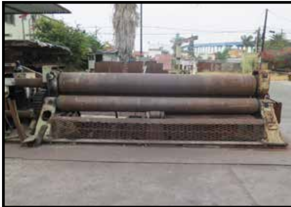
3" x 12' Cap Power Plate Roll