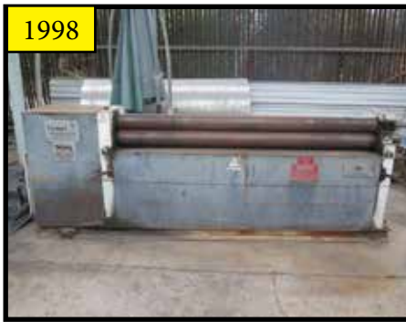
1998 Famar / Eagle A3122012 74" Power Pinch Roll