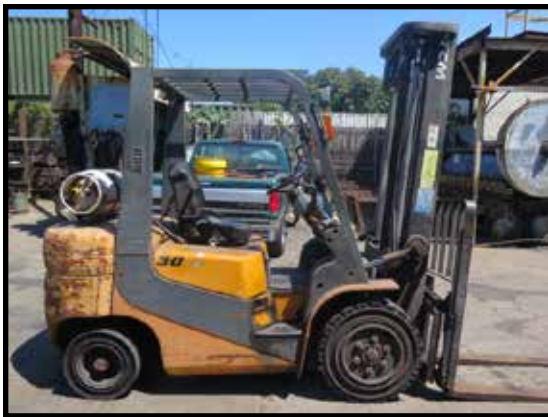
TCM FHC30T71 5700 Lb Cap LPG Forklift