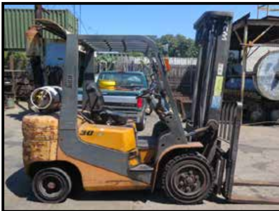
TCM FHC30T71 5700 Lb Cap LPG Forklift