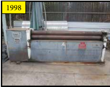
1998 Famar / Eagle A3122012 74" Power Pinch Roll