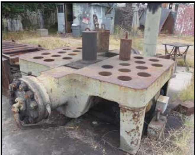
Hydraulic Camber and Straightening Machine