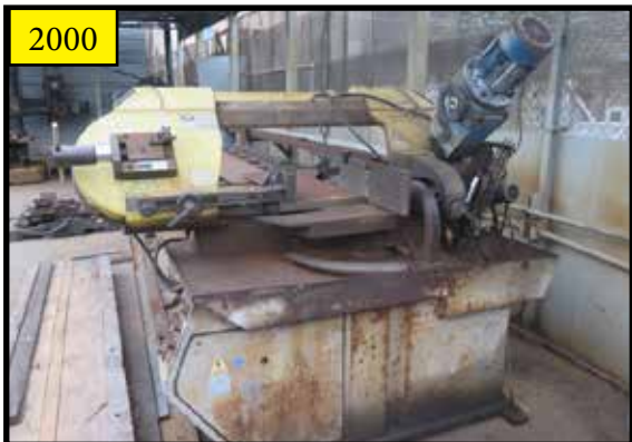
2000 FMB "Pegasus" 12' Hydraulic Miter Band Saw