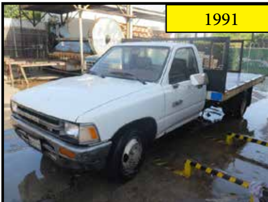
1991 Toyota 9' Stake Bed Truck