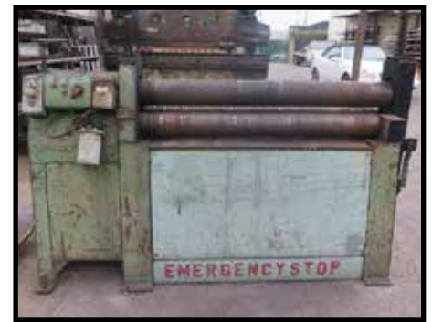
Morgan PBR 1250/6 52" Power Pinch Roll