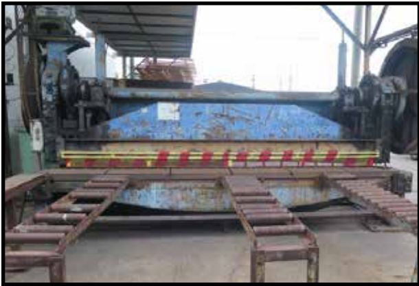
National Machine No. 14-C 14' Mechanical Shear