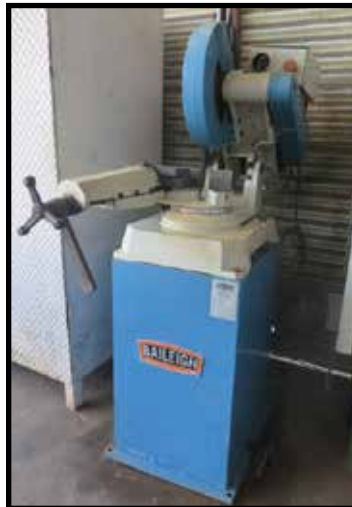
2014 Baileigh AS-350M 14' Miter Saw