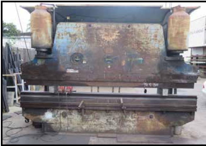
Pacific 200-14 200 Ton x 14' Hydraulic Press Brake