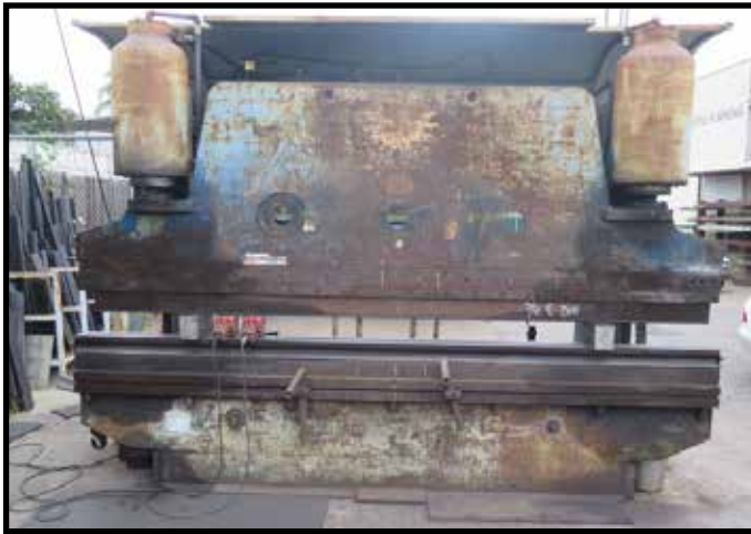
Pacific 200-14 200 Ton x 14' Hydraulic Press Brake