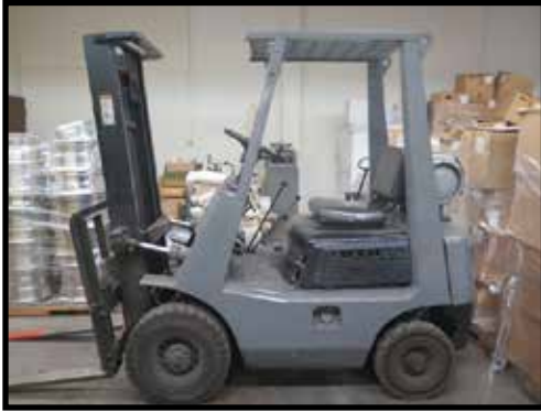
Toyota F3 2200 Lb Cap LPG Forklift