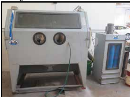
Skat Blast Dry Blast Cabinet w/ Dust Collection System