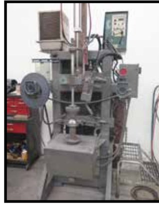
Custom Wheel Welder