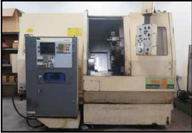
Nakamura-Tome TMC-4 CNC Turning Center w/ Fanuc Controls