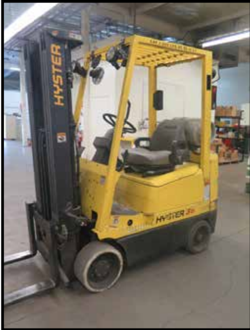
Hyster S35XM 2000 Lb Cap LPG Forklift