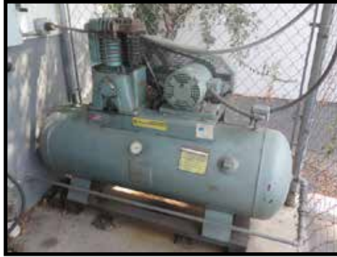
MEM 5Hp Air Compressor