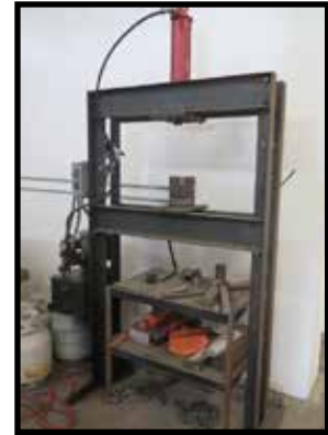
Electric/Hydraulic H-Frame Press