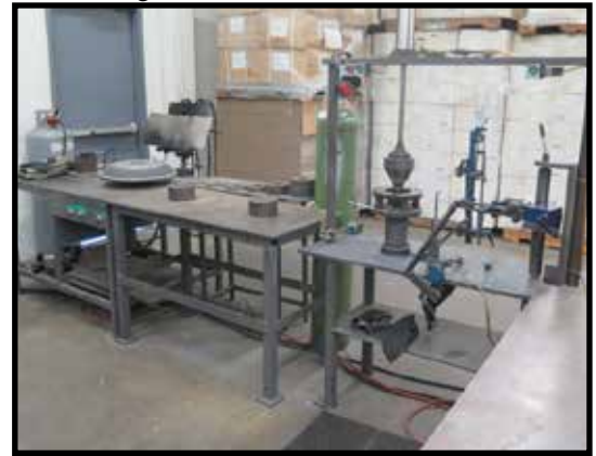
Wheel Assembly and Inspection Stations