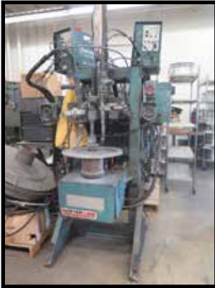
Custom 2-Head Wheel Welder