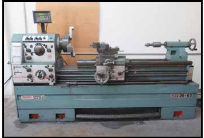
Namseon/Acra Turn 20" x 60" Gear-Gap Lathe w/ Newall DRO