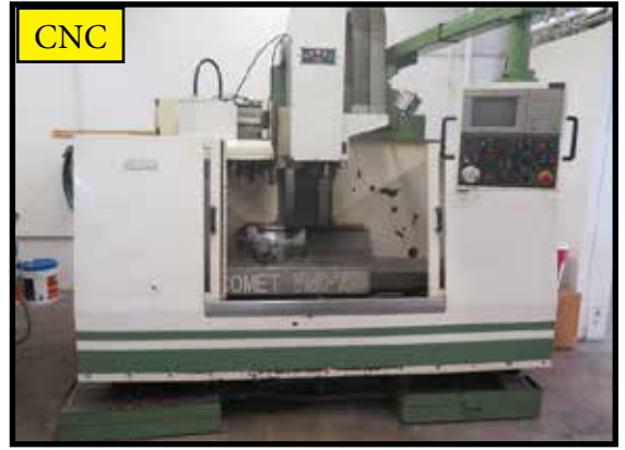
CNC Mighty Comet VMC-750P CNC Vertical Machining Center w/ Mitsubishi Controls