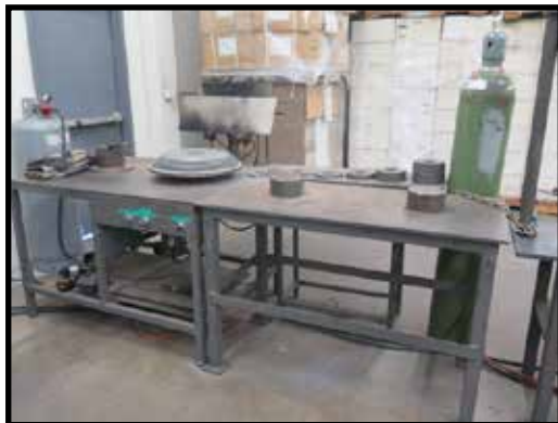
Wheel Preheat Station