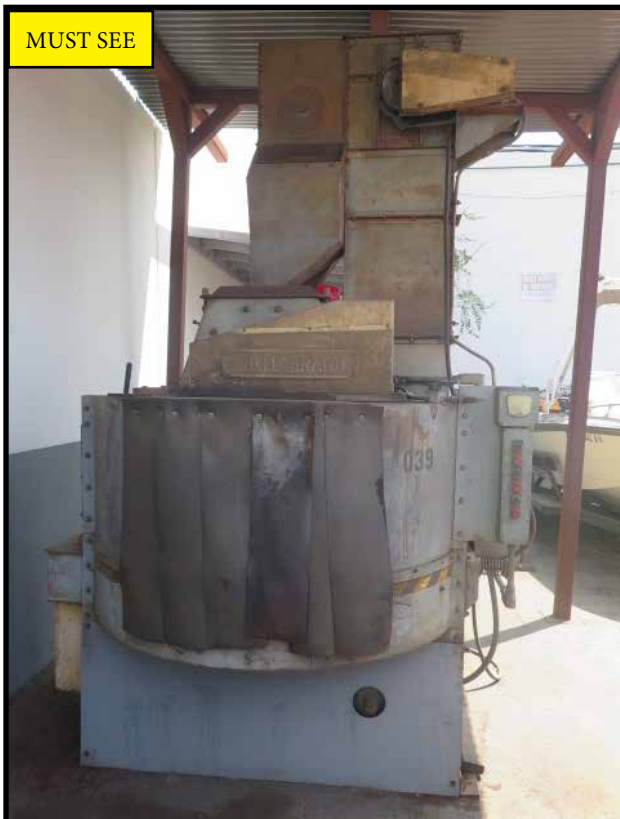
Wheelabrator No. 1 Shot Peening Machine w/ 5-Station Rotator