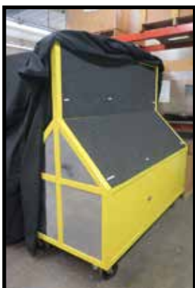
Trade Show Display Carts