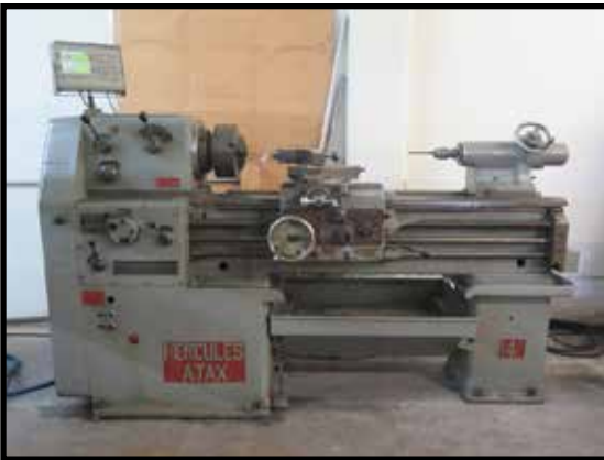
Hercules Ajax 14" x 42" Gear-Gap Lathe w/ Mitutoyo DRO