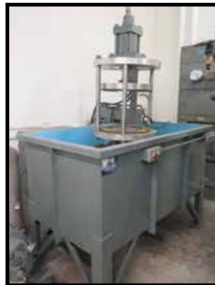
PM Plus Wheel Wash Tank