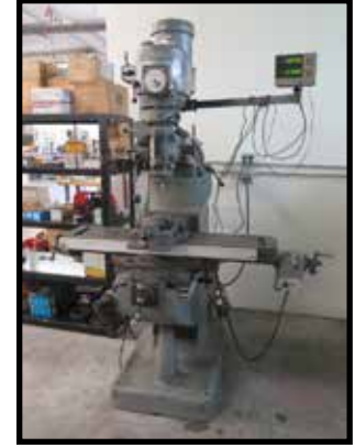
Bridgeport Vertical Mill w/ Mitutoyo DRO