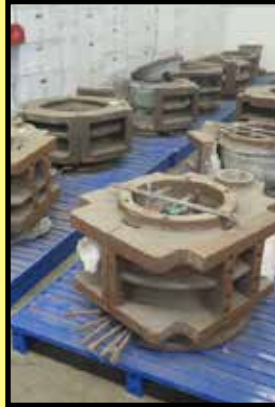
Rim Casting Dies