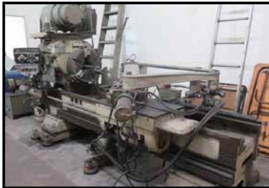
Lodge & Shipley Geared Head Hydraulic Tracing Lathe