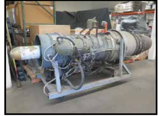
Westinghouse (7-16-1951) J34-WE-36A Gas Turbojet Engine