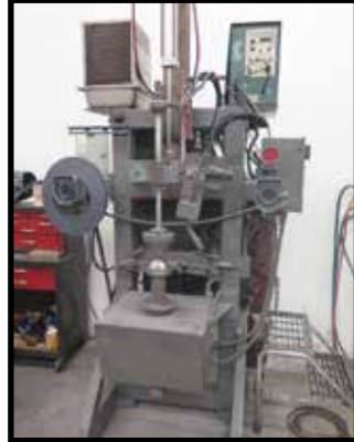
Custom Wheel Welder