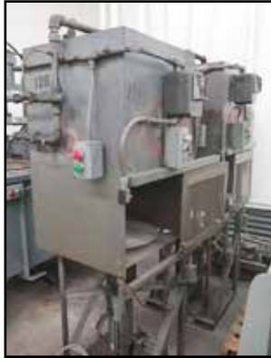
2-Station Preheat Oven