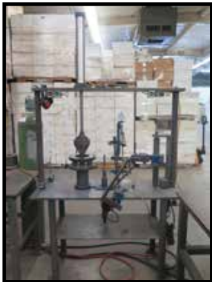
Wheel Run-Out Assemble and Inspection Station