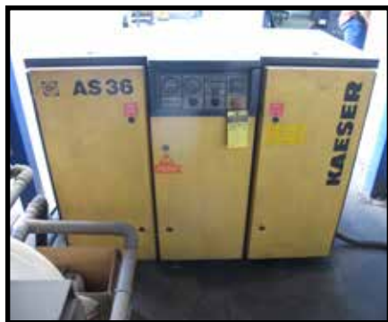
KAESAER AS36 ROTARY AIR COMPRESSOR, 26540 HOURS.