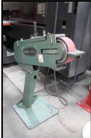
BURR KING 3" BELT SANDER.