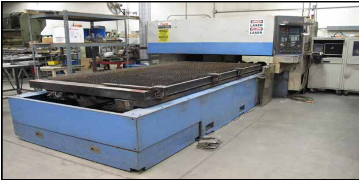
1996 MAZAK TURBO X510, 1000 WATT CNC LASER, 62" X 126" X 3.9" (YXZ), W/ MAZATROL32B CONTROL, TORIT DUST COLLECTION SYSTEM.