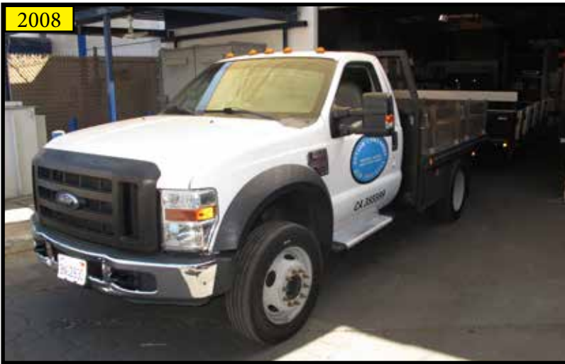
2008 FORD F450 SUPER DUTY V8 9FT STAKE BED TRUCK, 153K MILES.