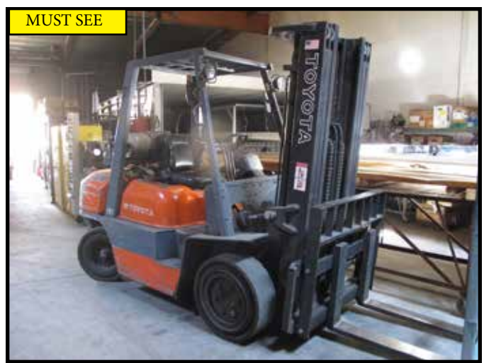
TOYOTA 8000 LB LPG FORKLIFT, 3 STAGE, SIDE SHIFT, 12970 HOURS.