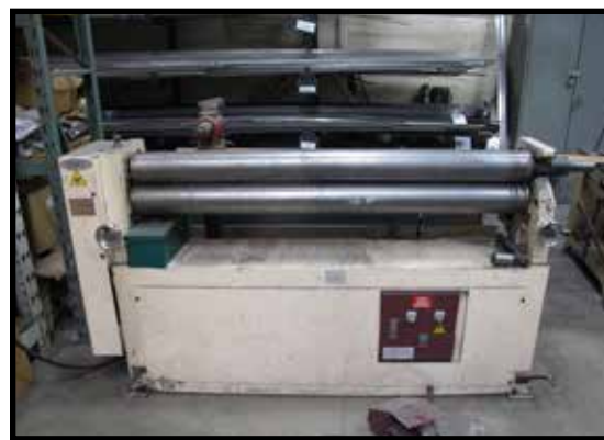
PBR MODEL 0510, 5FT INITIAL PINCH PLATE ROLLS, S/N 0708128.