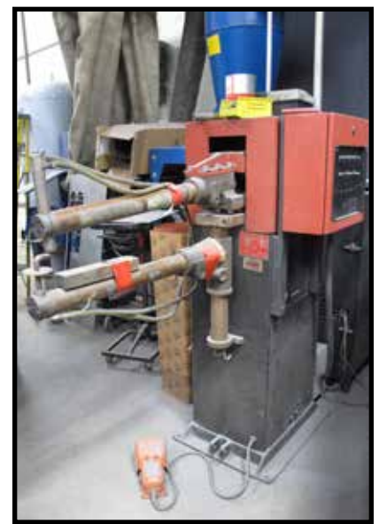
JANDA 50 KVA SPOT WELDER WITH JANDA CONTROLS.