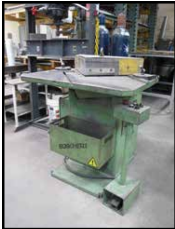
BOSCHERT LB12K4, HYDRAULIC CORNER NOTCHER, S/N 2158.