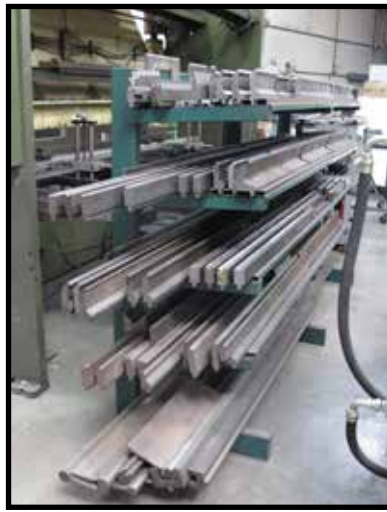
LARGE SELECTION OF PRESS BRAKE FORMING DIES