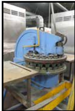
Powder Coating Booth with 3) Nordson Powder Coating Guns.

TERMS OF SALE: CASH OR CASHIERS CHECK ONLY. 15% BUYERS PREMIUM ON ALL PURCHASES. $200.00 REFUNDABLE CASH DEPOSIT. 25% CASH DEPOSIT TOWARDS ALL PURCHASES. ALL SALES ARE SUBJECT TO CALIFORNIA SALES TAX. THERE WILL BE NO EXCEPTIONS.