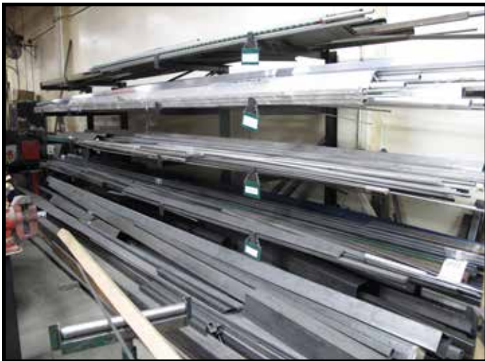
LARGE SELECTION OF MATERIAL