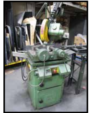
BROBO D-350 DORRINGER, 14" COLD SAW.