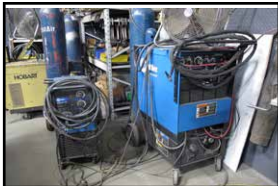
MILLER 251 MILLERMATIC MIG WELDERS.& MILLER SYNCROWAVE 250 TIG WELDERS.