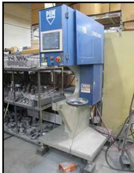
PEMSARTER SERIES 2000 HYD INSERTION PRESS WITH CRT.