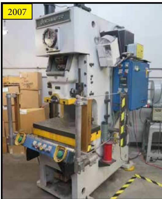
2007 Benchmaster SGR28 28 Ton Fixed Base Hydraulic Stamping Press w/ Ceico Press Control Package

H.E.S. 16 16" x 72" Geared Head Gap Bed Lathe s/n 17580 w/ 36-1800 RPM, Inch/mm Threading, Tracer Template, Tailstock, Trava-Dial, SPI Tool Post, 10" 3-Jaw Chuck, Coolant.