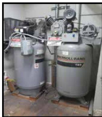
Ingersoll Rand T30 7.5Hp Vertical Air Compressors **2-AVAILABLE**

Aluminum, Stainless and Cold Roll Sheet Stock, Roll Stock and Bar Stock.