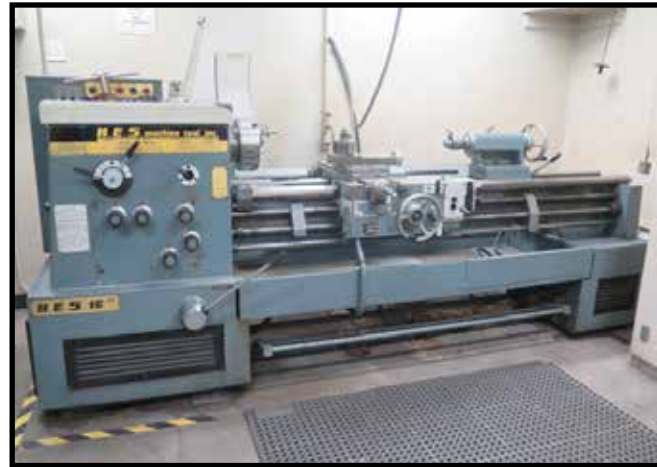
H.E.S. 16 16" x 72" Geared Head Gap Bed Lathe