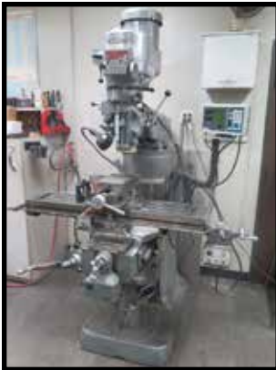
Bridgeport Series 1 - 2Hp Vertical Mill w/ Fagor Innova DRO