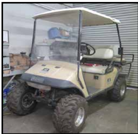
E-Z-Go mdl. 60 Electric Golf Cart