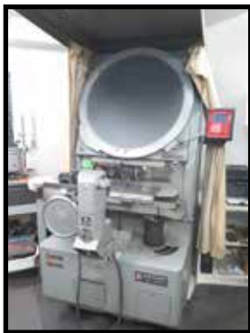
J & L C-30L 30" Optical Comparator w/ 2017 Upgraded