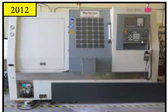
2012 Akira Seiki Performa SL-35 CNC Turning Center w/ Fanuc 0i-TB Controls