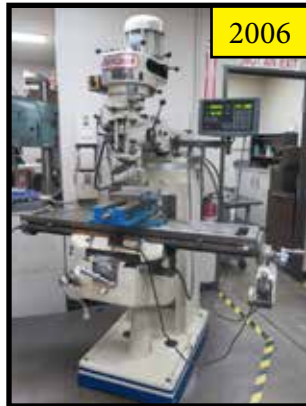
2006 Birmingham X6323A Vertical Mill w/ UNIQ SDS2MS Programmable DRO