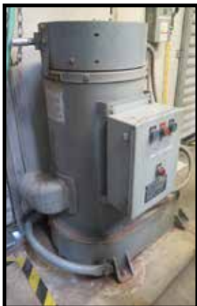
New Holland K-24 Chip Spinner

DoAll mdl. 2012-1AC 20" Sliding Table Vertical Band Saw s/n 340-78398 w/ Blade welder, 50-5200 FPM, 24" x 30 3/4" Miter Table. Kalamazoo mdl. 7AW 7" Horizontal Band Saw s/n 5548 w/ Manual Clamping, Work Stop. Boyar Schultz "Husk-E-Line" HR818 8" x 18" Surface Grinder w/ Walker Fine-Line Electromagnetic Chuck, Wheel Dresser, Coolant. Sunnen mdl. MBB-1600 Precision Honing Machine s/n 41676 w/ Coolant. Rockwell 2-Head Gang Drill Press w/ Rockwell mdl. 20 Variable Speed Heads, 125-1250 Dial RPM, 24" x 36" Table. Electro-Mechano mdl. 601J Variable Speed Bench Model Drill Press s/n 80347 w/ 150-4000 RPM, 14" x 19" Table. (2) Central Machinery Table Model Drill Presses. New Holland mdl. K-24 Chip Spinner. Apex 16" Pedestal Disc Sander. Palmgren 2" Pedestal Belt Sander. Burr King mdl. 562 1" Pedestal Belt Sander. Crane "Lapmaster 12" Lapping Machine w/ Compound Pump. Baldor Pedestal Carbide Tool Grinder. Dayton and Central Machinery Pedestal Grinders and Buffers. 6" Belt / 9" Disc Sander w/ Stand. Carolina mdl. CBP1200 50 Ton Hydraulic H-Frame Press s/n 11600. (2) Ingersoll Rand T30 7.5Hp Vertical Air Compressors w/ 2-Stage Pumps, 80 Gallon Tanks. Husky 2Hp Portable Air Compressor w/ 30 Gallon Tank. Mr. Deburr Media Tumbler w/ 13" x 31" Tub. Barrel Style Media Tumbler.