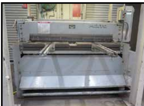
Pexto 12U52 12 GA x 52" Power Shear