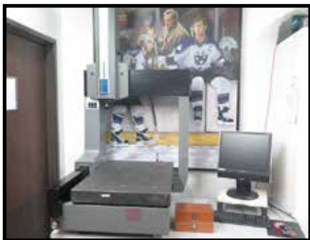
Brown & Sharpe MicroVal CMM Machine w/ Renishaw TP1S Probe