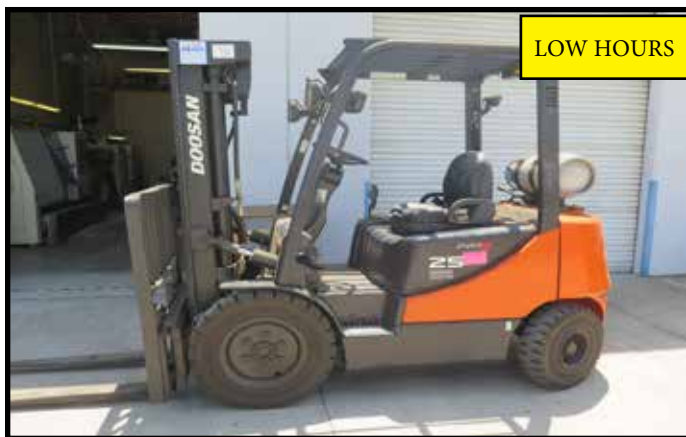
Doosan PRO-5 G25E-5 4600 Lb Cap LPG Forklift *