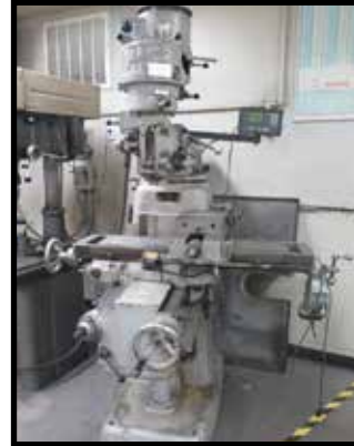
Induma Vertical Mill w/ Newall Topaz Program- mable DRO