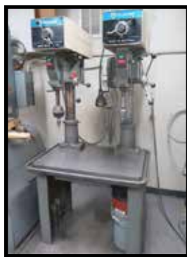
Rockwell 2-Head Gang Drill