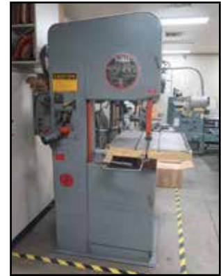
DoAll 20" Sliding Table Vertical Band Saw