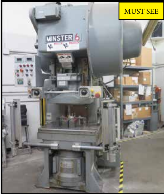
Minster 6 60 Ton OBS Fixed Base Stamping Press w/ Minster Controls **MUST SEE**