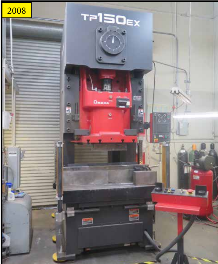
2008 Amada TP150EX 150 Metric Ton / 165 Short Ton Hydraulic Stamping Press Amada PLC Digital Controls