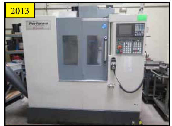
2013 Akira Seiki Performa SR2 XP CNC Vertical Machining Center w/ Mi645 Controls, 20-ATC, CAT-40, 11,000 RPM