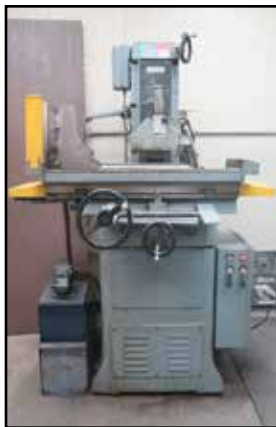
Boyar Schultz HR818 8" x 18" Surface Grinder