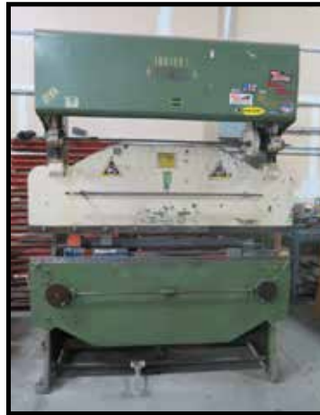
DiAcro 14-72 35 Ton x 6' Hydra-Power Press Brake