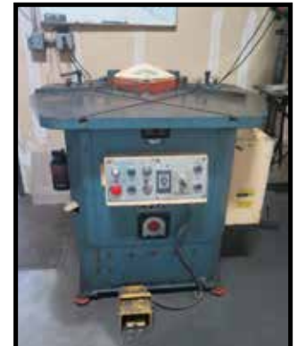
Amada CS-220 Hydraulic Corner Notcher