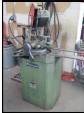
Scotchman / Bewo CPO-315-HT 12" Miter Cold Saw