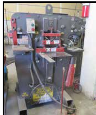
Edwards "JAWS IV" 55 Ton Iron Worker