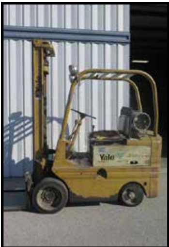
Yale / Eaton 5000 Lb Cap LPG Forklift