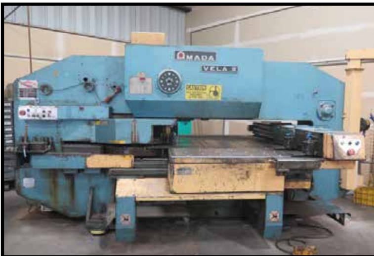
Amada VELA II 305050 30 Ton CNC Turret Punch Press w/ Amada-Fanuc-V Controls