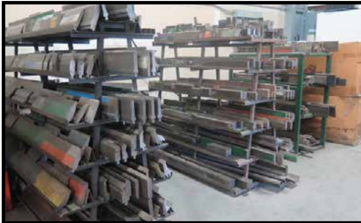
Press Brake Dies