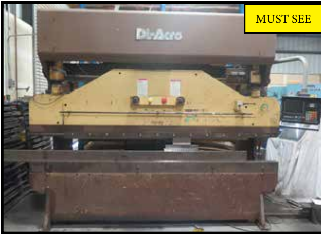
DiAcro 75 Ton x 10' CNC Hydra-Power Press Brake w/ Hurco Autobend-7 Controls