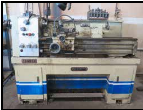
Trump 1340GH 13" x 40" Geared Head Gap Bed Lathe