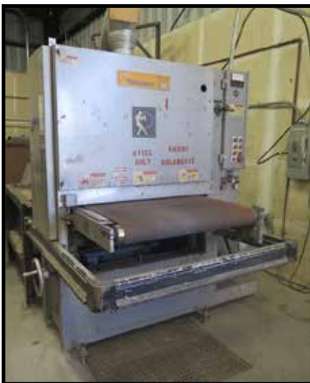
Timesavers 137-1 HPM/75 36" Belt Grainer