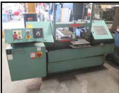
W.F. Wells W-9-1 9' Horizontal Band Saw