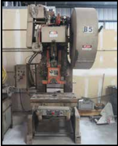
Rousselle No. 6A 60 Ton OBI Stamping Press