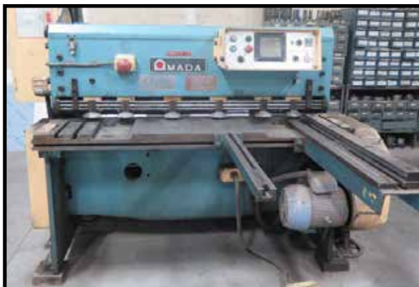
Amada M-1232 48" x 1/8" Power Shear