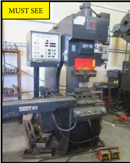
Amada SPH-30 30 Ton NC Punch Press w/ Amadan-SS System II Controls