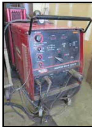
Lincoln Square Wave TIG 275 Arc Welder