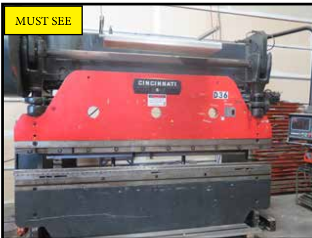
Cincinnati 5-Series 90 Ton x 8' CNC Press Brake w/ Hurco Autobend-7 Controls