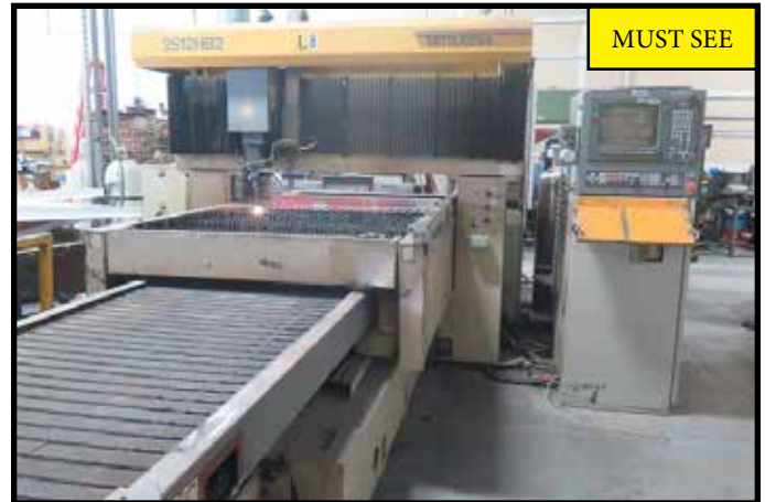
1991 Mitsubishi 2512HB2 CNC Laser Contour Machine w/ Mitsubishi LC10B Controls ***Resonator Rebuilt in 2011