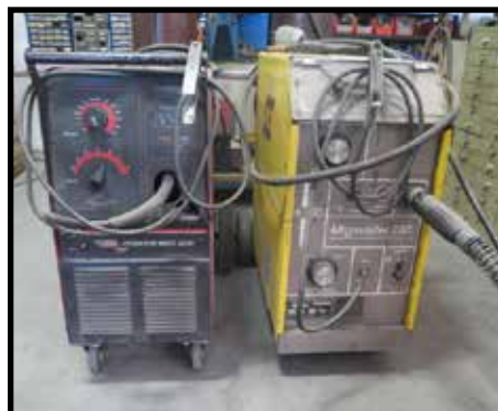
Lincoln and Esab MIG Welders