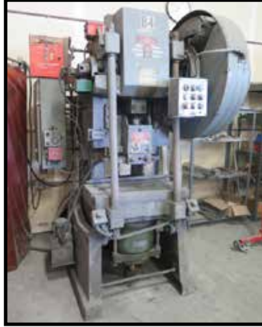
V & O "Super" 35 Ton OBI Stamping Press