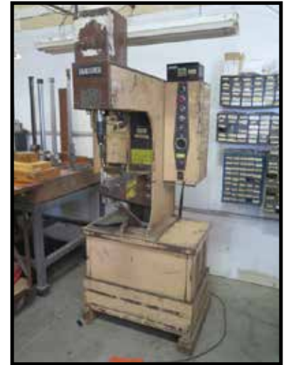
Haeger HP6-C 6 Ton Hardware Insertion Press