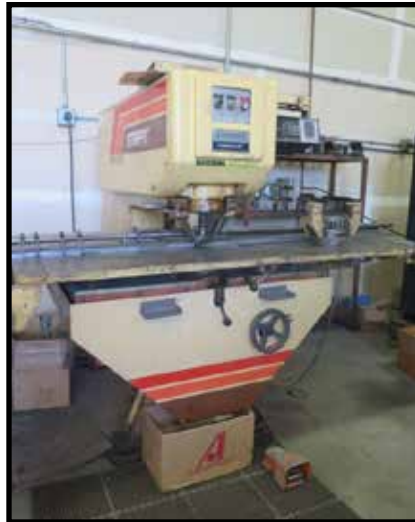
Strippit Super 30/30 Fabricator 30 Ton Punch Press