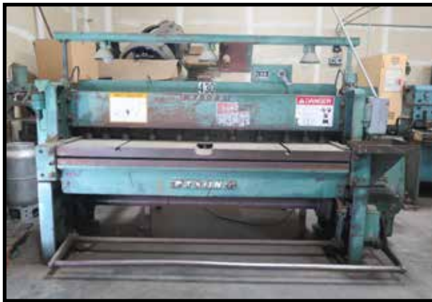
Wysong 6' Power Shear