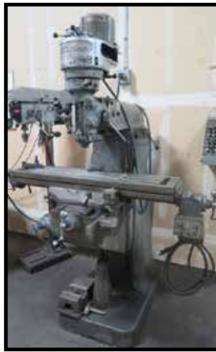
Bridgeport Vertical Mills ***4-AVAILABLE***