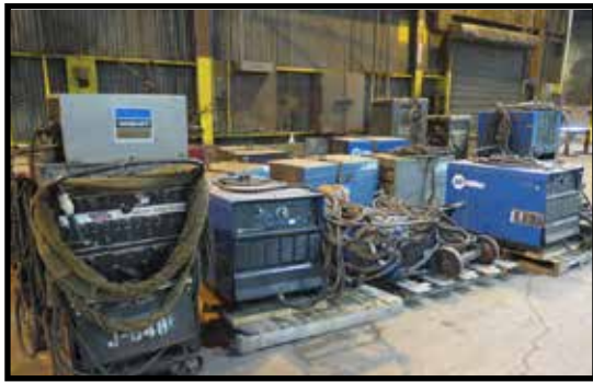
Miller and Lincoln Welders ***OVER 100 AVAILABLE***