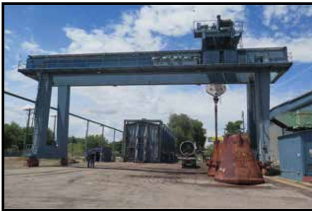
130 Ton Gantry Bridge Crane