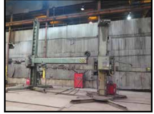
Welding Manipulators ***11-AVAILABLE***