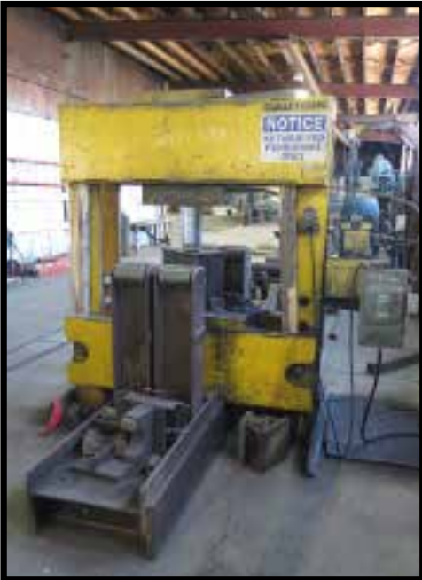
Hydraulic Beam Camber Press w/ 12" Strut H-Frame Body, 5" Sliding Ram