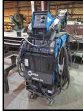
Miller "Pipe Worx 400" MIG-TIG-Stick Welding Power Source ***7-AVAILABLE***