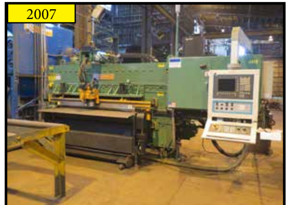
2007 Peddinghaus FPB1800/3 CNC 3-Punch Plate Line w/ Siemens 840D Controls, Plasma