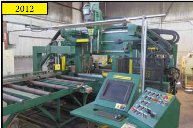
2012 Controlled Automation DRL-348TC CNC 3-Head Beam Drill w/ (2) Horizontal and (1) Vertical Drilling Head, 5-Station ATC @ Each Head, CAT-40 Spindles