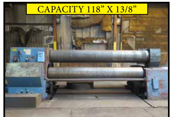
Pullmax / Kumla PV7H 118" x 1 3/8" Double Initial Pinch Power Plate Roll