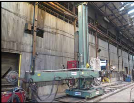
Pandjiris 1600 16' x 18' Welding Manipulator w/ Motorized Swing, 50' Rail System, LincolnPowerWave 1000 Welding Source and 10A Submerged Arc Feed System