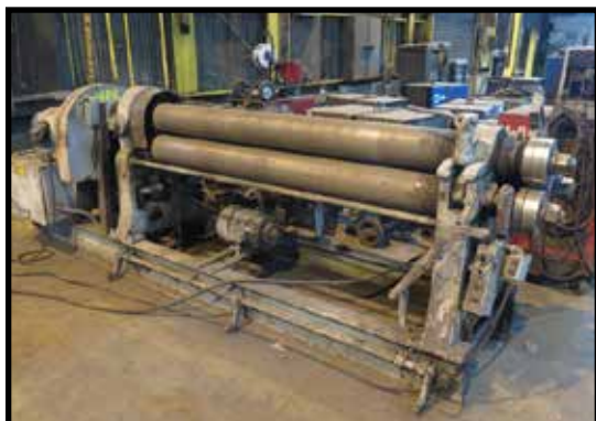
Hendley Beloit 4E 6' x 1/4" Cap Power Roll / Angle Roll Combo