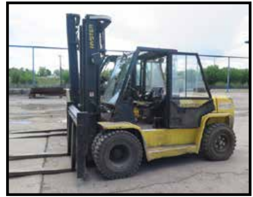
Hyster H155XL2 13,500 Lb Cap Diesel Forklift w/ 3-Stage Mast, 220.5" Lift Height, Fork Adjust