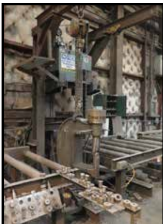
Whitney 790-058T Hydraulic C-Frame Beam Punch w/ 19" Throat, Tooling