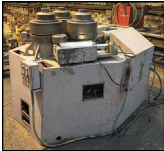
American Pullmax Z-41 Hydraulic Horizontal / Vertical Angle Roll w/ 3 3/4" Spindles