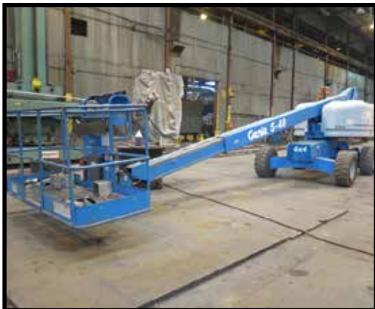
2005 Genie S-40 4X4 40' Telescoping Boom Lift w/ Deutz Diesel Engine **2-AVAILABLE**