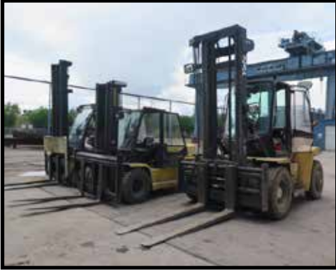
Yale and Hyster Forklifts ***5-AVAILABLE***