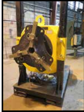
2015 L.J. Welding Automation 30P-200 5400 Lb Cap Welding Positioners **2-AVAILABLE**