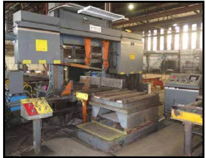
HEM Saw WF-190MRB-DC Miter Beam Saw w/ HEM Controls, 44"W x 25"H @ 90 Degree Cutting Cap.