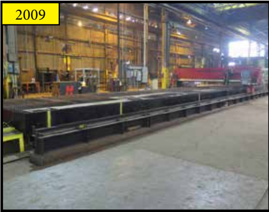
2009 Koike Aronson "Mastergraph Millennium Series" MGM3100 CNC Plasma Cutting Table w/Schneider Magelis and Hypertherm EdgePRO Controls, 10' x 67' Water Table