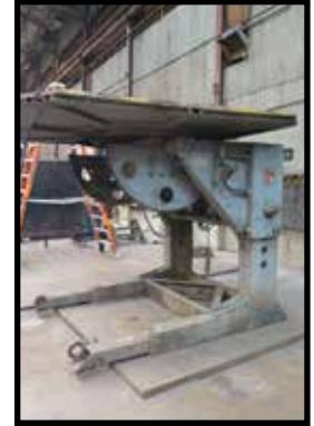
Ransome 240EAB 24,000 Lb Cap Welding Positioner w/ 5' x 5' Table