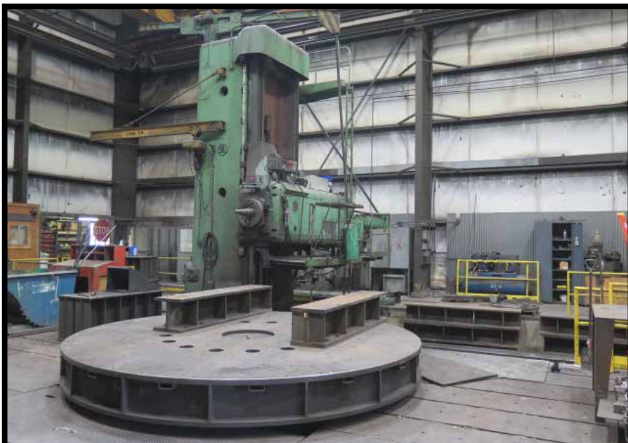
Skoda WD-160 4-Axis Horizontal Boring Mill w/ Heidenhain 3-Axis DRO, 1.5-630 Spindle RPM, 8"