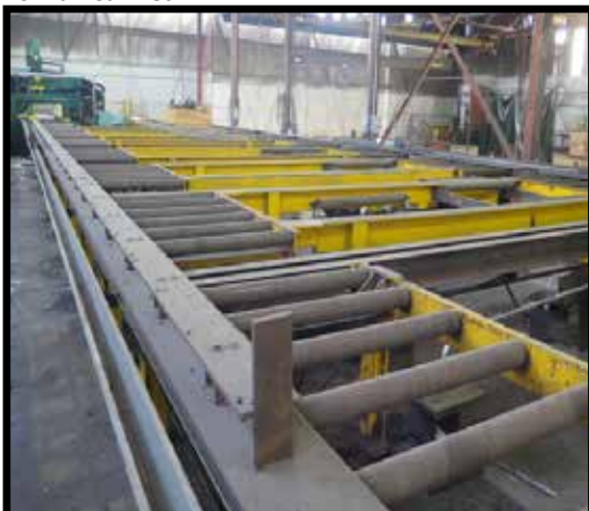
Promacut Automated Single or Dual Feed Transfer System w/ 22'4" x 70' Conveyor System