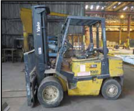
Yale CDP080LGNBV120 8000 Lb Cap Diesel Forklift w/ 3-Stage Mast, 178" Lift Height, Side Shift