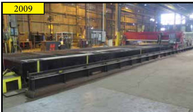
2009 Koike Aronson "Mastergraph Millennium Series" MGM3100 CNC Plasma Cutting Table w/Schneider Magelis and Hypertherm EdgePRO Controls, 10' x 67' Water Table