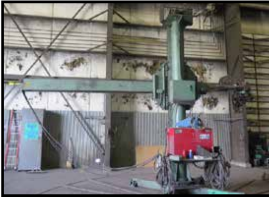
Preston-Easton 12' x 15' Welding Manipulator w/ Lincoln DC-1000 Welding Source and NA-3N Submerged Arc Feed System