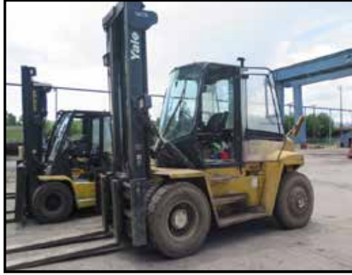
Yale GP210DB 18,950 Lb Cap Diesel Forklift w/ 2-Stage Tall Mast, 183" Lift Height, Fork Adjust