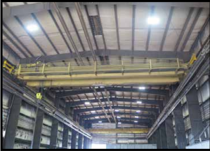
30 Ton Bridge Cranes ***3-AVAILABLE 46BRIDGE CRANES TOTAL***