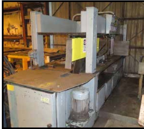
Trennjaeger LKH 420/1000 Hydraulic Miter Cold Beam Saw w/ 20" Height Cap, 56" Blade