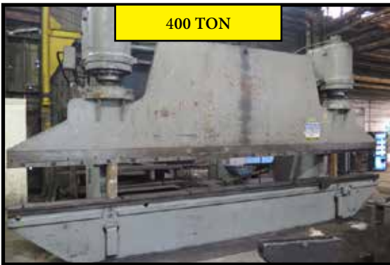
Chicago 400-F-12 400 Ton x 20' Hydraulic Press Brake

Ingersoll Rand 7.5Hp Vertical Air Compressor w/ 2-Stage Pump, 80 Gallon Tank, Dominick Hunter Refrigerated Air Dryer.