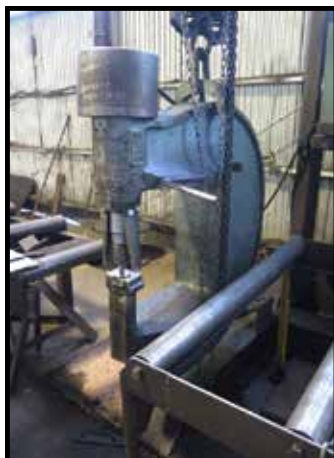
Whitney 791-0001 90 Ton C-Frame Beam Punch w/ 13" Throat