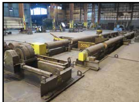
"Fit-Up" Power Tank Rolls 40' Length