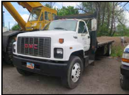
1995 GMC Top Kick – Cat Diesel 24' Stake Bed Truck