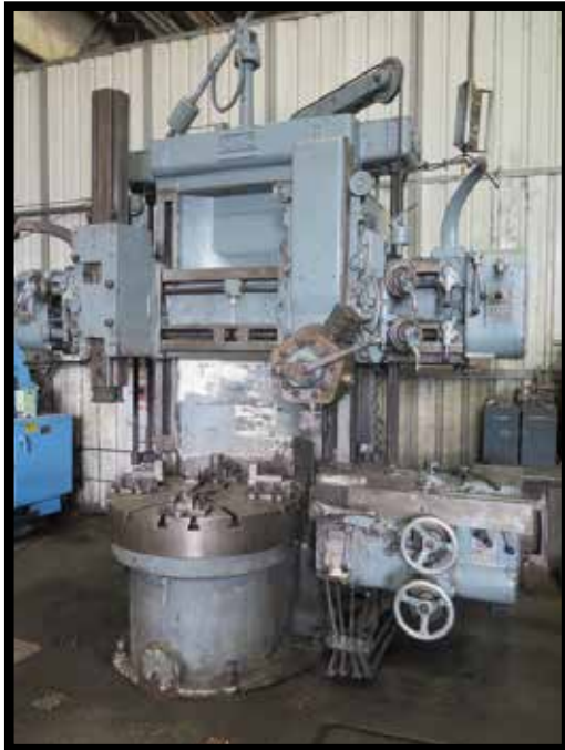
King 42" Twin Head Vertical Turret Lathe w/ 47" Swing