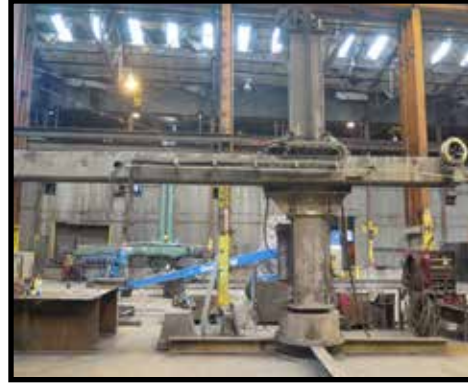
Pandjiris 10' x 8' Welding Manipulator w/ Lincoln DC-1000 CV-CC-DC Welding Source, and NA-3N Submerged Arc Feed System