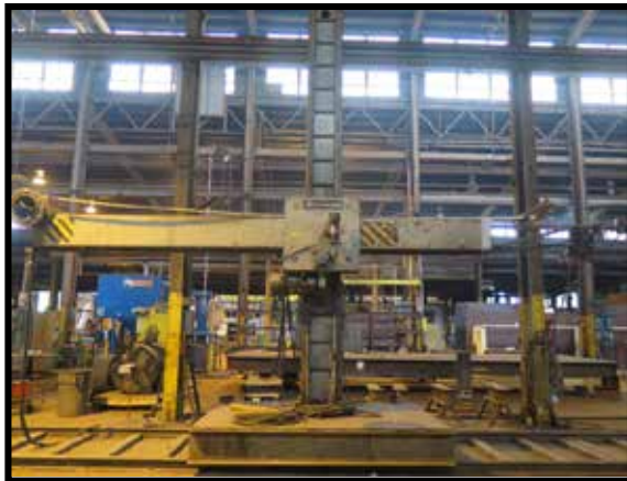
Aronson S14VRA14CL-MKVT-60-KB 14' x 14' Welding Manipulator w/ 56' Track System, Lincoln