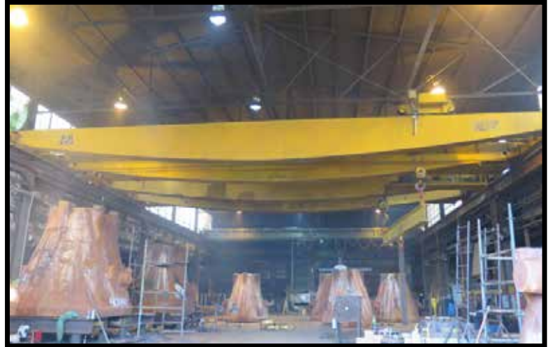
P & H 25 Ton Bridge Cranes w/ Radio Controls ***2-AVAILABLE***