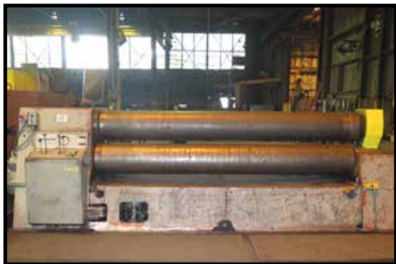
Pullmax KUMLA 10' x 1/2" Double Initial Pinch Hydraulic Plate Roll w/ 15" Rolls