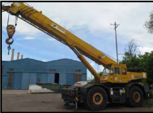
1997 Tadano TR-500E 55 Ton Rough Terrain Crain w/ 112' Boom Reach, 56' Jib Reach