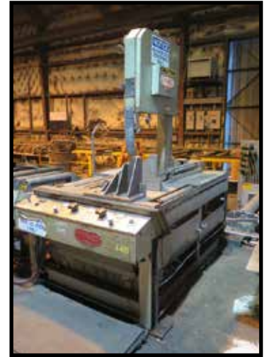
Kalamazoo VTH-21 22" Vertical Miter Band Saw