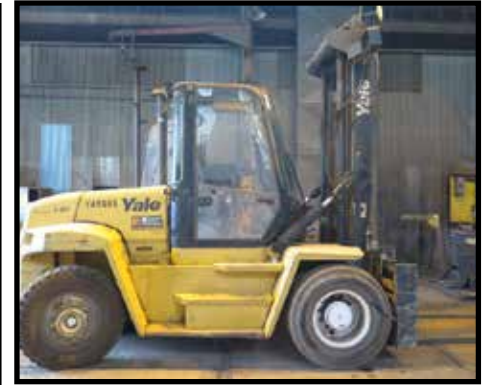
Yale GP210DB 18,150 Lb Cap Diesel Forklift w/ 2-Stage Mast, 183" Lift Height, Side Shift, Fork Positioner