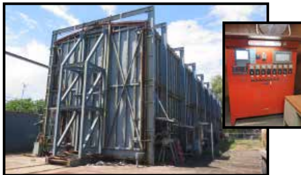
Cooperheat 8-Burner High Pressure (45 PSI) Natural Gas Fired Furnace 23'W x 24'H x 123'D w/Cooperheat Controls, 120' Rail-Car Deck