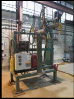
60" H x 18" Linear Welding Manipulator w/ Lincoln Flextec 650 Welding Source and NA-3N