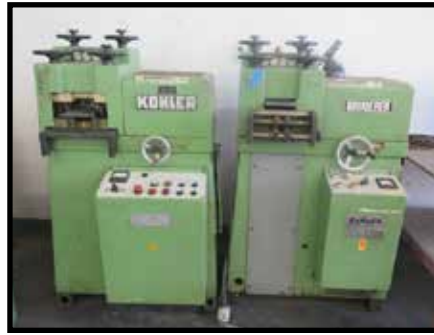
Bruederer and Kohler Straightener / Feeders