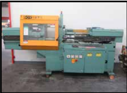
1993 Boy mdl. 50T2 50 Ton Injection Molding Machine