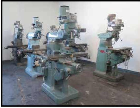
Vertical Mills ***7-AVAILABLE***