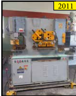
2011 US Industrial USI66TDO 66 Ton Ironworker