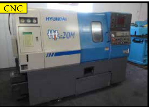
Hyundai HiT-20M CNC Live Turret Turning Center w/ Siemens Controls