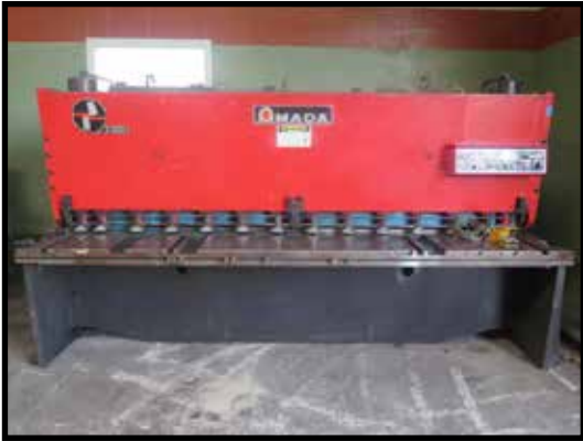
Amada H-3065 10' Hydraulic Power Shear