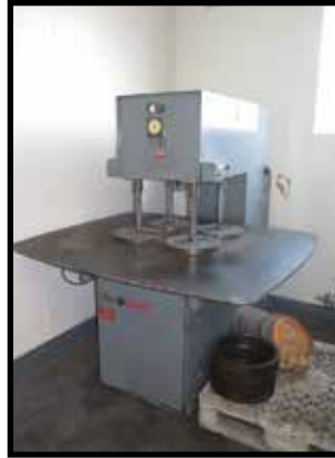
Speed-Fam 32" Lapping Machine