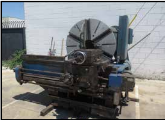
Lodge & Shipley T60" Right Angle Lathe w/ 11 1/2" Thru Spindle Bore