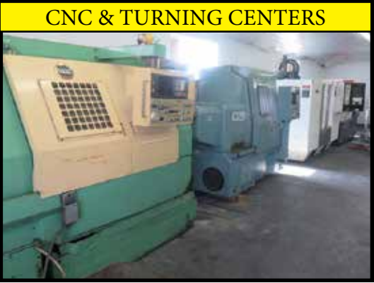
CNC Machining and Turning Centers