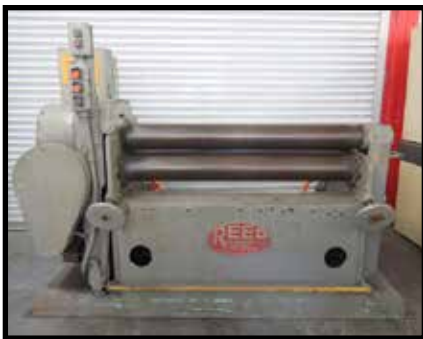
Reed 48" Power Roll