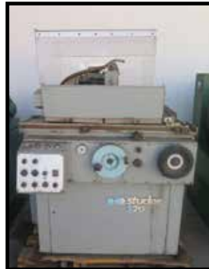
Studer S20-12 6" x 12" Cylindrical Grinder