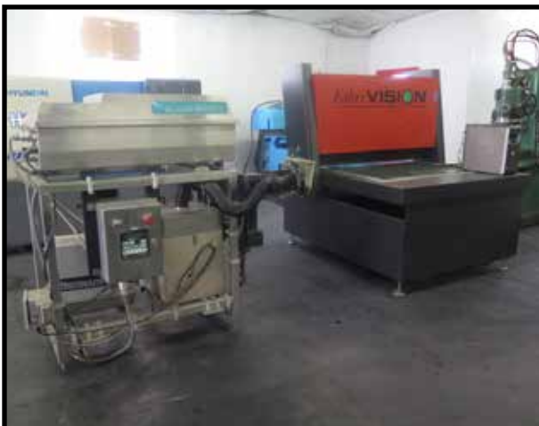
Lasertechnics "Blazer 6000" Laser Engraver and Fabrivation 48" x 48" Digitizing Scanner