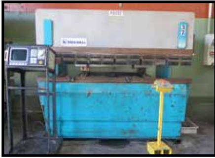
Megobal PB63T 63 Ton x 98" CNC Press Brake