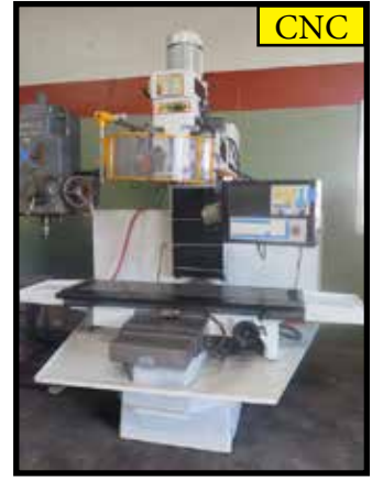
Atrump B6FC 3-Axis CNC Vertical Mill