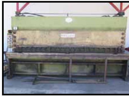
Heller HS-40-10 14' Power Shear