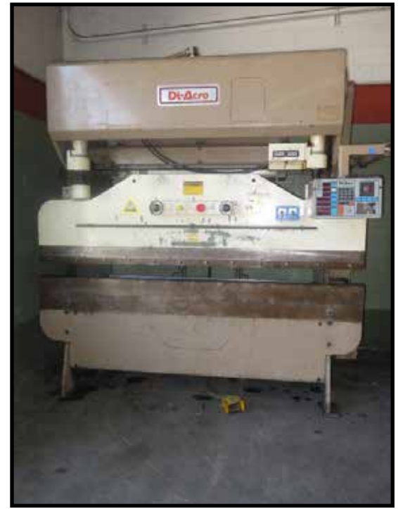
DiAcro 55-8 55 Ton x 8' CNC Hydra-Power Press Brake