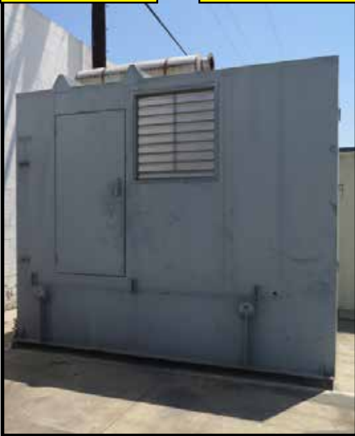
2000 Power Generation "Spectrum 350 DSE" Diesel Generator