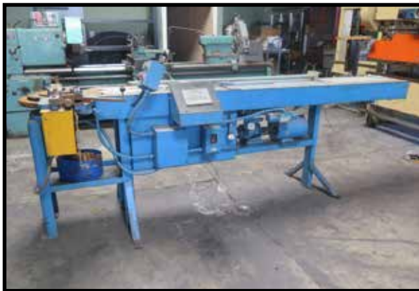
Hydraulic Tube Bender w/ PLC Controls