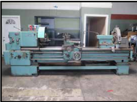
TOS Type SN71B 28" x 90" Gear-Gap Lathe