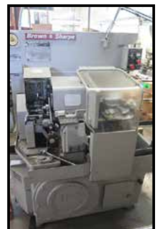
Brown & Sharpe 00 1/2" Cap Auto Screw Machine