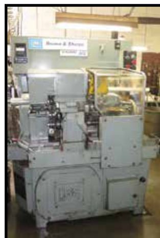
Brown & Sharpe Ultra- matic R/S 3/4" Cap Auto Screw Machine