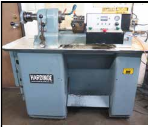
Hardinge / Bradmatic Auto Second OP Lathe