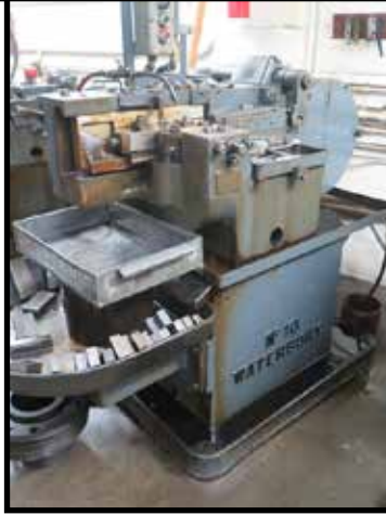
Waterbury Farrel No. 10 Flat Die Thread Roller