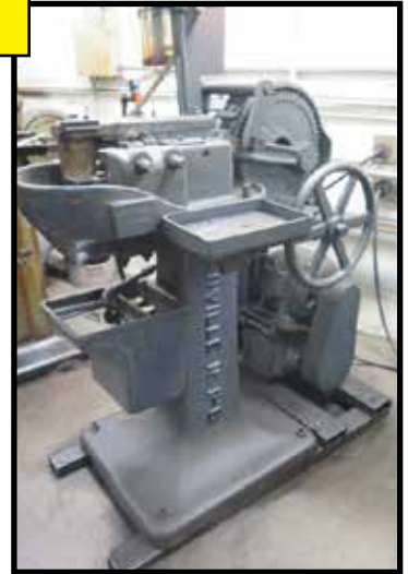
Waterbury Farrel No. 1-B Flat Die Thread Roller