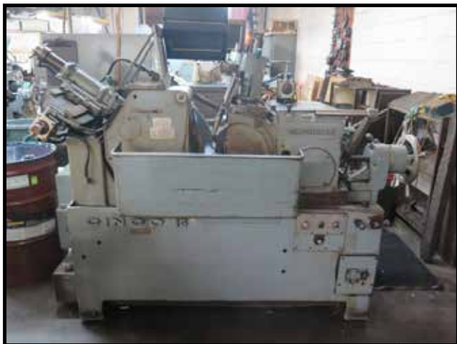
Cincinnati Milacron "CINCO-15" Centerless Grinder w/ 21" Grinding Wheel, Variable Speed