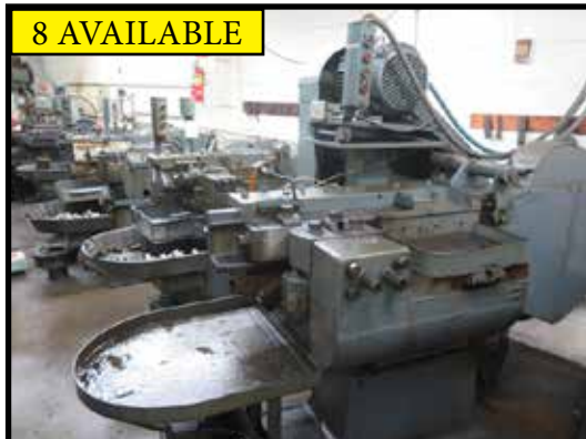
Thread Rolling Machines **8-AVAILABLE**