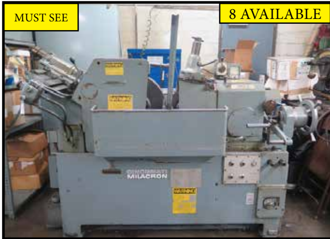
Cincinnati Milacron "CINCO-15" mdl. DR Centerless Grinder w/ 24" Grinding Wheel, Dial Regulatory Feed Wheel RPM