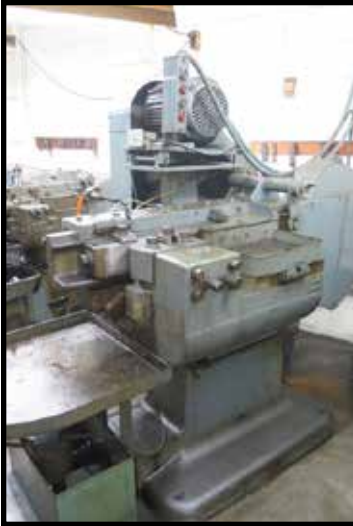
Waterbury Farrel No. 30 Flat Die Thread Roller