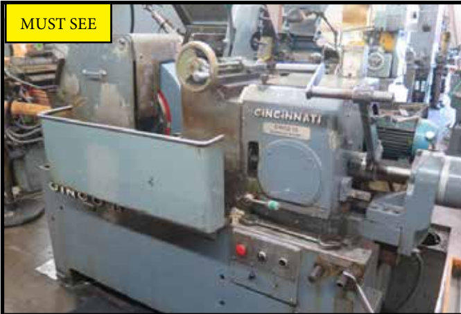
Cincinnati Milacron "CINCO-15" mdl. DR Centerless Grinder w/ 24" Grinding Wheel