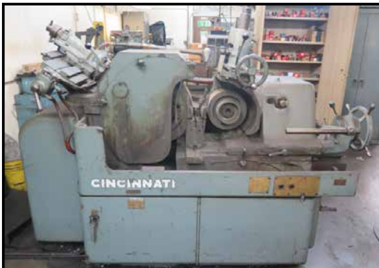
Cincinnati mdl. OM Centerless Grinder Centerless Grinder w/ 24" Grinding Wheel