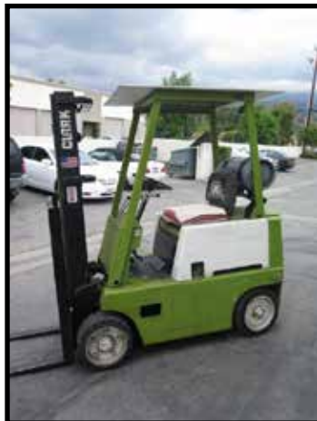
Clark 4000 Lb Cap LPG Forklift