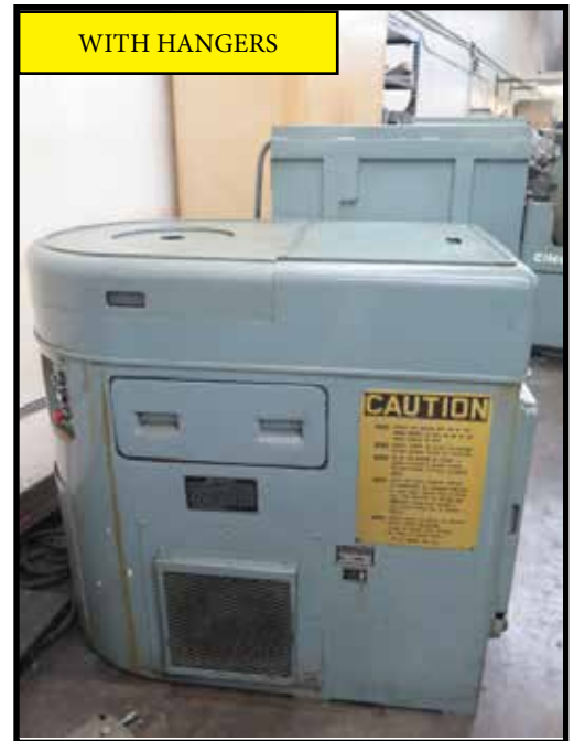
Reed / Litton No. A22B 3-Die Cylindrical Thread Rolling Machine