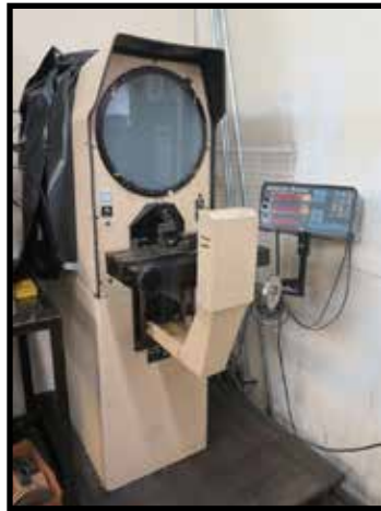
MicroVu H-14 14" Optical Comparator w/ Q16 Programmable DRO