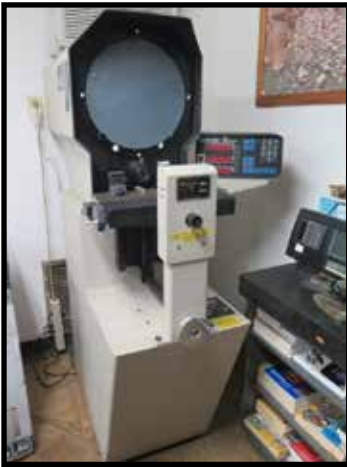
MicroVu H-14 14" Optical Comparator w/ Q16 Programmable DRO