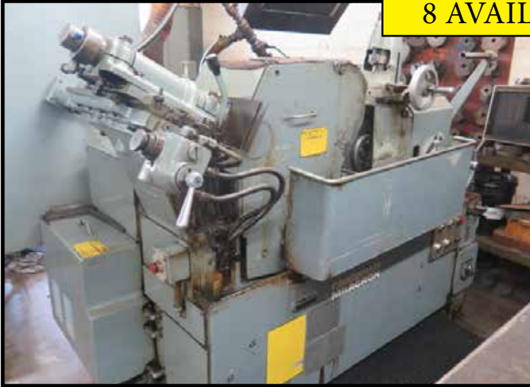
Cincinnati Milacron "CINCO-15" mdl. DR Centerless Grinder w/ 24" Grinding Wheel