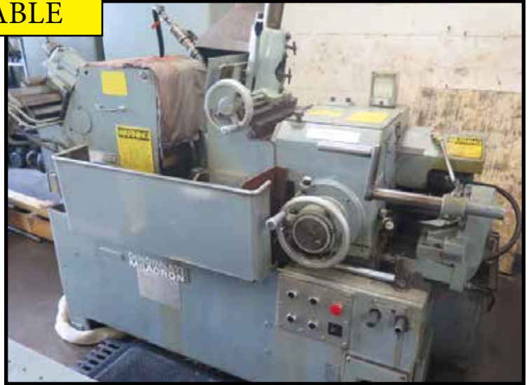
Cincinnati Milacron "CINCO-15" mdl. DR Centerless Grinder w/ 24" Grinding Wheel