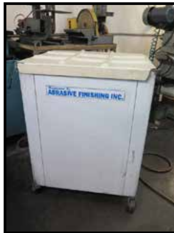
Abrasive Finishing "Super Quiet Burr Bench"