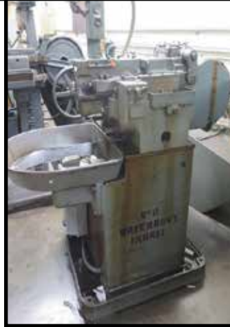
Waterbury Farrel No. 0 Flat Die Thread Roller