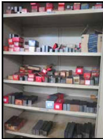
Large Quantity of Thread Dies