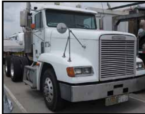
Freightliner Semi Tractor w/ Diesel Engine, Eaton-Fuller 9-Speed Trans