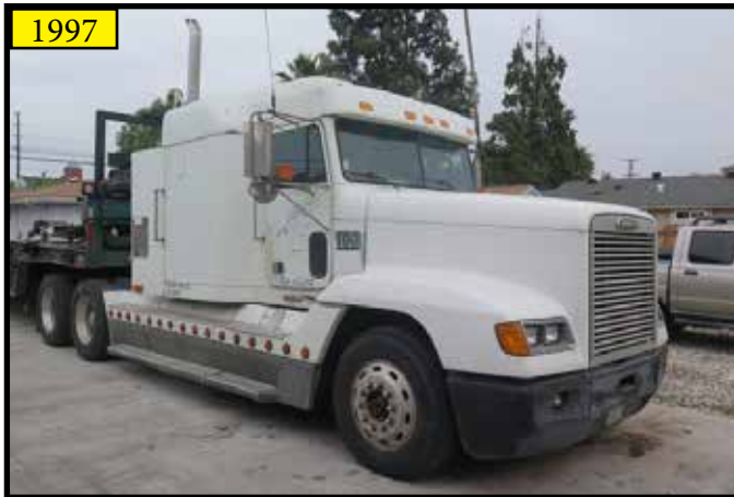
1997 Freightliner Semi Tractor w/ Diesel Engine, Rockwell 10-Speed Trans