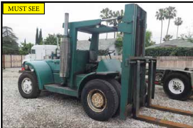
Hyster H300A 30,000 Lb Cap Diesel Forklift