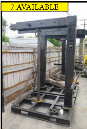
Forklift Expandable Boom Assemblies **7-AVAILABLE**