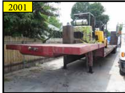
2001 Wabash 50' Step Deck Trailer