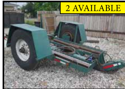
Premier No. 20 8000 Lb Cap Forklift Trailer **2-AVAILABLE**