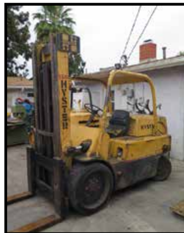
Clarklift mdl. 0500Y-300 17,600 Lb Cap Diesel Forklift