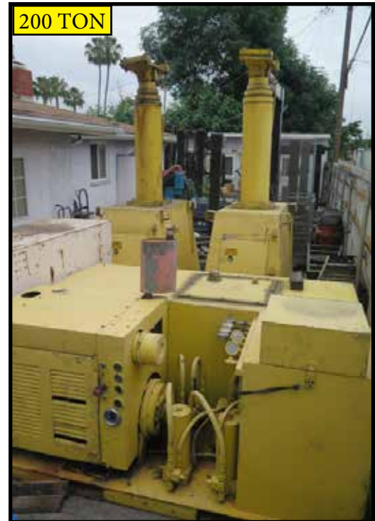
200 Ton Cap Lift System 2-Point Hydraulic Gantry