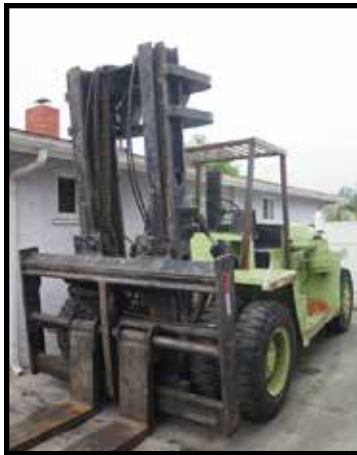
Clarklift mdl. 0500Y-300 17,600 Lb Cap Diesel Forklift