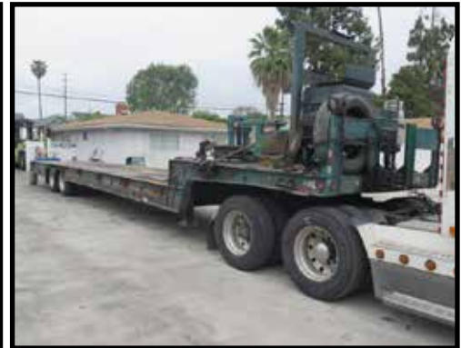
Trail king mdl. TK70HT-462 Lowboy Equipment Trailer