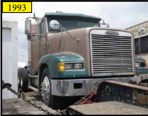
1993 Freightliner Semi Tractor w/ Diesel