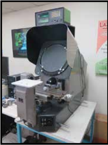
Mitutoyo PH-350A 13" Optical Comparator