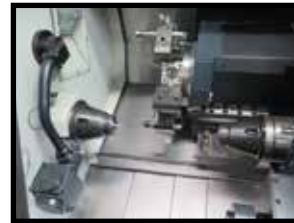
2014 Doosan LYNX 220 LMSA Twin Spindle Live Turret CNC Turning Center w/ Doosan Fanuc i-Series Controls, Tool Presetter, 12/24 Station Live Turret, 12-Live Stations, 6000 RPM Main, Sub and Rotary Spindles, "C" Axis Rotation @ 0.001 Degrees