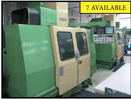
Mori Seiki MV-40 CNC Vertical Machining Centers **7-AVAILABLE**