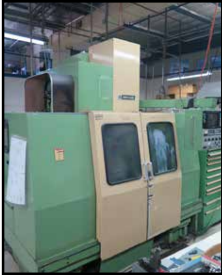
1991 Mori Seiki MV-40 CNC Vertical Machining Center w/ Yasnac Controls, 20-ATC, BT-40 Spindle