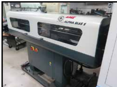
LNS Alpha SL65S Automatic Bar Loader / Feeder