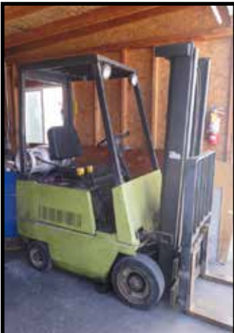
Clark GCX15E 3000 Lb Cap LPG Forklift