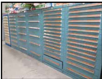
Vidmar and Lista Tooling Cabinets