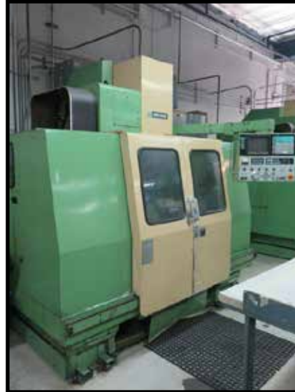
1991 Mori Seiki MV-40 CNC Vertical Machining Center w/ Yasnac Controls, 20-ATC, BT-40 Spindle, 8000 RPM