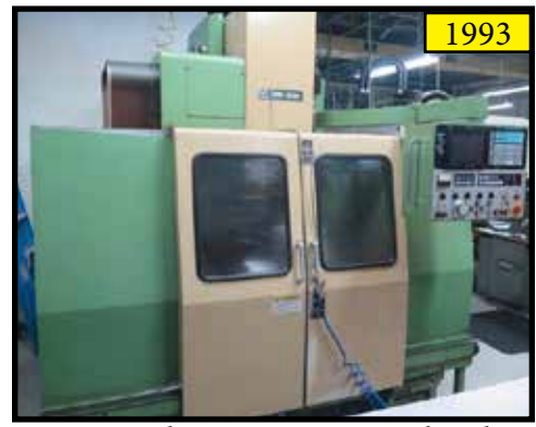
1993 Mori Seiki MV-40B CNC Vertical Machining Center w/ Yasnac Controls, 20-ATC, BT-40 Spindle, 8000 RPM