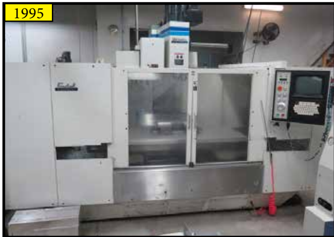
1995 Fadal VMC6030HT CNC Vertical Machining Center w/ CNC88HS Controls, 21-ATC, BT-40 Spindle, 7500 RPM, Rigid Tapping