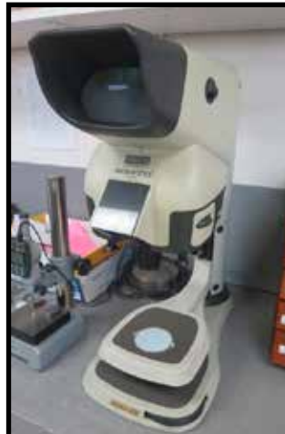
Vision Mantis FX Viewing Scope