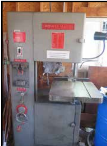
Powermatic 20" Vertical Band Saw