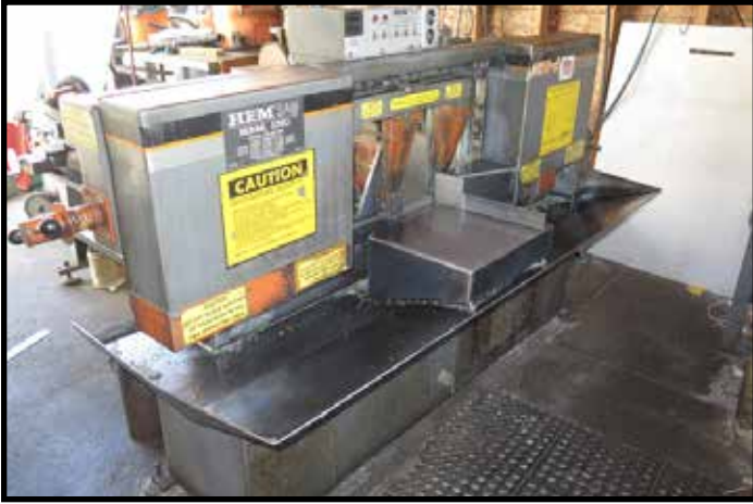
HEM Saw H90-A- B/F 12" Auto Horizontal Band Saw