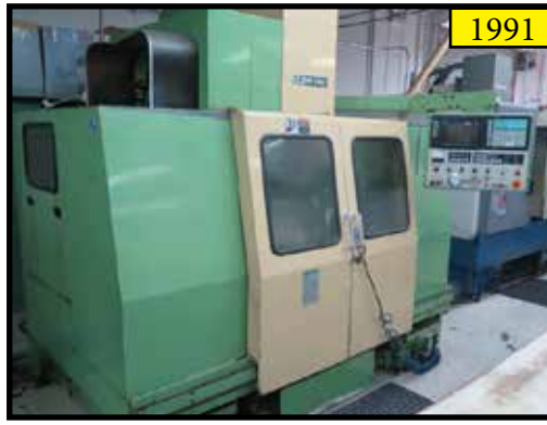
1991 Mori Seiki MV-40 CNC Vertical Machining Center w/ Yasnac Controls, 20-ATC, BT-40, 8000 RPM