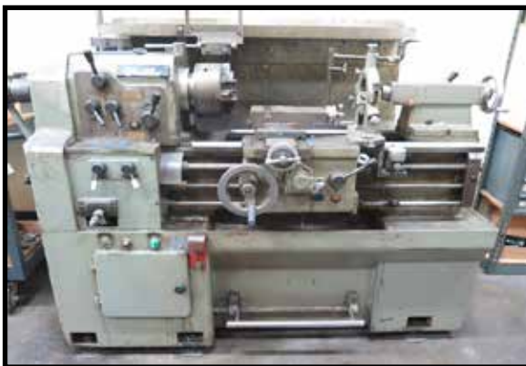
Cadillac 1422 14" x 22" Geared Head Gap Bed Lathe