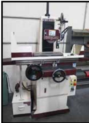
Falcon Chevalier FSG-618M Surface Grinder