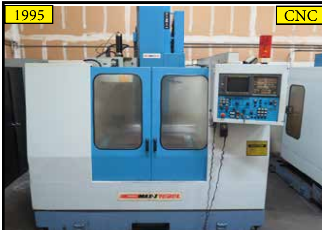
1995 Supermax MAX-3 REBEL CNC Vertical Machining Center w/ Fanuc 0-M Controls