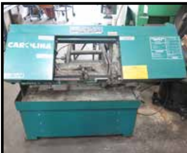
Carolina HV20 7" Horizontal Band Saw