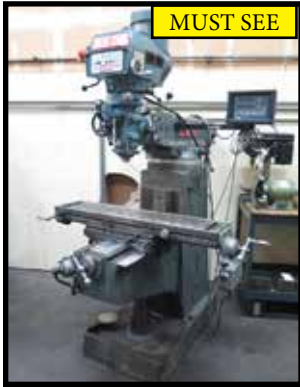
Lagun / KBC FTV-1 Vertical Mill w/ Newall Sapphire DRO