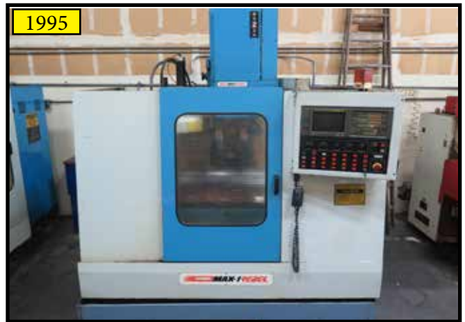
1995 Supermax MAX-1 REBEL CNC Vertical Machining Center w/ Fanuc 0-M Controls