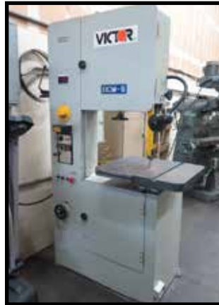
Victor DCM-5TS 20" Vertical Band Saw