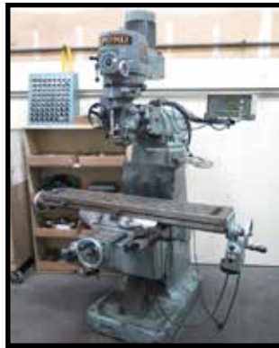
Supermax Vertical Mill w/ Mitutoyo DRO