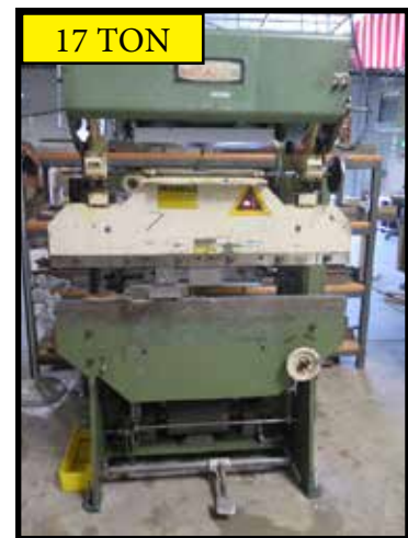
DiAcro 14-48-2 17 Ton x 48" Hydra Power Press Brake