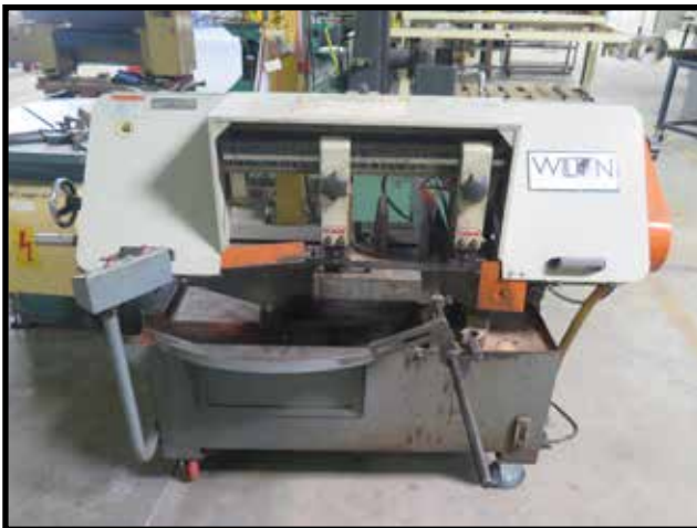
Wilton 7020M 11" Horizontal Mite Band Saw