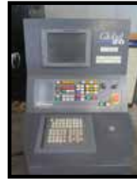
Fanuc 18i-P Controls