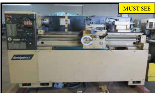
Bridgeport /Romi 13-5 13" x 45" Geared Head Lathe