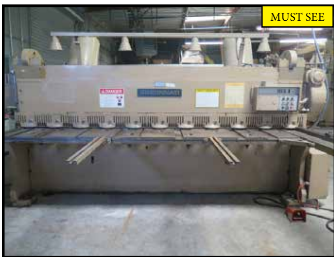
Cincinnati 1810G 1/4" x 10' Power Shear w/ Cincinnati Controls