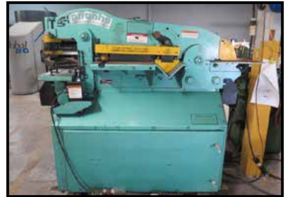
Piranha P50 50 Ton Iron Worker