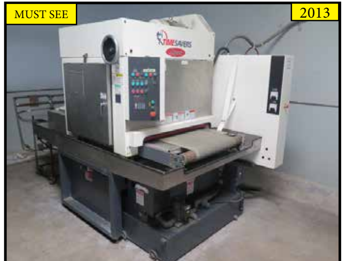
2013 Timesavers LYNX37MWT-DB- 60 Dual Head (Belt and Brush) Wet Belt Grainer