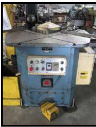
Amada CS-220 8 5/8" x 8 5/8" Power Notcher