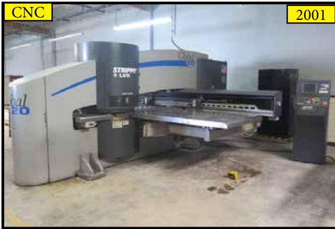
2001 Strippit LVD "Global 20 2.5M" 22 Ton CNC Turret Punch Press w/ Fanuc Series 18i-P Controls, 30-Station Thin Turret, (3) Auto Index Stations