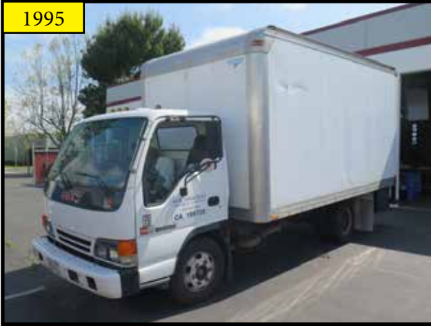
1995 GMC W4/GAS 12' Box Truck w/ V8 EFI Gas Engine