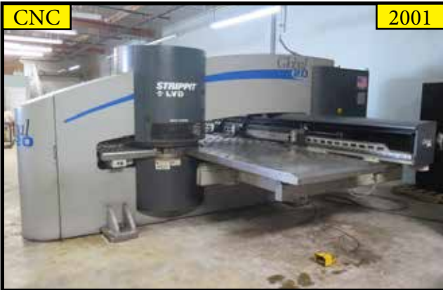
2001 Strippit LVD "Global 20 2.5M" 22 Ton CNC Turret Punch Press w/ Fancu Series 18i-P Controls, 30-Station Thin Turret, (3) Auto Index Stations