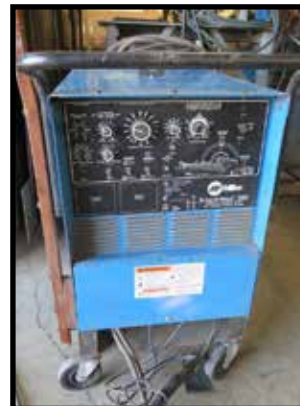
Miller Syncrowave 250 CC-AC/DC Arc Welder