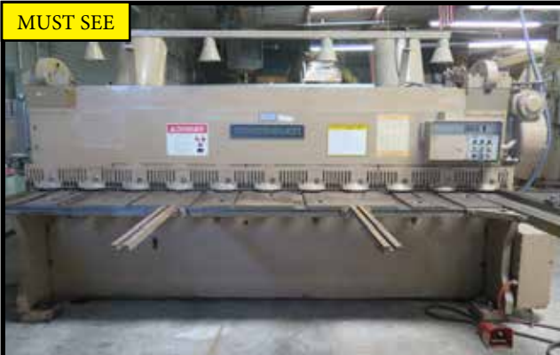
Cincinnati 1810G 1/4" x 10' Power Shear w/ Cincinnati Controls