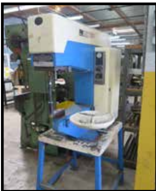
PemSertter Series 4 6-Ton x 18" Hard- ware Insertion Press