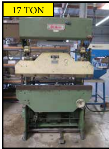
DiAcro 14-48-2 17 Ton x 48" Hydra Power Press Brake