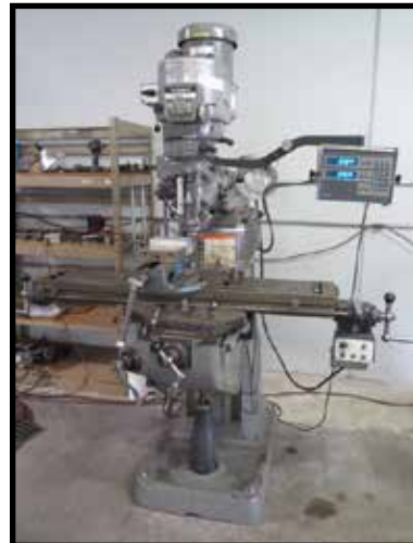
Bridgeport Vertical Mill w/ Acu-Rite Millmate DRO