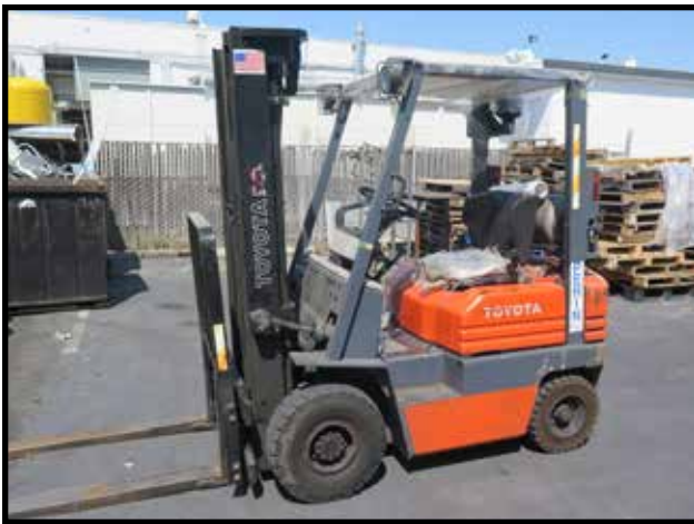
Toyota 42-5FG15 2600 Lb Cap LPG Forklift