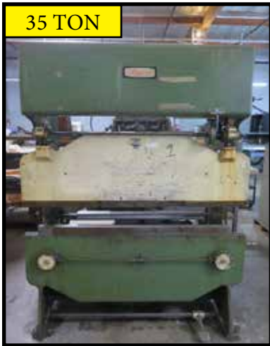
DiAcro 35 Ton x 6' Press Brake