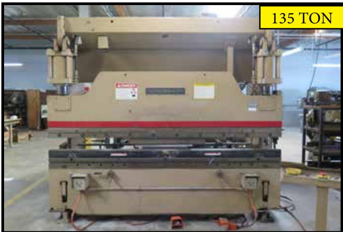
Cincinnati 135CBx8 135 Ton x 8' Hydraulic Press Brake