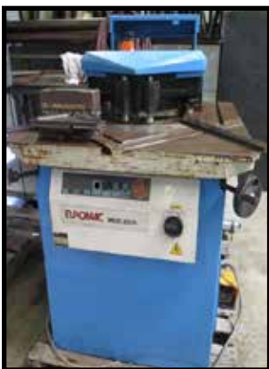
Euromac "Multi 220/6M" 9" x 9" Power Notcher