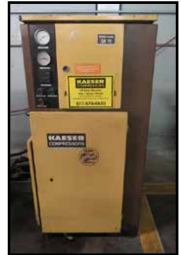
Kaeser SK-11 10Hp Rotary Air Compressor