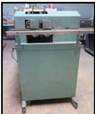
Falls Products "D-Bur- R" Edge Deburring Machine