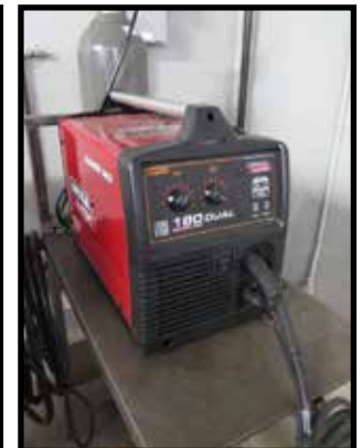
Lincoln 180 Dual Power-MIG CC-AC/DC Arc Welder