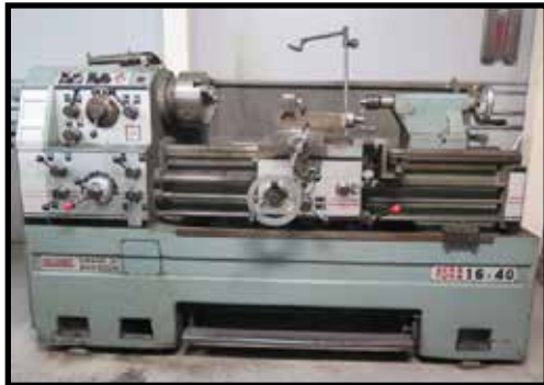
Namseon Acra Turn 16" x 40" Gear-Gap Lathe