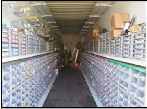
Large Quantity of Hardware (Ace Hardware Buyout) Nuts, Bolts, Screws w/ Store Display Shelving