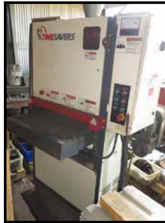
Timesavers mdl. 1211-12- 0 24" Belt Grainer