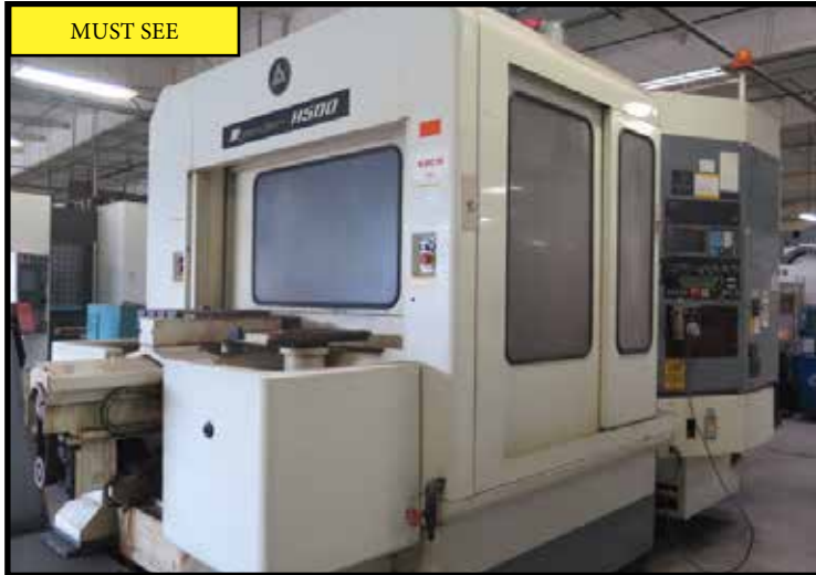
Kitamura MyCenter H-500 2-Pallet 4-Axis CNC Horizontal Machining Center w/ Fanuc 15-M Controls, 120-Station ATC, CAT-50 Spindle