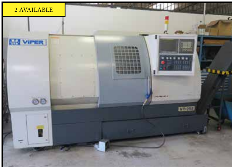
DEC/2010 Viper VT-25BCNC Turning Center w/ Fanuc Oi-TD Controls ***2-AVAILABLE***

(3) CHC Enhancements AutoBar-400 Automatic Bar Loader / Feeders.