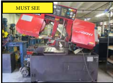
Amada HA-400W 16" Auto Hydraulic Horizontal Band Saw