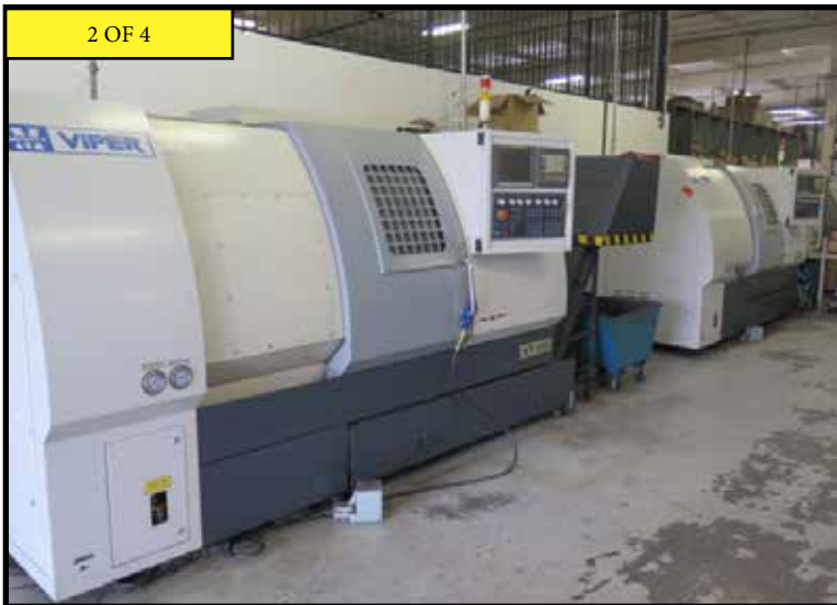
2011 Viper VT-25BCNC Turning Centers w/ Fanuc Oi-TD Controls