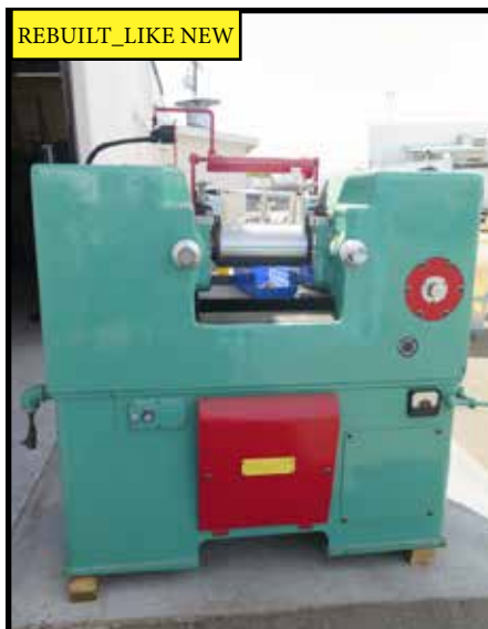
Farrel Rubber Mill ***Rebuilt***