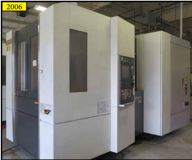
2006 Mori Seiki NH5000/40DCG 2-Pallet 4-Axis CNC Horizontal Machining Center w/ Mori Seiki