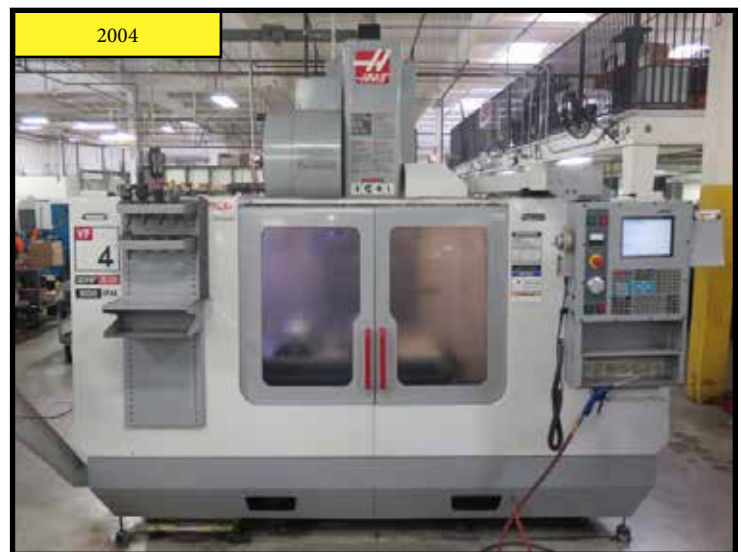
2004 Haas VF-4D 4-Axis CNC Vertical Machining Center w/ Haas Controls, 24-Station ATC, CAT-40 Spindle, 7500 RPM