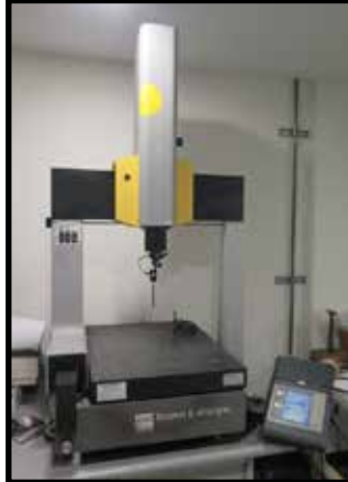
Brown & Sharpe "Gage 2000" CMM Machine w/ Digital Controls