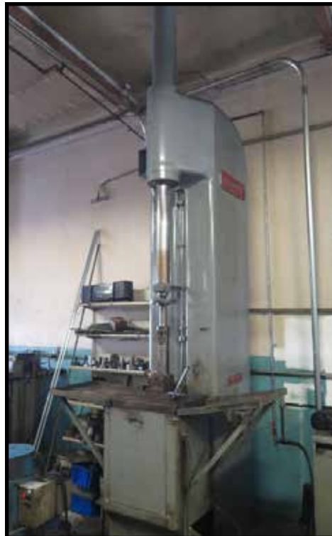
Colonial Broach VBS-10- 42 42" Hydraulic Broaching Machine