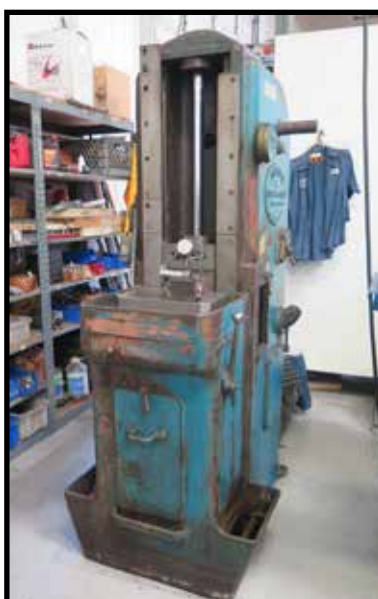
American Broach T-4- 24 24" Hydraulic Broaching Machine