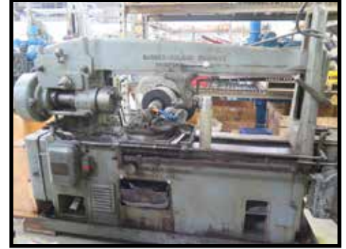
Barber Colman 16-36 16" x 36" Gear Hobber