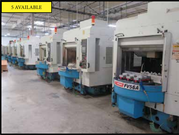
Supermax FV56A 2-Pallet CNC Vertical Machining Centers w/ Fanuc 18-M Controls ***5-AVAILABLE***