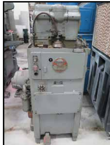
Fellows Type 3PF Fine Pitch Gear Shaper