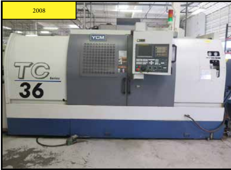
2008 YCM TC-36 CNC Turning Center s/n 0060 w/ Yeong Chin Fanuc TXP-200e Controls, 12-Station Turret,