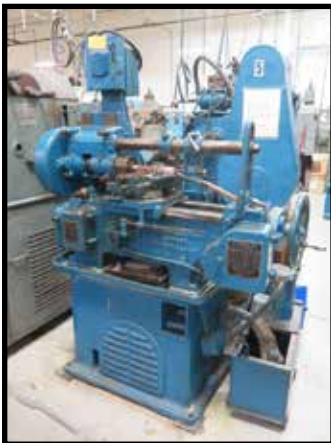
Barber Colman No. 3 Gear Hobber