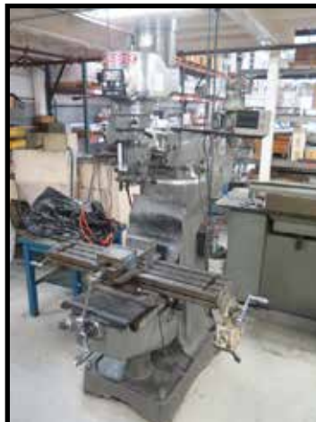
Webb Vertical Mill w/ Mitutoyo DRO

(6) 40' and 20' Storage Containers. Scissor Platform Lift. Clark and Windsor Industrial Floor Scrubbers. Instapak 2-Part Foam-Fill Machine. ParaBody Weight Machine. Realryder, Tsunami Stationary Bikes. AbCoaster PS5000 Abdominal Machine. True Kinetics Upper Cycle. LeMond a-force- RT Recumbent Bike. Tectrix Personal Climber Machine.