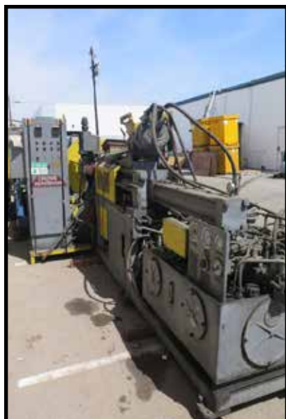
Crowe Performer ACFP 14/25 Rubber Extruding Machine