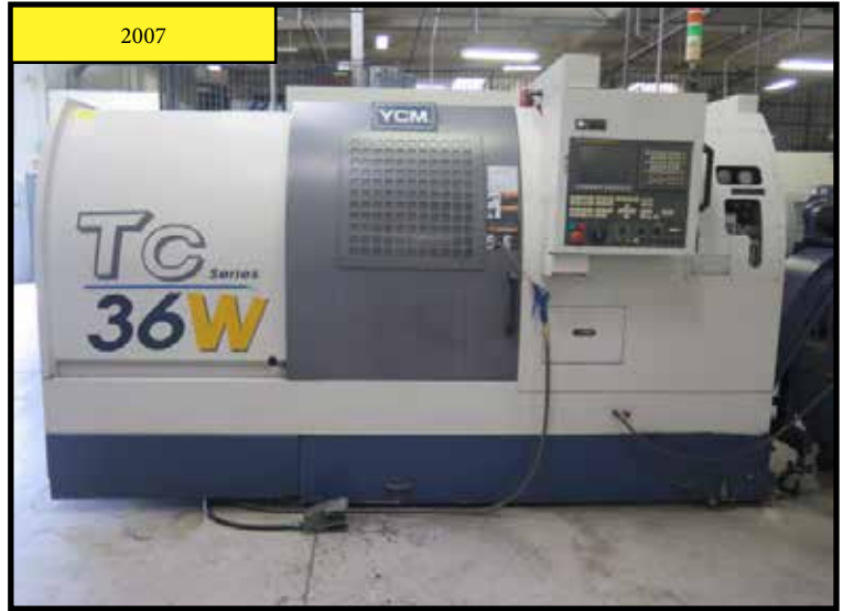
OCT/2007 YCM TC-36W CNC Turning Center w/ Yeong Chin Fanuc TXP-200e Controls