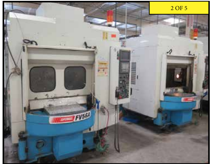
Supermax FV56A 2-Pallet CNC Vertical Machining Centers w/ Fanuc 18-M Controls ***2 of 5***