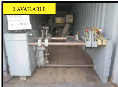
Heins 80 23 6 Precision Balancing Machine