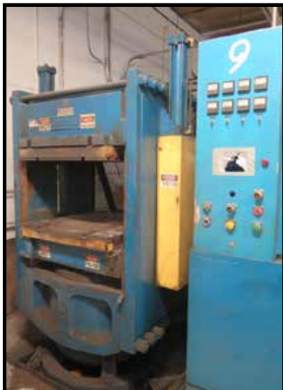
2000 Goshen Rubber Central Engr. 663T PRESS Hydraulic Rubber Compression Molding Machine