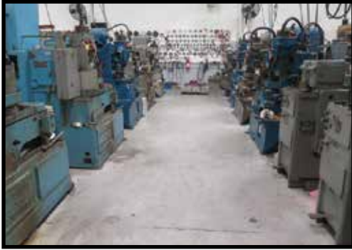
Gear Cutting Department