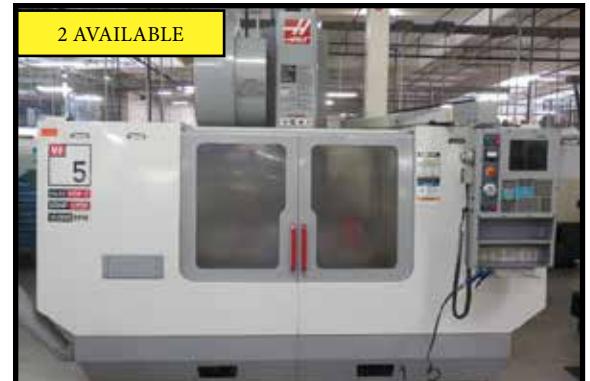
2004 Haas VF-5B/40 4-Axis CNC Vertical Machining Center w/ Haas Controls, 40-Station Side Mount ATC, CAT-40 Spindle, 10,000 RPM ***2-AVAILABLE***