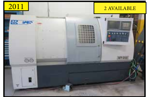
DEC/2011 Viper VT-25BCNC Turning Center w/ Fanuc 0i-TD Controls ***2-AVAILABLE