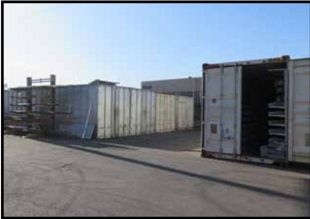
40' and 20' Storage Containers ..6 AVAILABLE