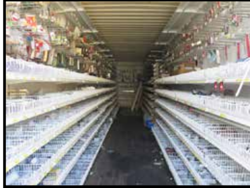
Large Quantity Electrical Fixtures and Conduit, PVC, Copper and Brass Plumbing w/ Store Display Shelving