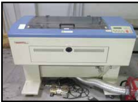
LaserPro Mercury L-30 30Watt Laser Engraver w/ Digital Controls