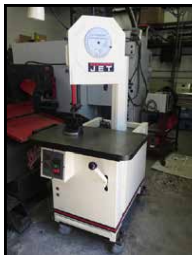
Jet VSF-14-1 14" Band Saw