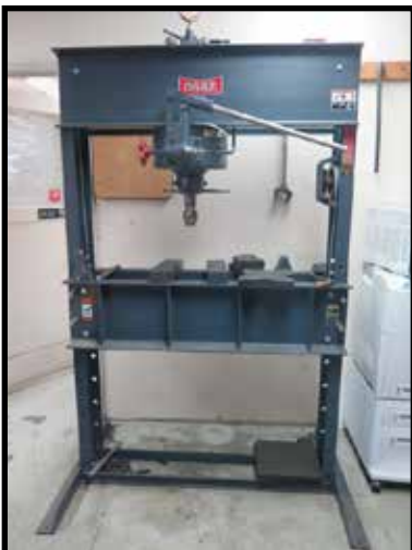
Dake 75-H 75 Ton Sliding Ram Hydraulic H-Frame Press