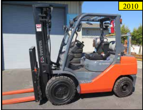
2010 (Refurbished in 2016) Toyota 8FGU30 5620 Lb Cap LPG Forklift