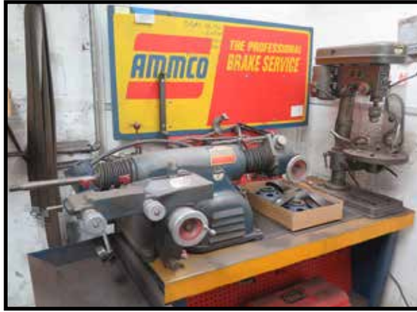
Ammco mdl. 4000 "Safe-Turn" Brake Lathe