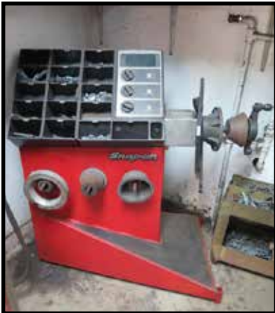
Ammco mdl. 4000 "Safe-Turn" Brake Lathe