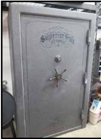
Superior Safe "Untouchable 55" Gun Safe