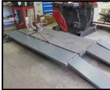
K & L MC650R Hydraulic Motorcycle Lift