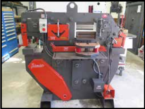
LIKE NEW Edwards 65TON 65 Ton Hydraulic Iron Worker