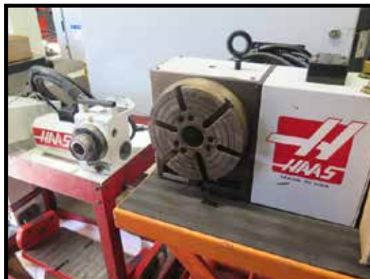
Haas HRT-210 8 1/4" Brushless and HA5C 5C Brushed Rotary Heads w/ Controllers