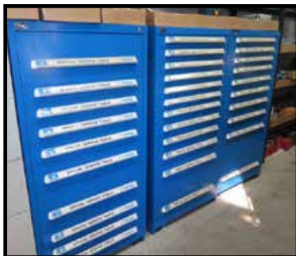
Vidmar Tooling Cabinets