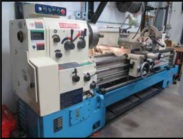
2003 Birmingham 24-80 24" x 80" Gear-Gap Lathe