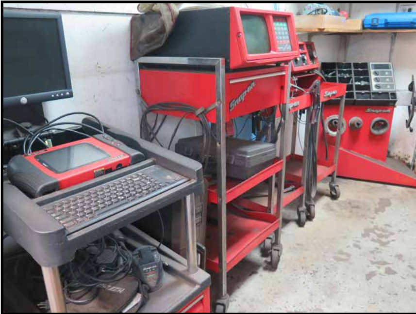
Snap-On Automotive Analyzers