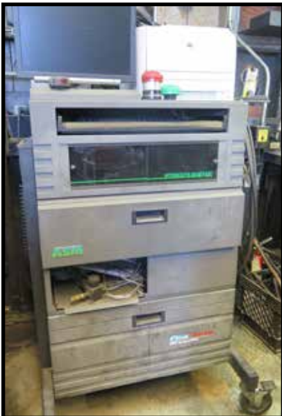
SPA Corp. S54311B ASM Emission Analyzer