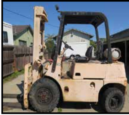
Toyota 02FG32 6000 Lb Cap LPG Forklift