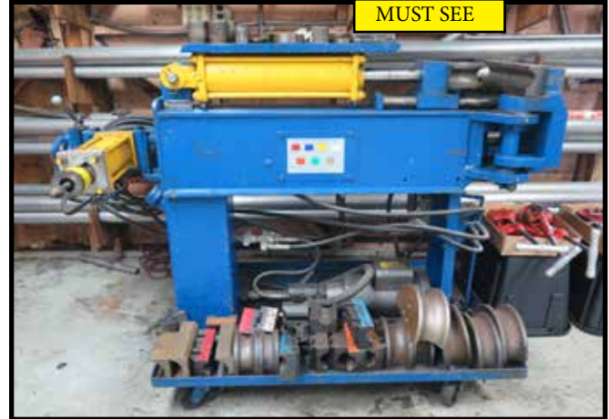
Ben Pearson Tube Master Co. "Muffler Shop" EXP69 Hydraulic Tube Bender and Flanger