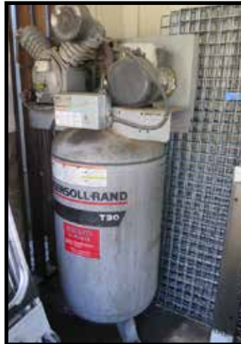
Ingersoll Rand 5Hp Air Compressor