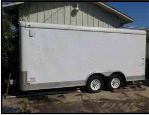
2006 Interstate 102" x 16' Tandem Axle Trailer