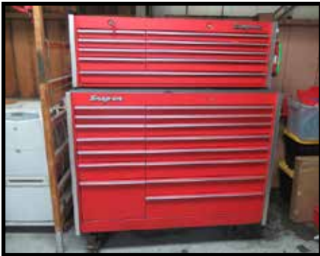
Snap-On 24-Drawer Roll-A-Way w/ Tools