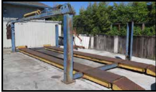
Ben Pearson LMT22 22,000 Lb Hydraulic Car Lift