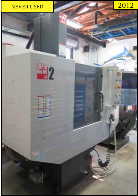
2012 Haas Super Mini Mill 2 4-Axis CNC Vertical Mill (NEVER RUN) w/ Haas Controls, 10-Station ATC, CAT-40 Spindle, 10,000 RPM, Fully Loaded