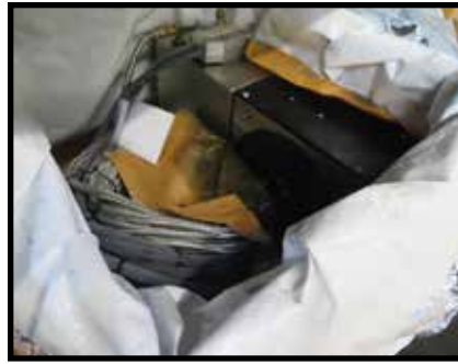
2015 Haas HRT210-2010 8 1/4" 4th Axis Rotary Head (NEW IN CRATE)

TAKE THE 91-FWY EAST TO THE 57-FWY SOUTH. EXIT ON ORANGEWOOD AVE AND TURN LEFT. TURN LEFT ON N ECKHOFF ST. TURN RIGHT ON W COLLINS AVE, THEN RIGHT ONTO BUSINESS CENTER DR. LOOK FOR "AUCTION TODAY" SIGNS.