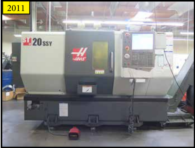
2011 Haas ST-20SSY Live Turret CNC Turning Center w/ Haas Controls 22-Station Live Turret, 5000Spindle RPM, 3000 Tooling RPM, 2" Thru Spindle