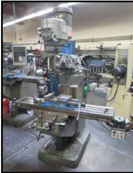
Bridgeport Vertical Mill w/ Sony C80 Programmable DRO ***2-AVAILABLE***

11/2015 Haas VF-4SS 5-Axis CNC Vertical Machining Center w/ Haas Controls, 24-Station Side Mounted ATC, CAT-40 Taper Spindle, 12,000 RPM, Yaskawa Spindle Motor, Haas Vector Drive, Renishaw OTC Wireless Intuitive Probing System and Wear Systems, RTAP-3 Rigid Tapping, P-COOL 34-Position Programmable Coolant Nozzle, Quick Code, Advanced Tool Management