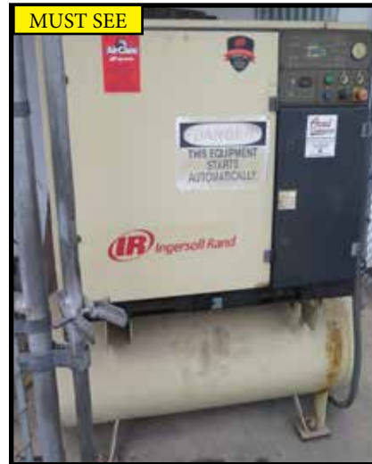
Ingersoll Rand SSR-UP6- 25-150 25Hp Rotary Air Compressor