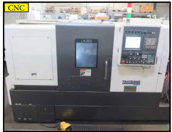
Takisawa LA-250 CNC Turning Center w/ Takisawa TURN-1 Fanuc Controls