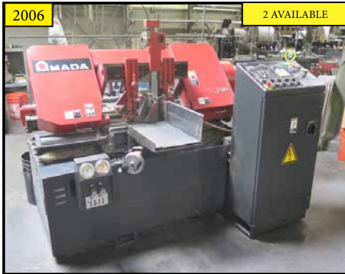
2006 Amada HA-250W 10" Auto Hydraulic Horizontal Band Saw ***2-AVAILABLE***