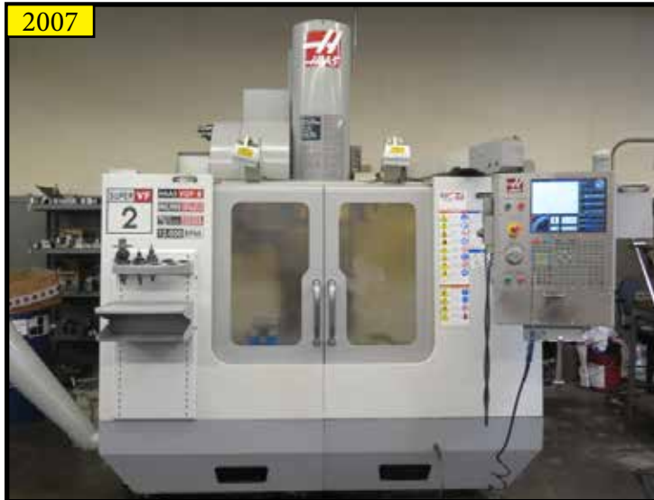
2007 Haas Super VF-2SS 4-Axis CNC Vertical Machining Center w/ Haas Controls, 24-Station Side Mounted ATC, CAT-40 Taper Spindle, 12,000 RPM, Inline Direct Drive Spindle, Haas Baldor Spindle Motor, High Speed Machining, High Speed Tool Changer, Haas VOP-B, 16mb Expanded Memory, Coordinate Rotation and Scaling, Intuitive Programming System, Brushless "A"-Axis, Rigid Tapping