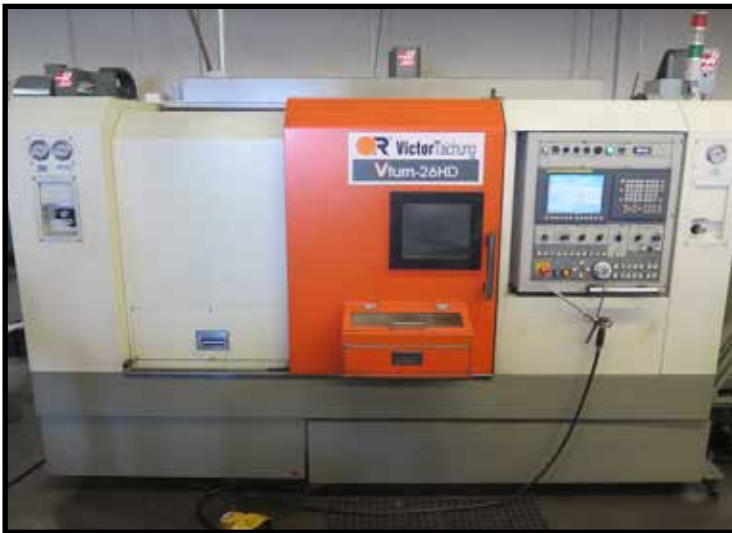
Victor Taichung VTurn-26HD CNC Turning Center w/ Fanuc 0i-TD Controls