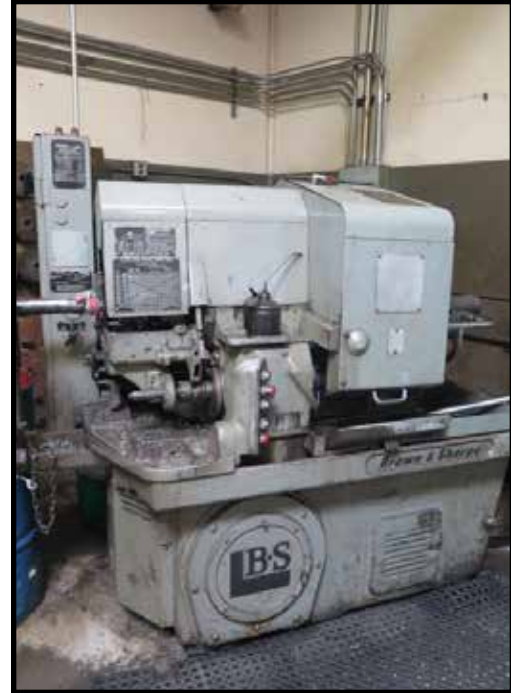
Brown & Sharpe No. 2 1" Cap Auto Screw Machine