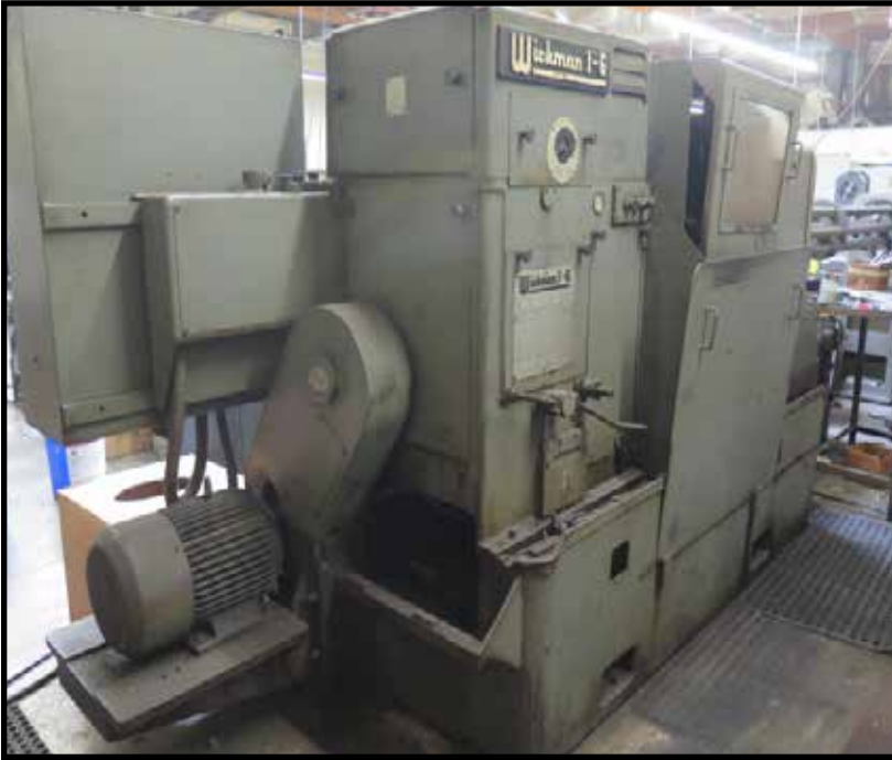
Wickman 1"-6 1" Cap 6-Turret Automatic Screw Machine