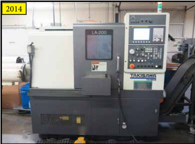
2014 Takisawa LA-200 CNC Turning Center w/ Fanuc 0i Mate-TD Controls