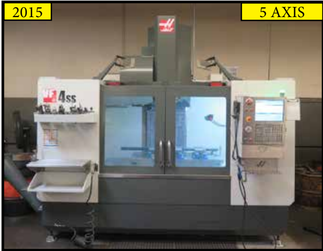
11/2015 Haas VF-4SS 5-Axis CNC Vertical Machining Center w/ Haas Controls, 24-Station Side Mounted ATC, CAT-40 Taper Spindle, 12,000 RPM, Yaskawa Spindle Motor, Haas Vector Drive, Renishaw OTC Wireless Intuitive Probing System and Wear Systems, RTAP-3 Rigid Tapping, P-COOL 34-Position Programmable Coolant Nozzle, Quick Code, Advanced Tool Management