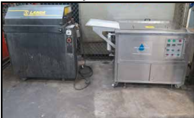
Ultrasonic Cleaning and Landa Parts Washers