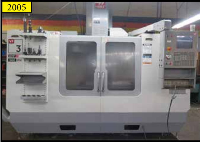
2005 Haas VF-3D CNC Vertical Machining Center w/ 20-Station ATC