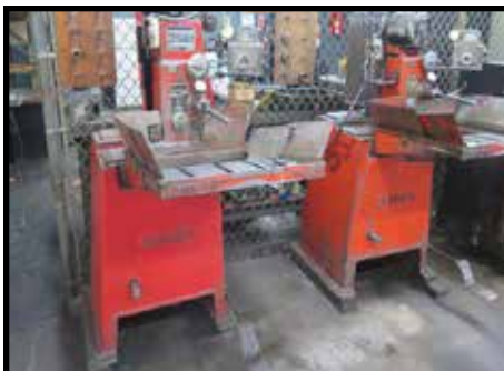
Sunnen LBB-1499 and LBB-1299 Honing Machines