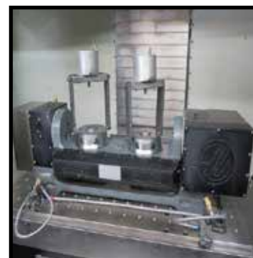
Haas TR-160- 2 2-Axis Dual 6 1/2" Trunion Rotary Table