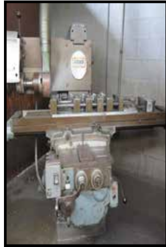
Kempsmith "Master-Mill" No.3 Plain Horizontal Mill