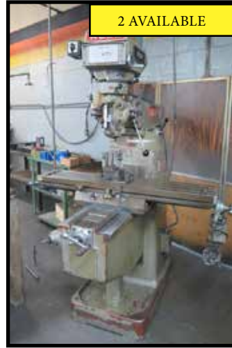
Webb "Champ" Vertical Mill ***2-AVAILABLE***