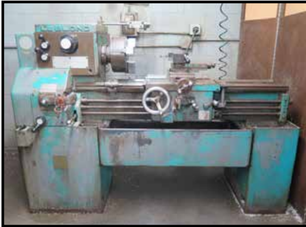
LeBlond Regal 16" x 36" Lathe