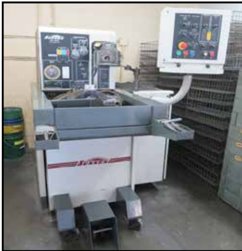
Sunnen ML-3500-D Automatic Precision Honing Machine w/ Sunnen Controls