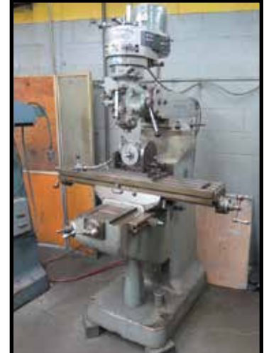
Bridgeport Vertical Mill