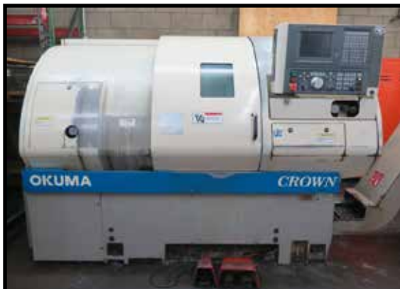
Okuma Crown 762S-SB CNC Turning Center w/ OSP700L Controls