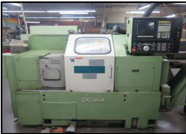
Okuma LB15 CNC Turning Center w/ OSP5020L Controls