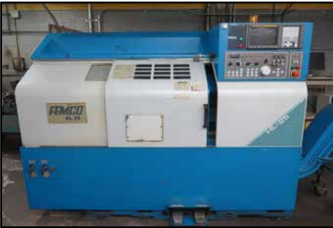
2004 Femco HL-25 CNC Turning Center w/ Fanuc 0i-TB Controls