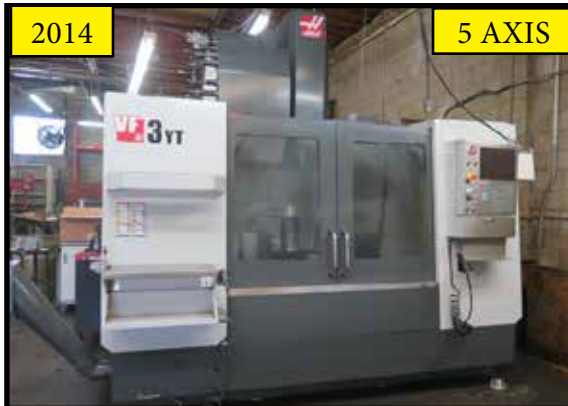
2014 Haas VF-3YT 5-Axis CNC Vertical Machining Center w/ 40-Station Side Mount ATC