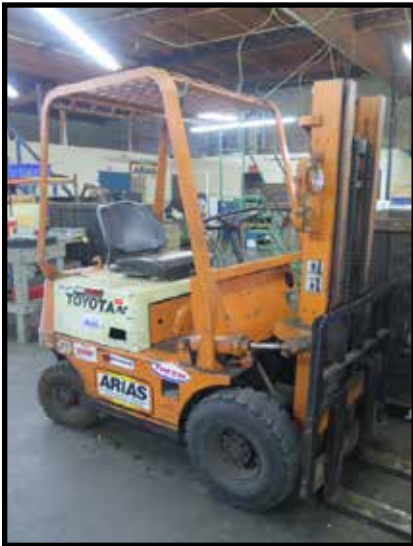
Toyota 2FG14 3000 Lb Cap Gas Powered Forklift