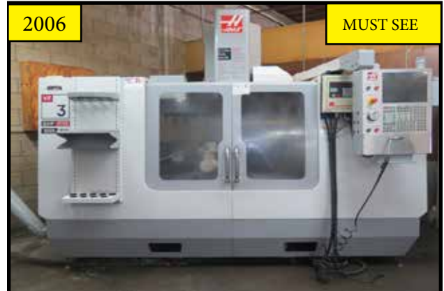
2006 Haas VF-3D 4-Axis CNC Vertical Machining Center w/ 20-Station ATC