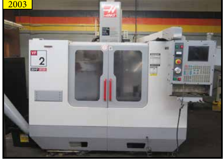
2003 Haas VF-2D CNC Vertical Machining Center w/ CAT-40 Spindle