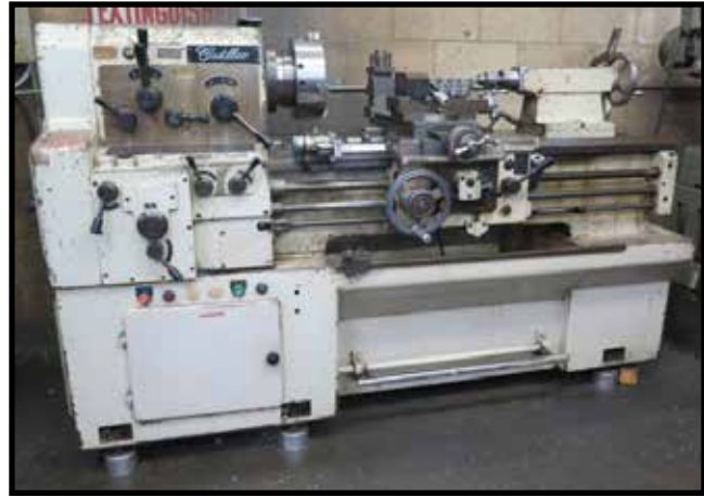
Cadillac 1733 17" x 33" Geared Head Gap Bed Lathe