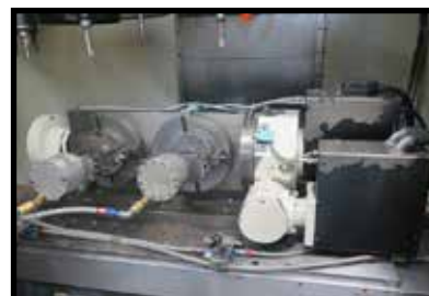
Troyke TDL-10- 2 2-Axis Dual 10" Trunion Rotary Table ***3-AVAILABLE**