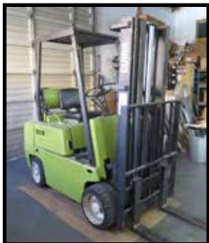
Clark C500-50 4450 Lb Cap LPG Forklift