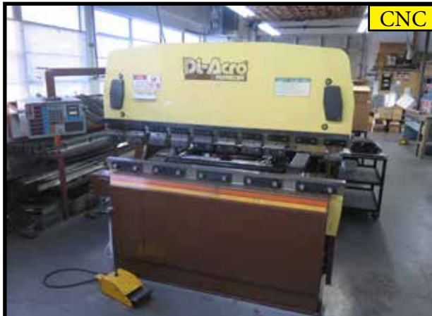
Promecam IT2-50- 20 50-Ton x 79' CNC Press Brake