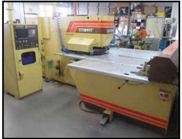
Strippit CAP1000 22-Ton CNC Turret Punch Press w/ Fanuc Control