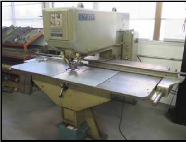
Strippit "Fabricator" Custom 30/30 30-Ton Fabrication Punch