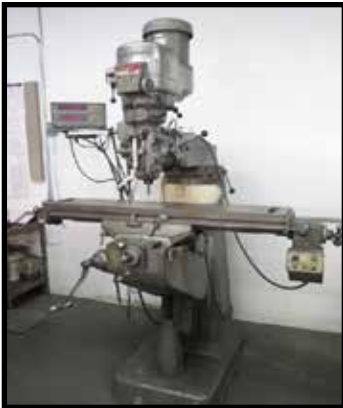
Bridgeport Series 1 - 2Hp Mill w/ Sony DRO