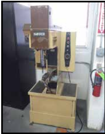
Haeger HP6-B 6-Ton x 18' Hardware Insertion Press