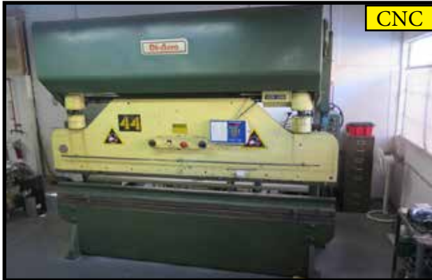
DiAcro 100-10 100-Ton x 10' CNC Press Brake