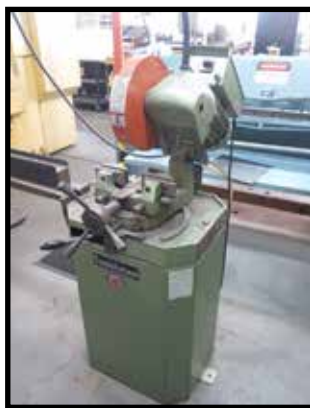
Scotchman/Bewo CPO-275LT Miter Cold Saw