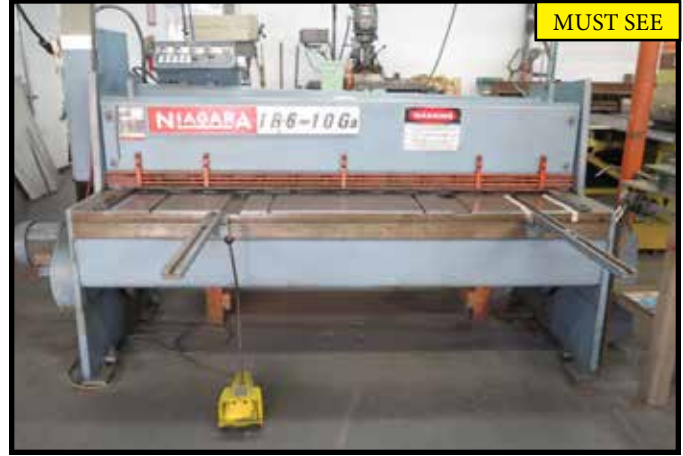
Niagara 1R6-10GA 10GA x 6' Power Squaring Shear