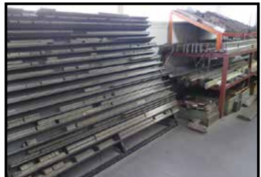
Press Brake Tooling