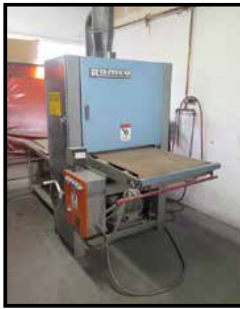
Ramco mdl. 25T-60 24" Belt Grainer