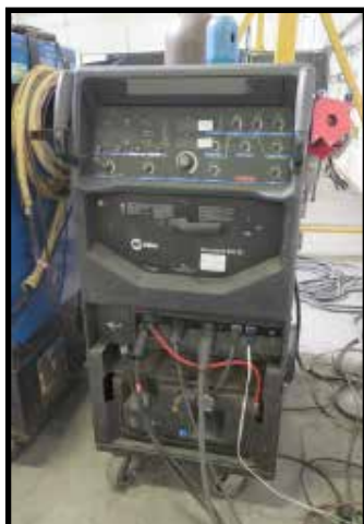
Miller Syncrowave 250DX Arc Welder