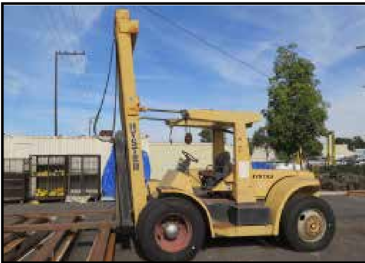
Hyster H200HS 20,600 Lb Cap Diesel Forklift