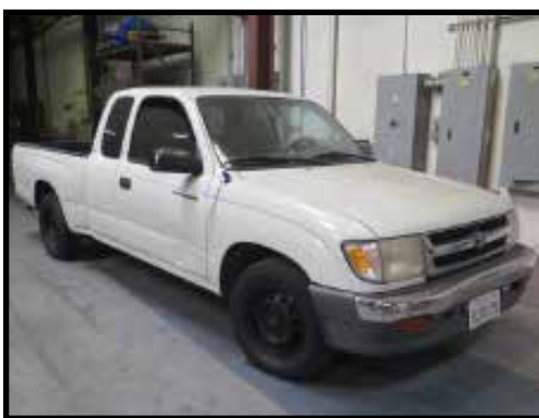
2000 Toyota Tacoma SR5 Extended Cab Pickup