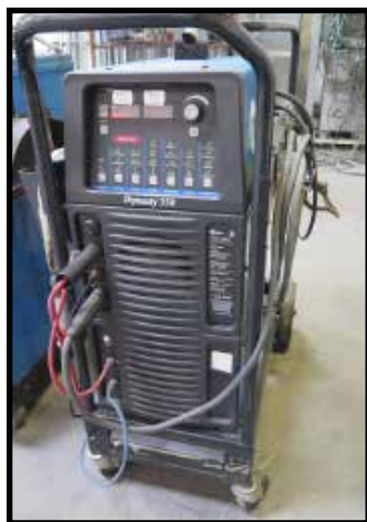
Miller Dynasty 350 Arc Welding