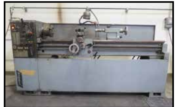
Bridgeport Romi 13" x 65" Geared Head Lathe