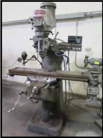
Bridgeport Series 1 – 2Hp Vertical Mill