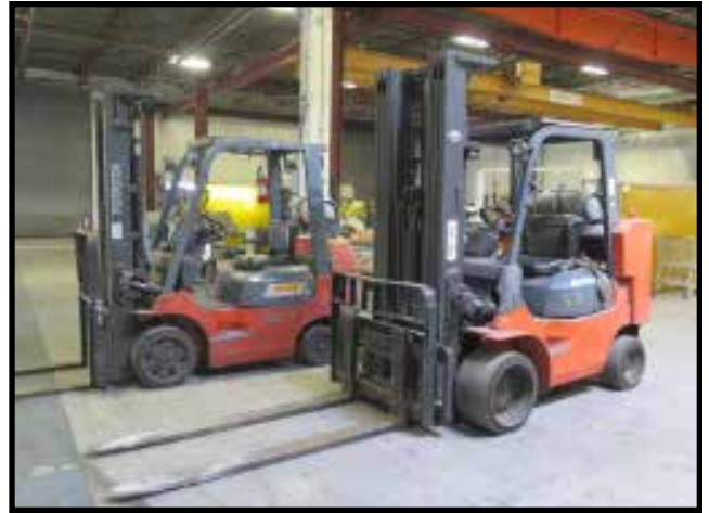
Toyota 7FGCU24-BCS 8850 Lb and 7FGCU30 5000 Lb LPG Forklift