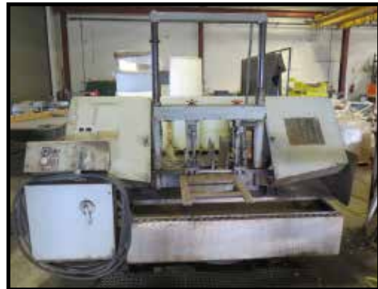
W.F. Wells 14" Double Beam Horizontal Band Saw