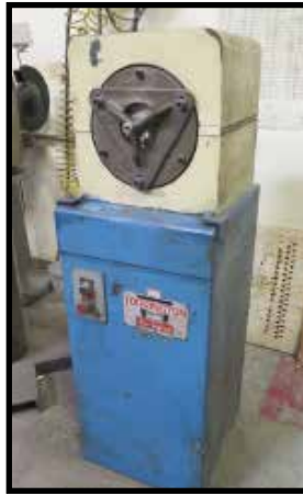
Harrington / Torrington Swaging Machine