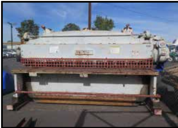
Cincinnati mdl. 2512 3/8" x 12' Cap Open Gap Shear