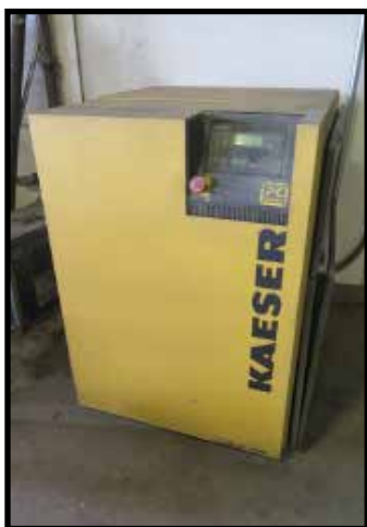
2000 Kaeser SK25 20Hp Rotary Air Compressor