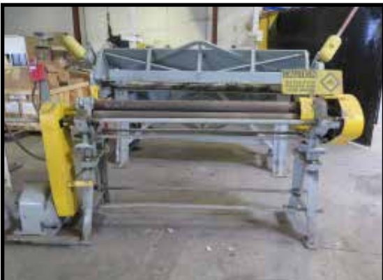
52" Power Roll