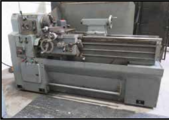
Cadillac 14" x 40" Geared Head Gap Bed Lathe