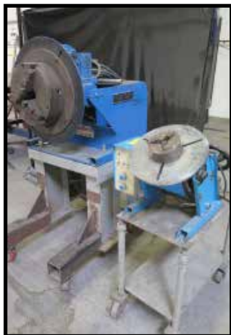
Preston-Easton 22" and Gentec 12" Welding Positioners