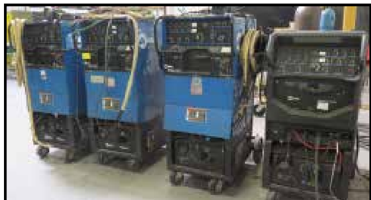
Miller Syncrowave Arc Welders