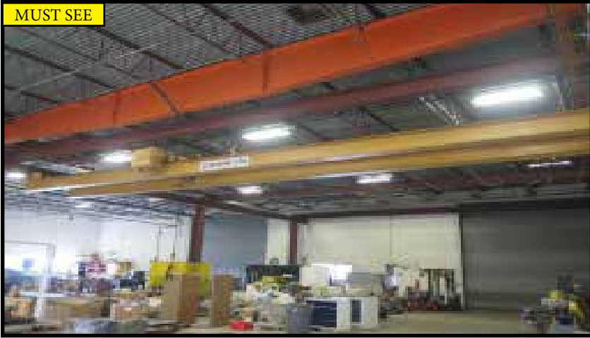
North American Crane 48' x 153' 3-Ton Cap 14-Post Free Standing Gantry