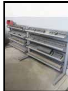
RAS Reinhardt mdl. RAS 62.30 TURBO bend PLUS CNC Electric Swivel Folding Machine s/n 25/7 w/ RAS System 5000 CNC Controls, 126" x 0.079" Cap., Controlled Back Gauging and Folding, Finger Brake Dies And Rack.