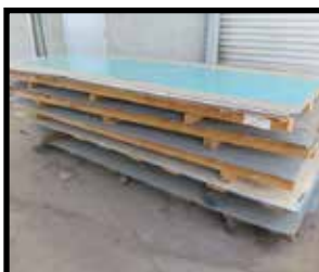
Kynar Coated Multi- Colored Sheet Stock