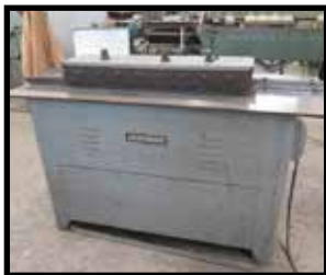
Lockformer 20GA 9-Roll Double Sided Roll Former s/n PL582.