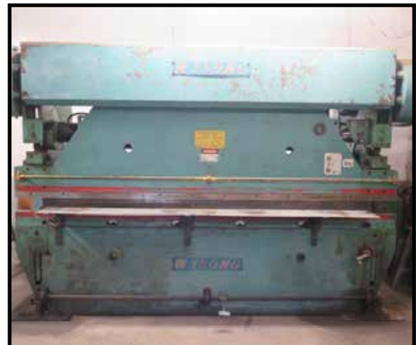
Wysong 90-10 90 Ton x 12' Press Brake