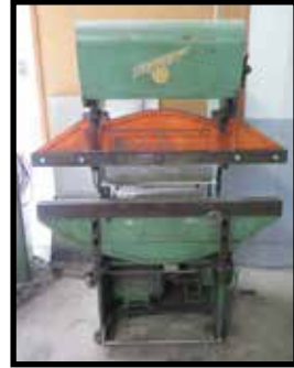
DiAcro 48'' Hydra- Power Press Brake