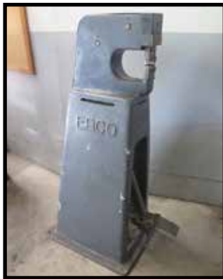
Erco mdl. 1447 Sheet Metal Shrinker