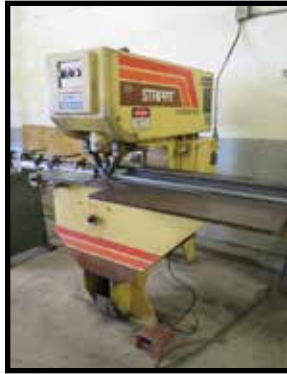
Strippit Custom 18-30 Fabricator Punch Press