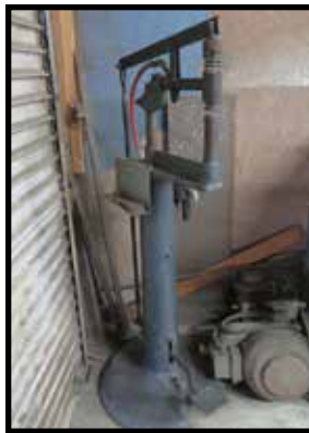
Aircraft Pneumatic Hammer Former