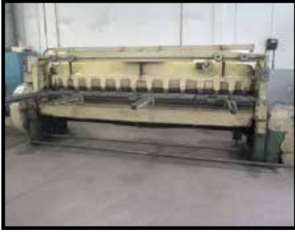
Wysong 10GA x 10' Power Shear