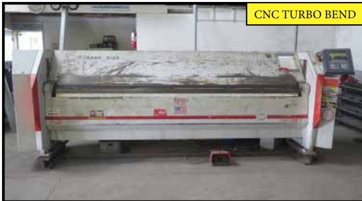
CNC TURBO BEND