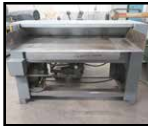
50'' Power Bead Roll.