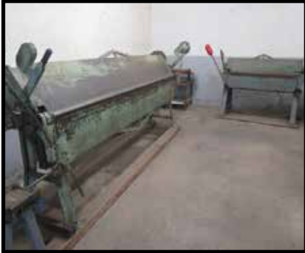
Chicago Size 10 10' Folding Brake s/n 64126.