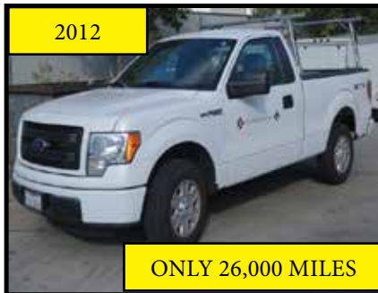
2012 Ford STX F-150 Pickup Truck w/ 3.7L "Flex-Fuel" Gas Engine