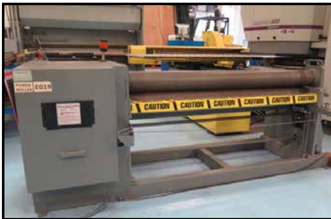
New Dimension P6.250 1/4" x 6' Power Roll