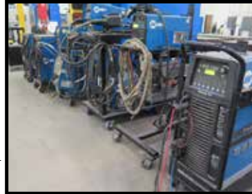
Partial View of Miller Welders Welding Department