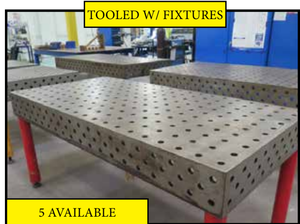
TOOLED W/ FIXTURES 5 AVAILABLE Demmeler 1m x 2m and 1m x 1m Precision Forming Tables - LIKE NEW