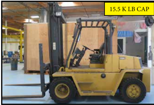
15.5 K LB CAP