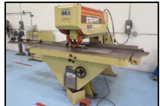
Strippit "Super 3030" Duplicator Punch Press

Directions : From Orange County, take I-5 South to HWY-78 East. Exit on Nordahl Rd. and turn right. Turn right on Andrasen Dr., then right onto Aldergrove Ave. Look for "Auction Today" signs.