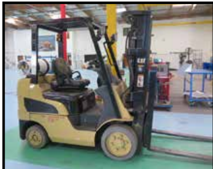
Caterpillar C5000 4750 Lb Cap LPG Forklift