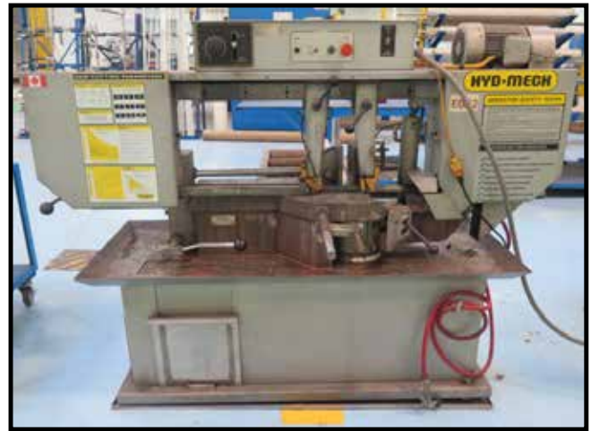
Hyd-Mech S-20 12" Miter Horizontal Band Saw