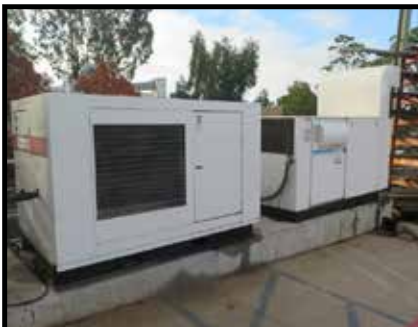
Ingersoll Rand and Gardner Denver 75Hp Rotary Air Compressors