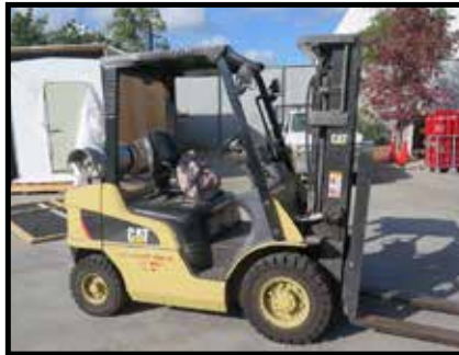
Caterpillar P5000-LP 4500 Lb Cap LPG Forklift w/ Yard Tires