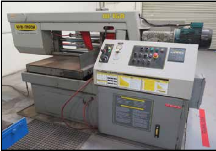
Hyd-Mech M-16A 16" Auto Hydraulic Horizontal Miter Band Saw