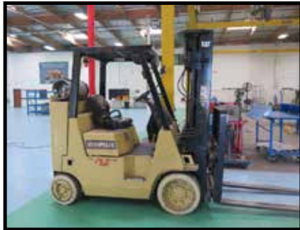
Caterpillar GC40KS1 7400 Lb Cap LPG Forklift