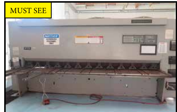
Cincinnati 135 CBIIx10' 135 Ton x 12' CNC Press Brake