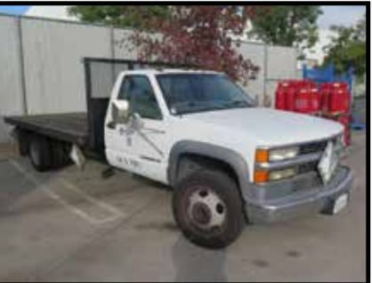
2002 Chevrolet 3500HD 12' Stake Bed Truck w/ Gas Engine