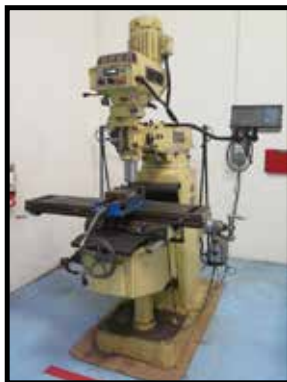
Acer Ultima 3VK Vertical Mill w/ Mitutoyo DRO