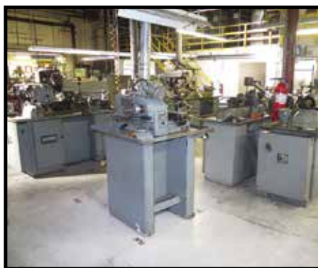
Hardinge Turning Department