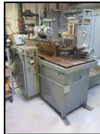
Eldorado MEGA M75-1041 Gun Drilling Machine