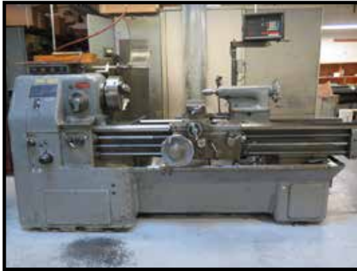
Okuma LS 22" x 64" Gear-Gap Lathe w/ Newall DRO