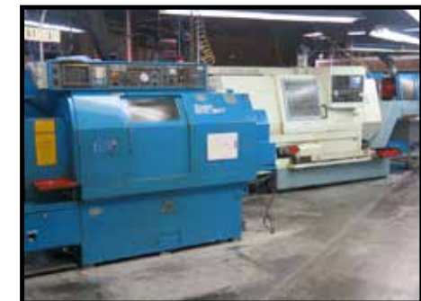
Eurotech and Miyano Multi-Axis Turning Centers