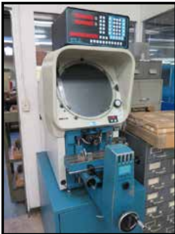
Deltronic DH14-MPC4E Optical Comparator