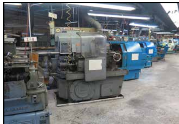
CNC Turning Centers and Automatics