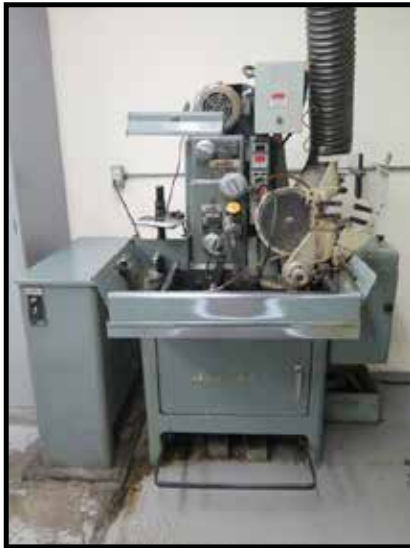
Sunnen MBB-1650 Precision Honing Machine