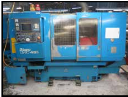
Miyano JNC-45S Twin Spindle Live Turret CNC Turning Center

(4) Miyano BNC-34T Twin Turret CNC Turning Centers s/n's BN30815T, BN30536T, BN30516T, BN30472T w/ Fanuc Series 0-T Controls, 6-Station Main Turret, 6-Station Axial Sub Spindle, No. 22 Colleted Spindle, Parts Catcher, Parts Conveyor, Coolant, LNS Hydrobar and Lexair Rhinobar Hydraulic Bar Feeds.