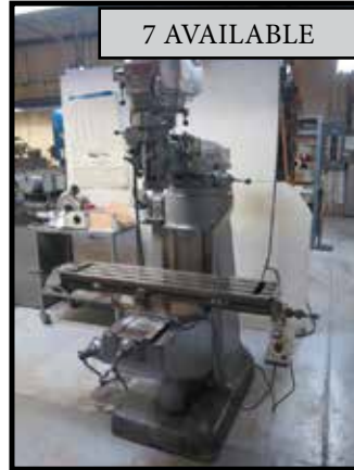
Bridgeport Vertical Mills ***7-AVAILABLE***