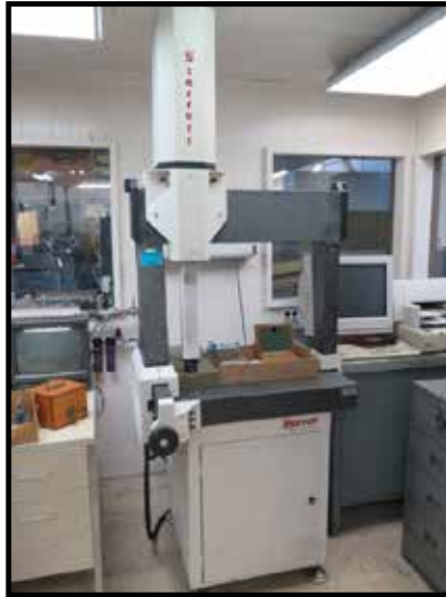
Starrett HGC 2018-16 CMM Machine