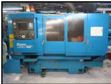
Miyano JNC-45T Twin Live Turret CNC Turning Center