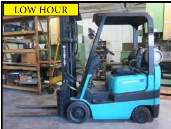
Mitsubishi FGC15K LPG Forklift