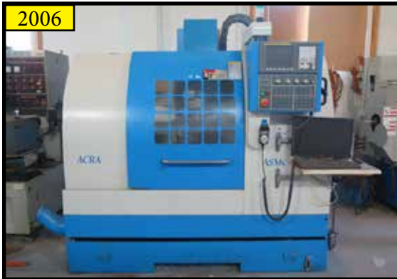
2006 Acra ASMC-610P CNC Vertical Machining Center w/ Fanuc Oi MATE-MC Controls