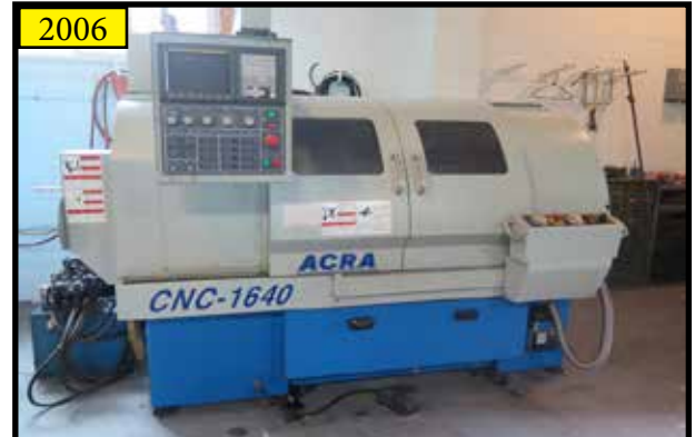
2006 Acra ASMC-610P CNC Vertical Machining Center w/ Fanuc Oi MATE-MC Controls