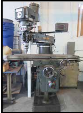
Lagun FTV-4 Vertical Power Mill