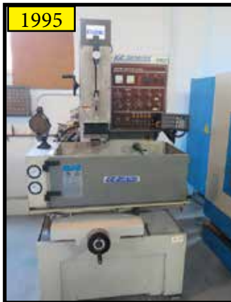
1995 EZ Spark mdl. ES1208C Die Sinker EDM Machine