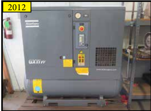
2012 Atlas Copco GX11FFEL Rotary Air Compressor

Mitsubishi FGC15K LPG Forklift s/n AT81D00537 w/ 3-Stage Mast, 188" Lift Height, Side Shift, 4th Accessory Lever, Cushion Tires, 7680 Metered Hours. 3 Ton Portable A-Frame Gantry w/ Coffing 3 Ton Electric Hoist. Big Joe mdl. 1066 Electric Die Lift s/n 318.