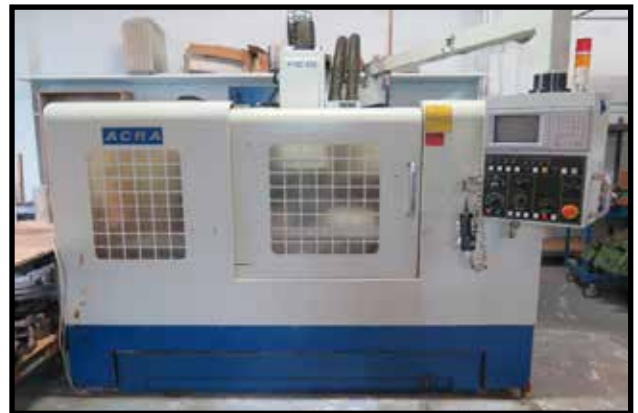
1999 Acra FVMC-810 CNC Vertical Machining Center w/ Mitsubishi Controls