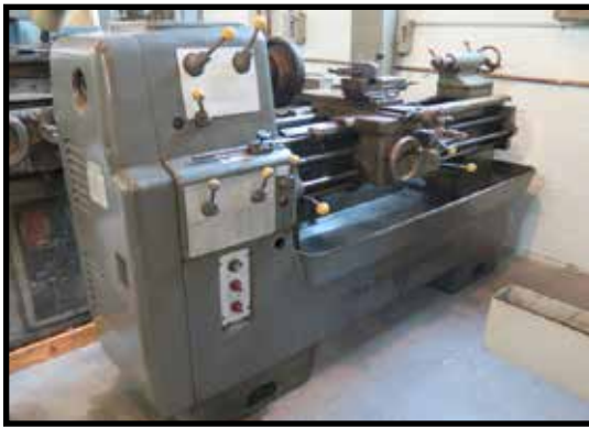
Saimp KSS180 14" x 42" Geared Head Gap Bed Lathe