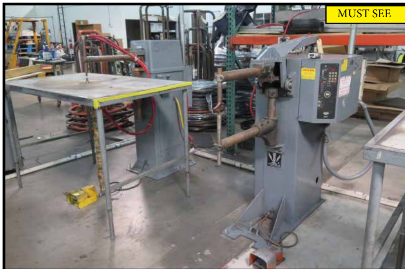
Acme Spot Welders