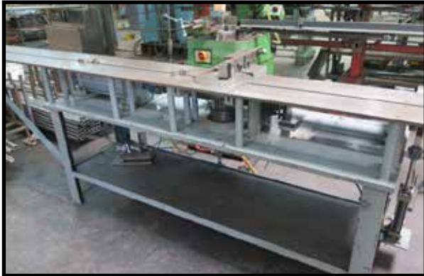
Custom 6-Setting Wire Bending Machine