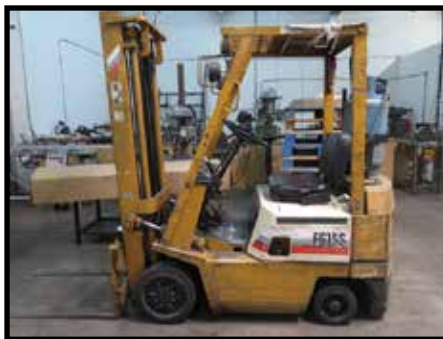
Komatsu FG18S-2 3000 Lb Cap LPG Forklift