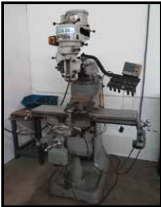
Acra Mill / Webb Vertical Mill w/ Mitutoyo DRO, Power "X" and "Y" Feeds