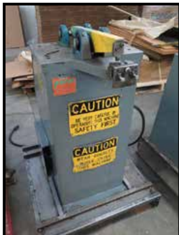
Penn Nibbler Machine