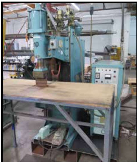
Kimura Denyoki Type SC-27P- 64 Mesh Spot Welder