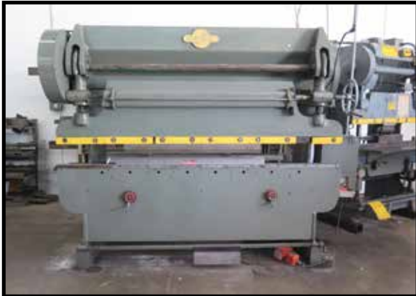
Milwaukee mdl. 25-6 16Ga x 6' Press Brake