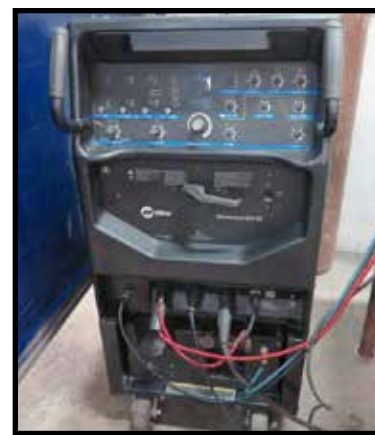
Miller Syncrowave 250DX Arc Welder