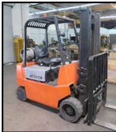
Hyster 5000 Lb Cap LPG Forklift