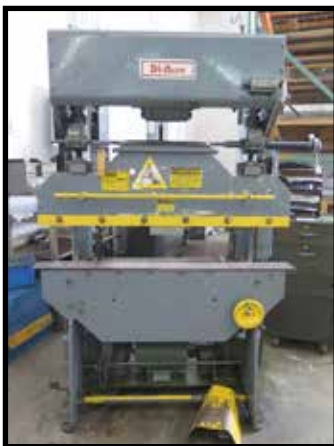
DiAcro mdl. 14-48- 2 14GA x 48" Hydra Power Press Brake