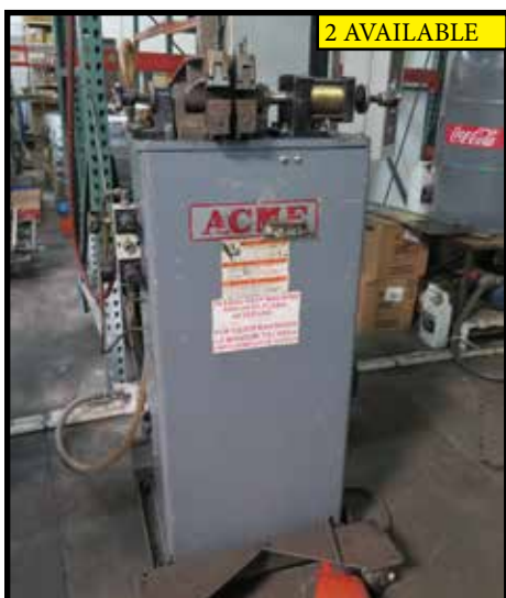
Acme Type B-01- 20 20kVA Butt Welder