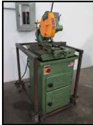
Doringer mdl. D350 Miter Cold Saw