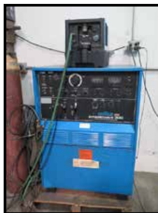
Miller Syncrowave 300 AC/DC Arc Welder