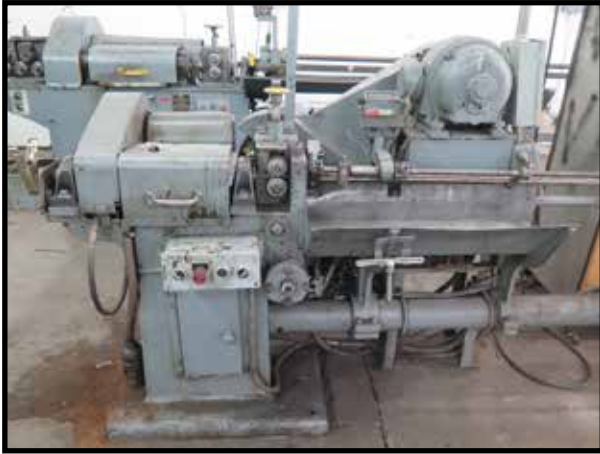
Shuster Machine 5-7- 9GA Cap Wire Machine