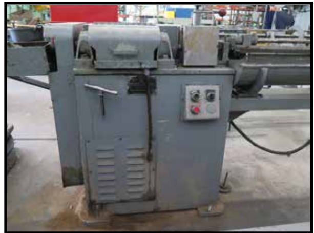
Shuster Machine 11-12GA p Wire Machine