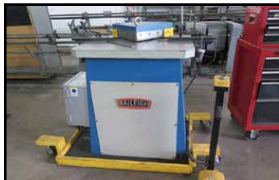
2013 Baileigh SN-F09- MS 8" x 8" Corner Notcher