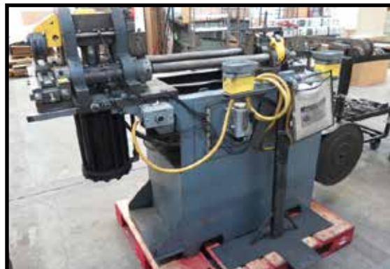
Cannon mdl. NC Hydraulic Tube Bender w/ Tooling