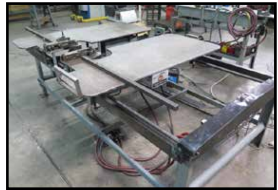
Lubow mdl. DWB Double Wire Bender