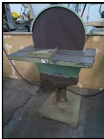
Conquest mdl. 20ARCH 20" Pedestal Disc Sander