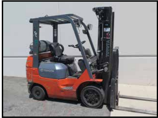
Toyota 7FGU25 4500 Lb Cap LPG Forklift