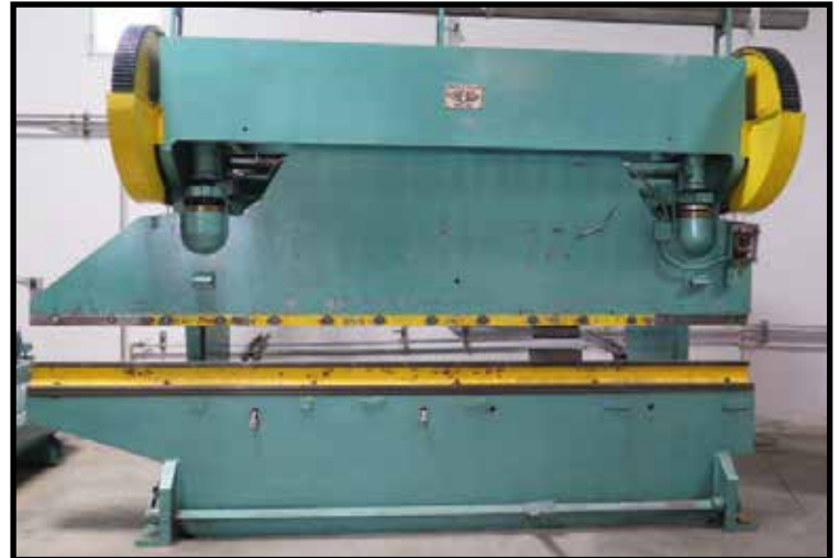
Chicago 180-Ton x 14' Press Brake s/n 6798 w/ Manual Back Gage, 124" Between Uprights, 18" Throat.