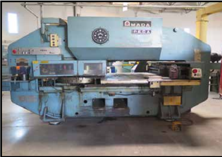
Amada PEGA-304040 30-Ton 58-Station CNC Turret Punch Press