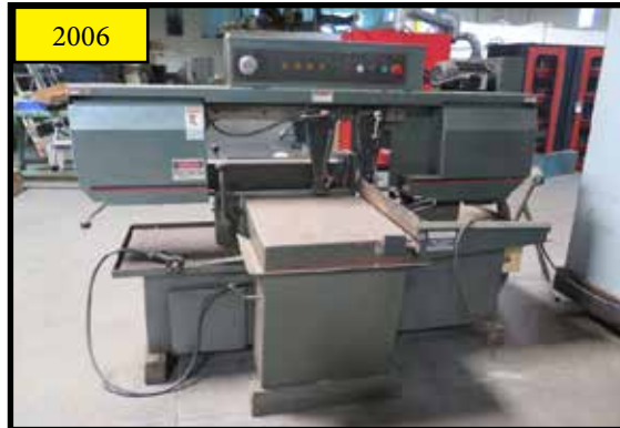
2006 Marvel mdl. 330S 13" Horizontal Miter Band Saw