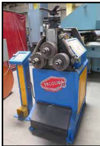
2004 Ercolina mdl. CE40MRS Roll Bender