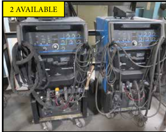
Miller Syncrowave 250DX Welding Power Sources