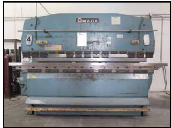
Amada RG-100 100-Ton x 10' Press Brake