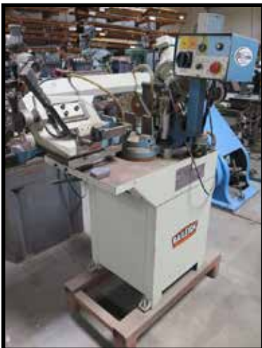
Baileigh mdl. BS-210M Miter Band Saw