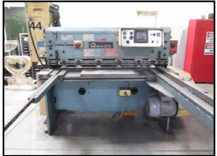
Amada M-1232 1/8" x 48" Power Shear