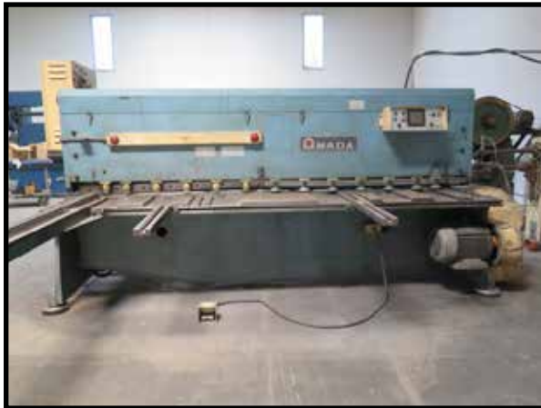
Amada M-3060 118" x .238" Deep Throat Power Shear