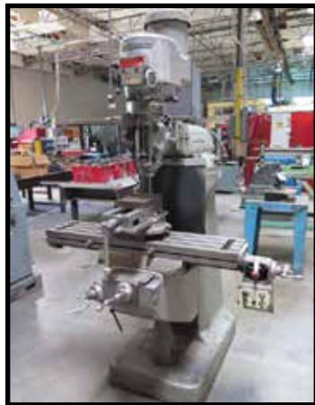
Bridgeport Series 1 - 2Hp Vertical Mill