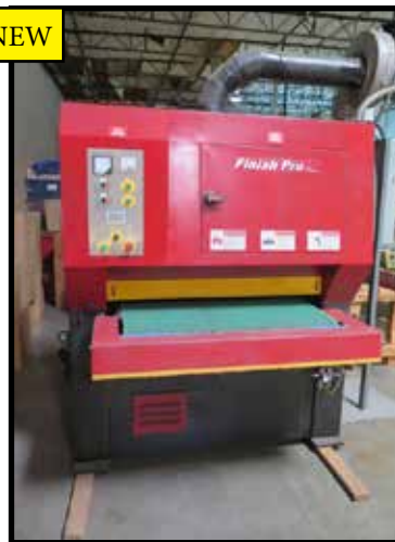
Gallop Machines "Finish Pro" FP-4075 40" Belt Grain