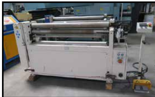
GMC mdl. PBR-0412E 48" x 12 GA Power Roll