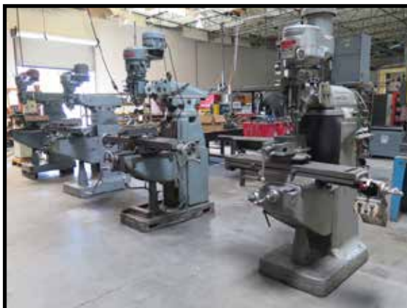
Bridgeport Vertical Mills