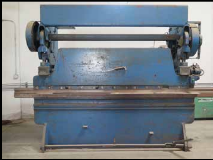
Verson No. 208 60-Ton x 10' Press Brake