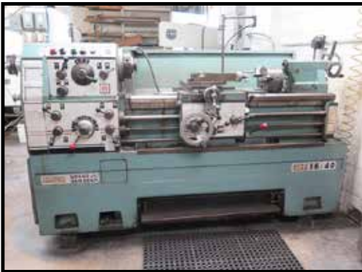
Namseon / Acra Turn 16" x 40" Geared Head Gap Bed Lathe

FS mdl. 445 10Hp Horizontal Air Compressor w/ 3-Stage Pump, 120 Gallon Tank.