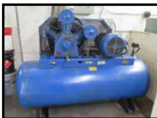
FS 10Hp Horizontal Air Compressor