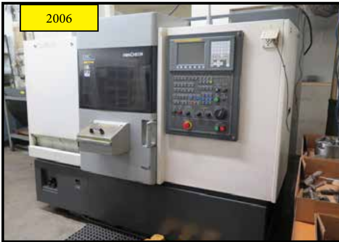
2006 HwaCheon CUTEX 160 CNC Turning Center w/ Fanuc 0i-TC Controls