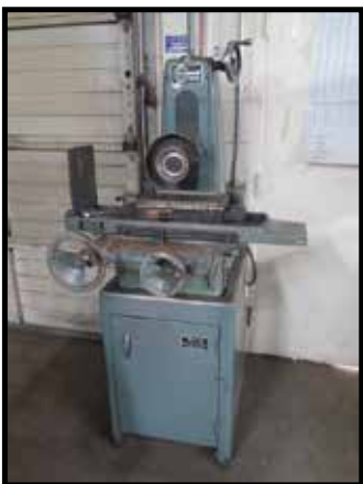
Harig "Super 612" Surface Grinder