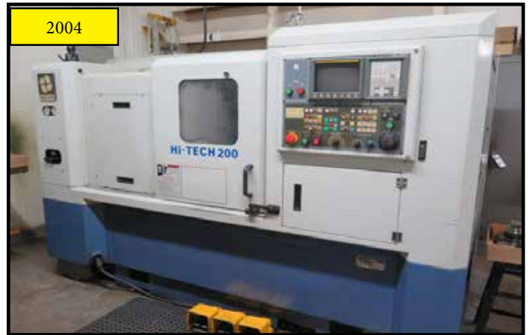
2004 HwaCheon Hi-TECH200AI CNC Turning Center w/ Fanuc 0i-TB Controls