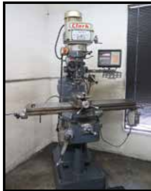
Clark Vertical Mill w/ Anilam Mini Wizard DRO