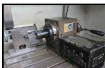
Fadal VH65 4 th Axis 6 1/2" Rotary Head