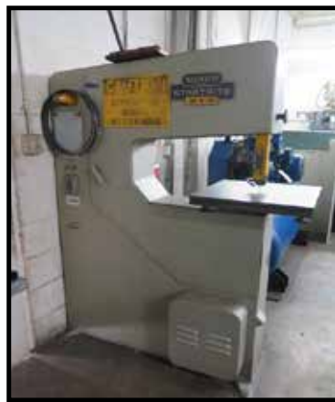
Kalamazoo Startrite 24-V- 10 24" Vertical Band Saw